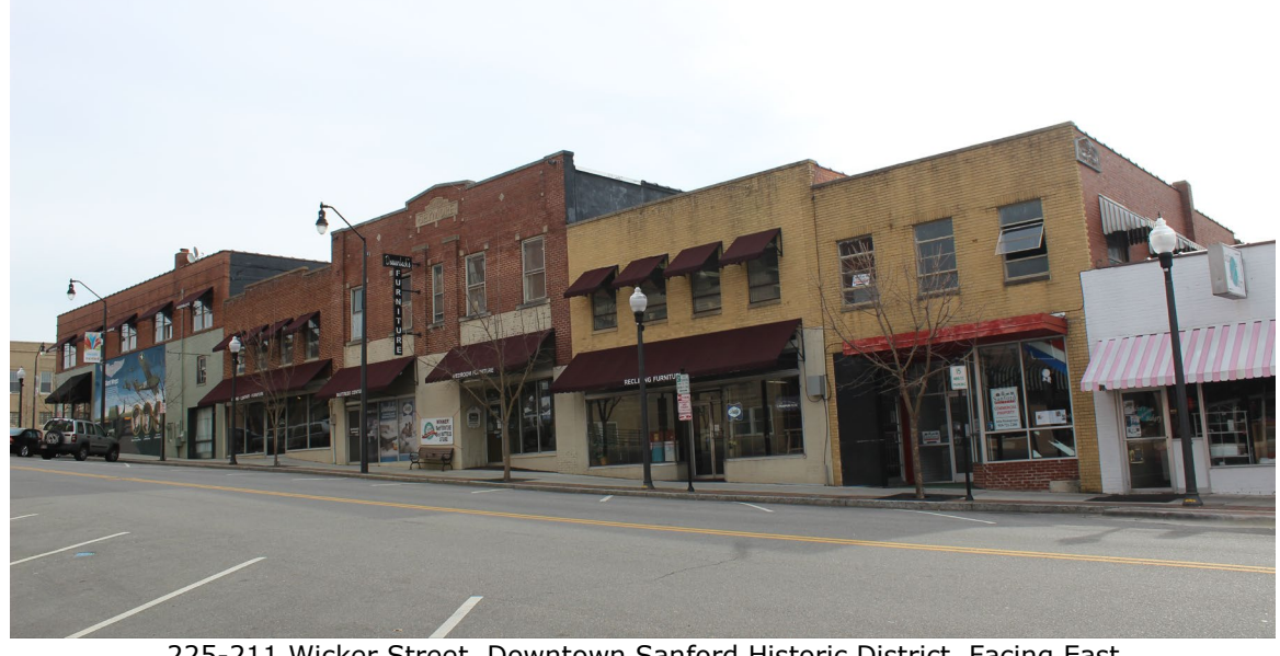
225-211 Wicker Street, Downtown Sanford Historic District, Facing East