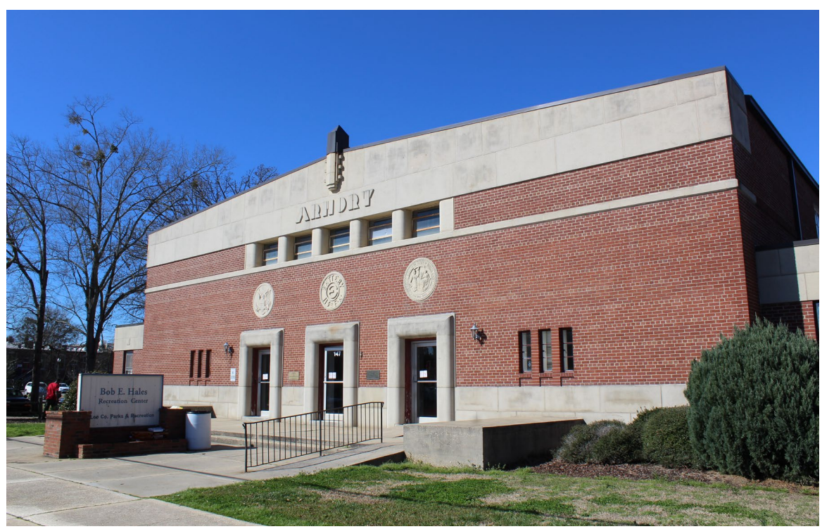
147 McIver Street, Downtown Sanford Historic District Boundary Increase, Facing West