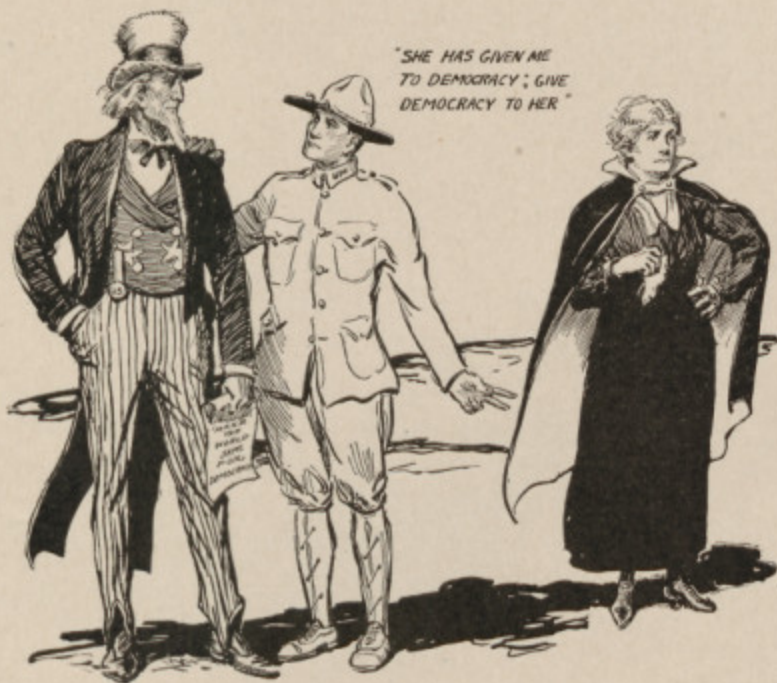
THE SOLDIER'S PLEA