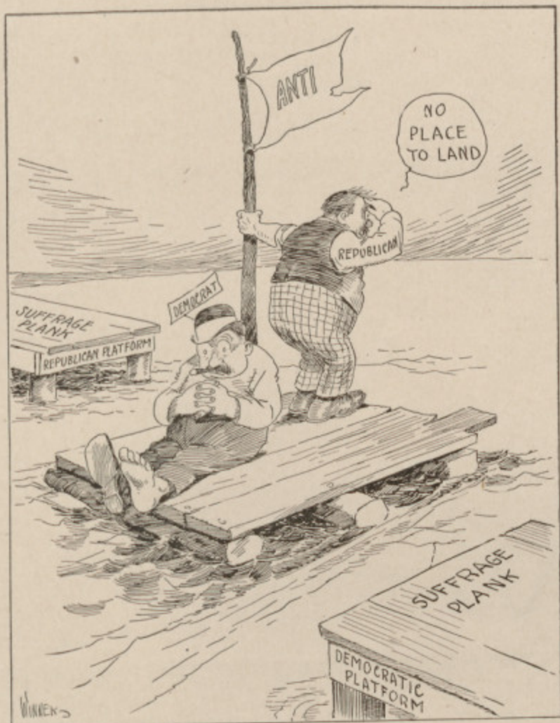
THE PARTY BETRAYERS