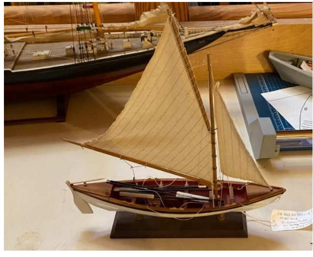
New England Whaling Boat

<u>Historical Significance:</u> small whaling boat kit model, donated with a large scrimshaw collection <u>Reason for deaccession:</u> out of museum's collecting area boat, kit model. Recommend local auction.