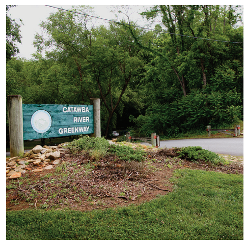
Catawba River Greenway, Morganton, NC