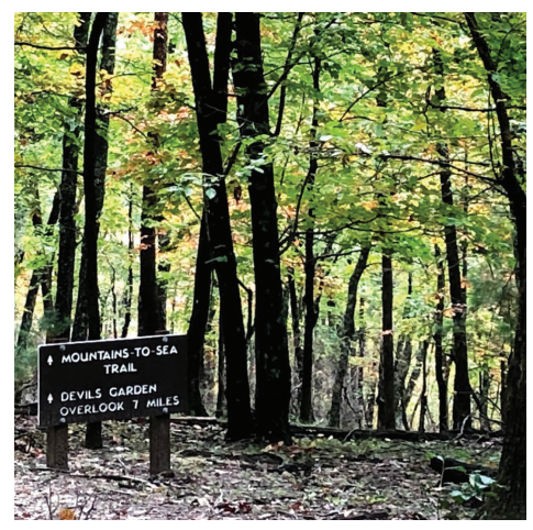
MST in Stone Mountain State Park