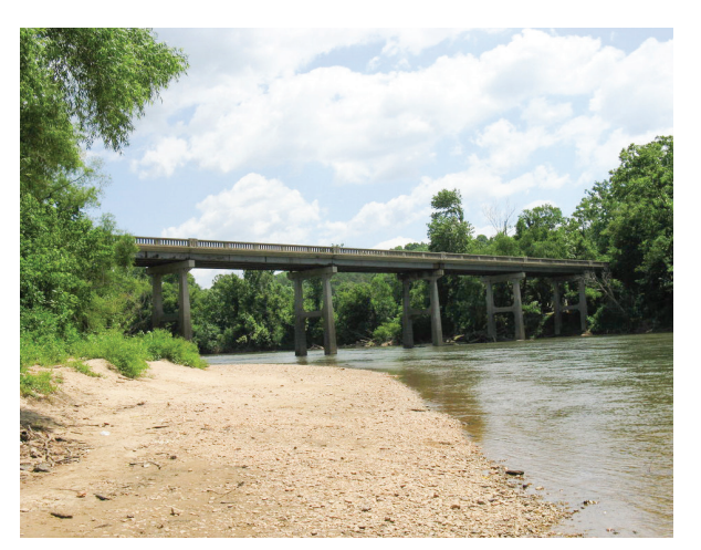
Donnaha Access on the YRST