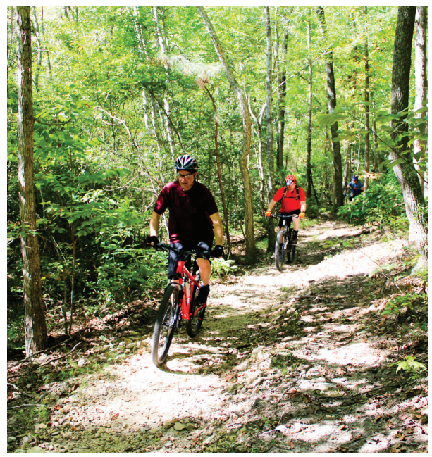
Mountain Biking at Medoc Mountain State Park

Each year, a trails report is submitted to outline trail needs, describe additions to the State Trails System and summarize importance of trails in the system. This report is composed by the NC Trails Program for the Secretary of DNCR in accordance with General Statute 143B-135.102.