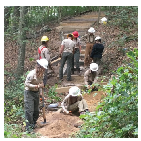
CCNC group repairing stairs at Cliffs of the Neuse State Park

In the 2019 – 2020 fiscal year, the N.C. Division of Parks and Recreation partnered with the Conservation Corps of North Carolina (CCNC) to create sustainable trails while providing employment and on-the-job training to young adults . The NC Trails Program's Regional Trail Specialists provided expert trail design and trained the CCNC crews in sustainable trail construction techniques. This collaboration resulted in low-cost trail construction, trail maintenance, corridor clearing and downed tree removals at several parks across the state. By the fall of 2019, trail projects were completed at Cliffs of the Neuse, Jones Lake, Eno River, Hanging Rock, and New River state parks and at Mount Jefferson State Natural Area.