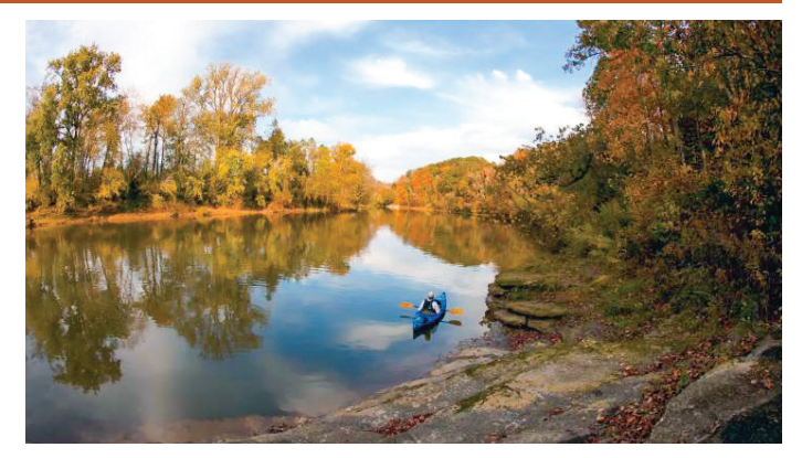
Yadkin River State Trail

Each state trail is a unit of the state parks system and must be authorized by the General Assembly. When any new state trail is added to the system, the Division of Parks and Recreation (Division) engages in a planning process, including a feasibility study for the new trail. Effective planning is essential to determine a corridor for the trail and identify potential partners. Planning includes extensive data collection, outreach to potential partners, public input, and mapping of the trail corridor.