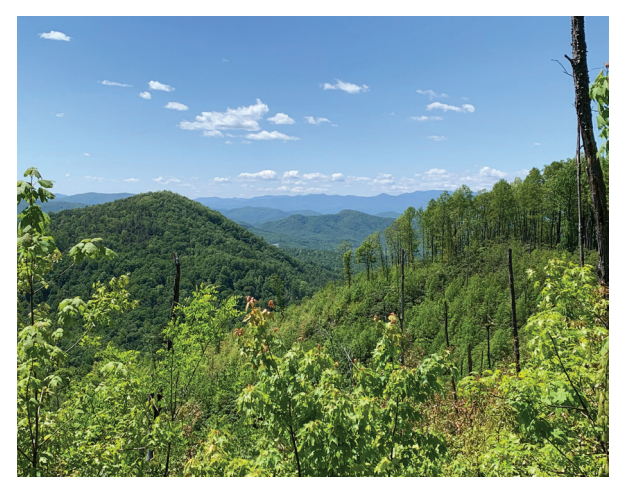
Future vista on the WGST