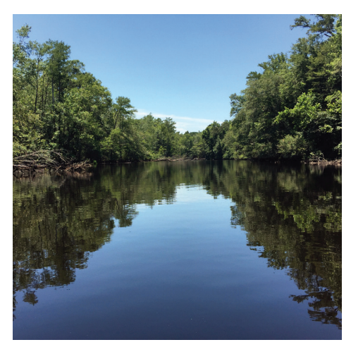
Lumber River State Park