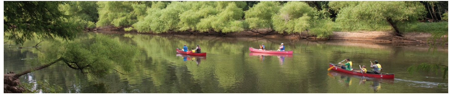
Cliffs of the Neuse State Park