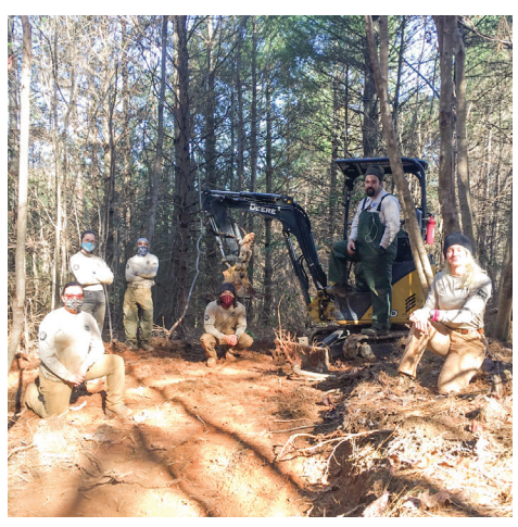
CCNC at Lake James State Park