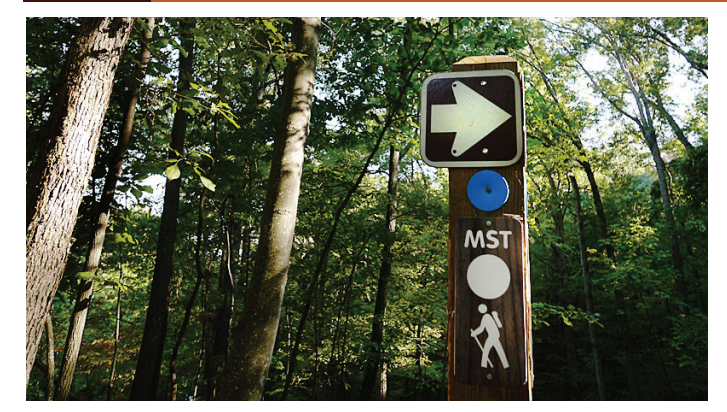
Mountains-to-Sea State Trail at Pilot Mountain State Park