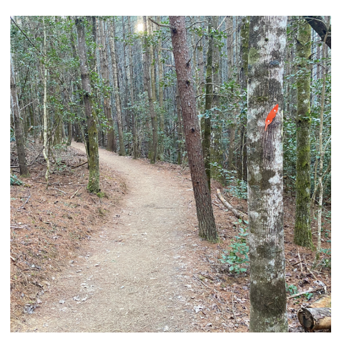
Completed segment of the FFST