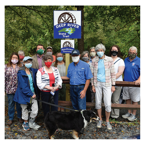
Sign dedication on the DRST