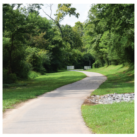
Clayton Riverwalk Greenway – MST