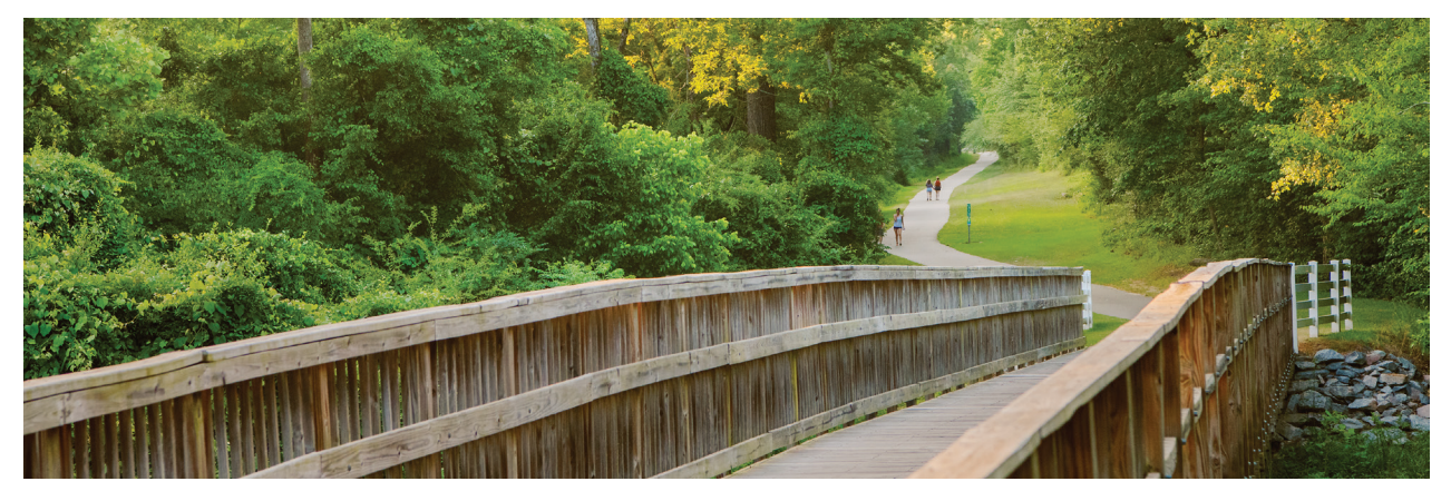
Mountains-to-Sea State Trail, Clayton, NC

In early 2020, the COVID-19 pandemic swiftly disrupted the lives of everyone in the nation. The citizens of North Carolina certainly felt a variety of impacts on their lives that caused a great deal of stress. Many forms of stress suddenly occurred for individuals and families related to unemployment, risk of illness, remote learning, working from home and general uncertainty of when life may return to some semblance of normalcy. In addition, many frontline workers and other employees cannot work from home and had to face the daily threat of exposure. While dealing with these stresses, many healthy exercise and recreational outlets like gyms and health clubs were no longer an option. It was clear to the field staff of our state parks that an abundance of people discovered our parks and trails were a relatively safe and healthy option for exercising and recreating. Record-setting increases in visitation and concern for properly protecting staff and visitors resulted in some parks being closed temporarily beginning in mid-March of 2020.