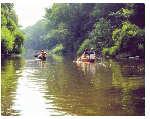
Deep River State Trail