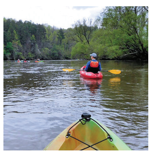
Paddling the FBST