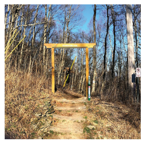
Trombatore Trail — a future segment of HGST

The Overmountain Victory State Trail will follow 225 miles of the planned route of the National Historic Trail that passes through North Carolina. The Division will work with the National Park Service, Overmountain Victory Trail Association, county and municipal governments and local sponsors on the development of the trail.