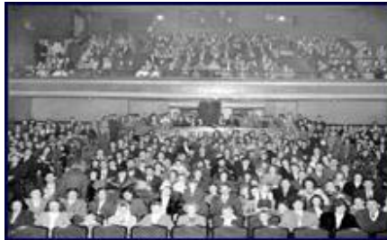
Sunset Theater, historic photo

We encourage you to join us for our February National Register Advisory Council meeting, Thurs., Feb 9th. Presentations will be made on Scotts and Roberts Dry Cleaning in Durham; the Penland Post Office and General Store, Penland; and other properties.