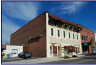
Sunset Theater, 2011