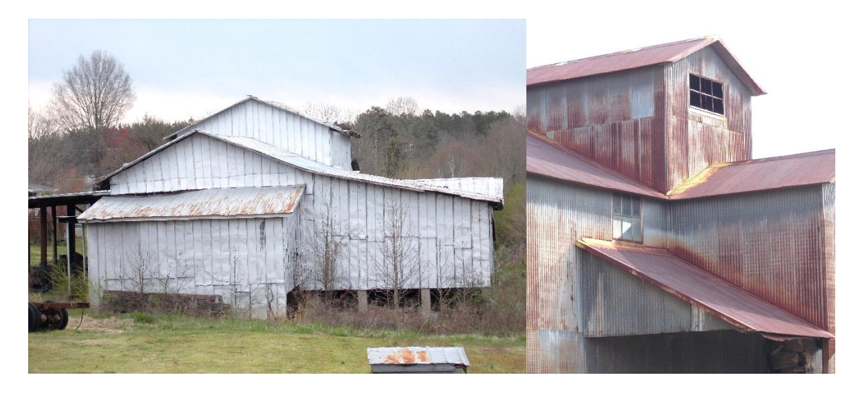
The Casar Cotton Gin in Casar (left) and the Polkville Cotton Gin in Polkville (right, detail).

In addition to the vast facilities at PPG and Fiber Industries were many other period industrial plants, both large and small. Goforth Brothers (Southco Industries) at 1840 E. Dixon Blvd. in Shelby (CL1622) is unusual in that uses for the structure of its metal-fabricating hall the former grandstand of Churchill Downs in Louisville, Kentucky. Built in 1913, the grandstand was moved to Charlotte in 1939 where it served as bleachers and an exhibit building for the Southern States Fair. When the fair closed in 1960 Goforth Brothers acquired the grandstand and by 1963 or 1964 had reassembled it at its current site. At the small end of the spectrum is the Waco Milling Company at 2253 Cherryville Rd. in Waco (CL1625). The concatenated row of frame and cinder block buildings, some from the period and some apparently earlier, was owned and operated by Arthur Boyd Stroup and his wife, Essie Sellers Stroup, who ground feed for local farmers. Earlier than the period but surveyed as part of the Elliott Farm at 235 Mount Zion Church Rd. near Polkville (CL1600) is the A. J. Elliott Tanyard, an early twentieth century facility for tanning hides that survives as a ruinous poured concrete tanning vat. Country tanyards were once ubiquitous in the South but have left few above-ground traces, the Elliott tanyard being a notable exception.