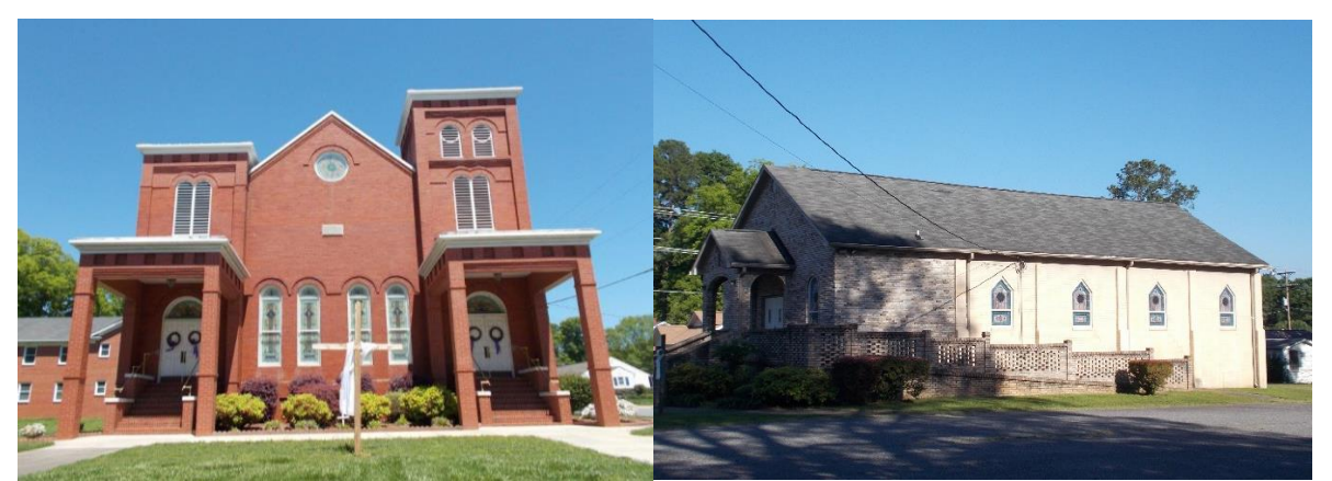
Dallas Baptist Church (left) and Humphrey Chapel A.M.E.Z. Church (right)

Residential development along West Trade Street and adjacent streets prompted the construction of churches for the town's principal white congregations. The 1914 Dallas Baptist Church at 402 W. Trade (GS0467) is a brick-veneered Romanesque-influenced building with dual front towers (one taller than the other) and round-arched stained-glass windows. The 1950 First Presbyterian Church of Dallas at 412 W. Trade (GS3261), built by Clarence Thornburg, blends the Gothic Revival and Colonial Revival styles in its wall buttresses and entry embrasure (Gothic) and multi-stage steeple (Colonial). Churches are the chief surviving historic resources associated with the Dallas African American community. The 1939 former building of First Baptist Church, Dallas at 308 S. Rhyne (GS3282) has a small cemetery, as does the ca. 1950 Humphrey Chapel A.M.E.Z. Church at 603 W. Main (GS3270). Humphrey Chapel has an original rear portion of brick or brick-veneer construction with buttresses and triangular-headed stained glass windows along the sides and a more recent front addition (possibly ca. 1980) with variegated brick veneer in shades of off-white, tan, and brown.