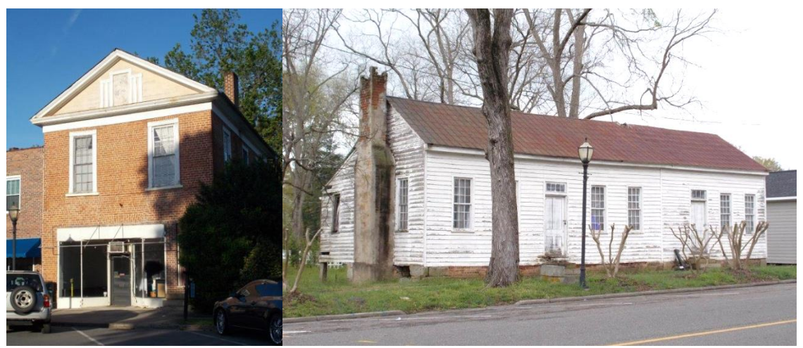
Rhyne Store (left) and Smyre-Pasour House (right)

Court activity attracted businesses and residents who built stores and dwellings facing onto the square. The grandest of these early buildings is the 1852 Hoffman Hotel at 131 W. Main (GS0010), a three-story brick building with a full-façade two-story porch. The building, which ranks among the state's oldest hotels, has been meticulously restored and now houses the Gaston County Museum.<sup>5</sup> Another early brick building is the two-story 1850 Rhyne Store at 130-132 N. Gaston (GS0011), which features a pediment with a Greek Revival window or vent surround. Among the early residences that front onto the square are the 1850 Smyre-Pasour House at 113-115 N. Holland (GS0012), a one-story frame building with a symmetrical five-bay original section and a three-bay extension made ca. 1870. Next door is the 1850s Roberts-Lewis House at 103 N. Holland (GS0446), a two-story frame dwelling with extensive modern additions related to its current use as a restaurant.