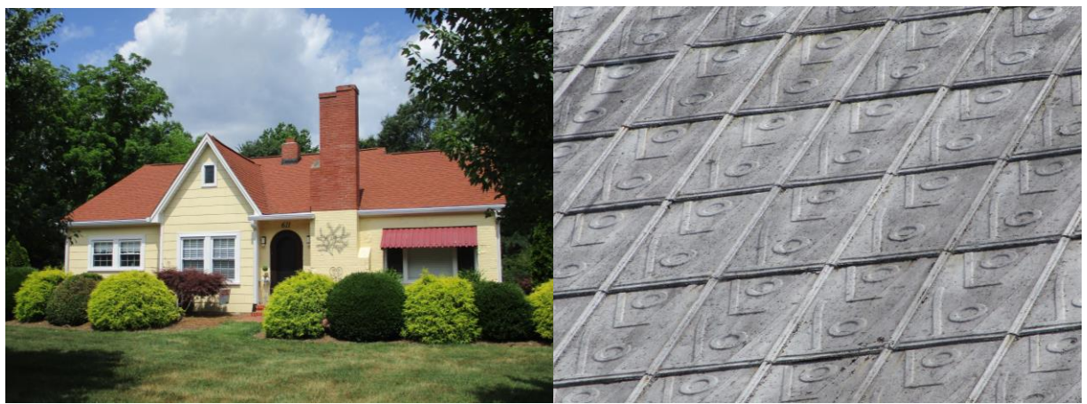
Period Cottage at 611 N. Oakland (left) and locally made metal shingles on the roof of the house at 308 N. Holland (right)

the 1940s B. Hughes Durham House at 105 S. Maple (GS3272), which has characteristic features of the style such as nested double front gables, the smaller of which covers an entry porch with segmental-arched openings, and an arched sitting porch under a roof extension at one end. The epitome of the period's eclecticism, with its decorative parapets, Spanish tile copings, and corbeled pillars supporting a front drive-through canopy, is the ca. 1940 Mission-style Brewer's Sinclair Service Station at 203 W. Trade (GS3254).