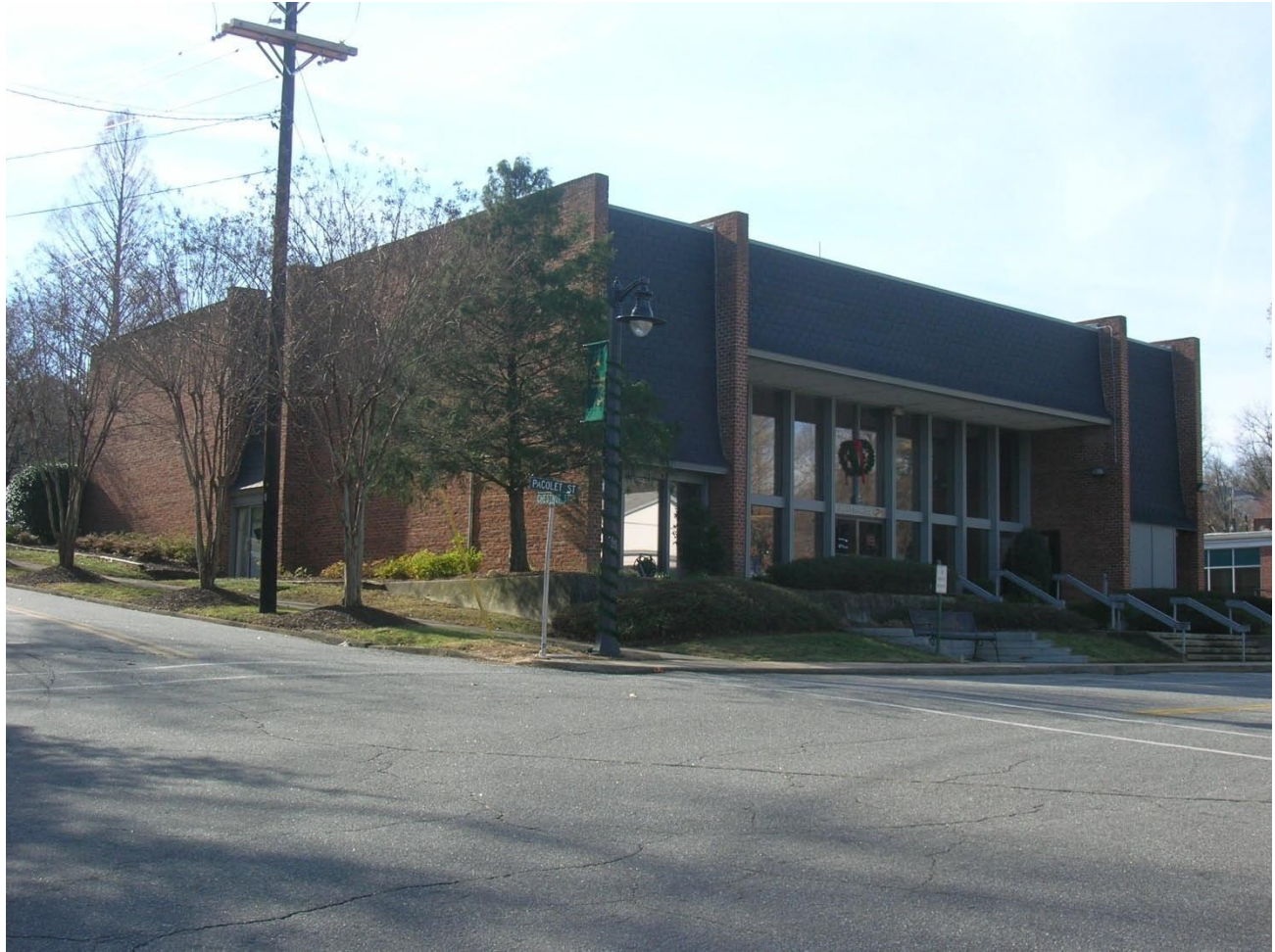
PL 107 – North Carolina National Bank, 201 Chestnut Street