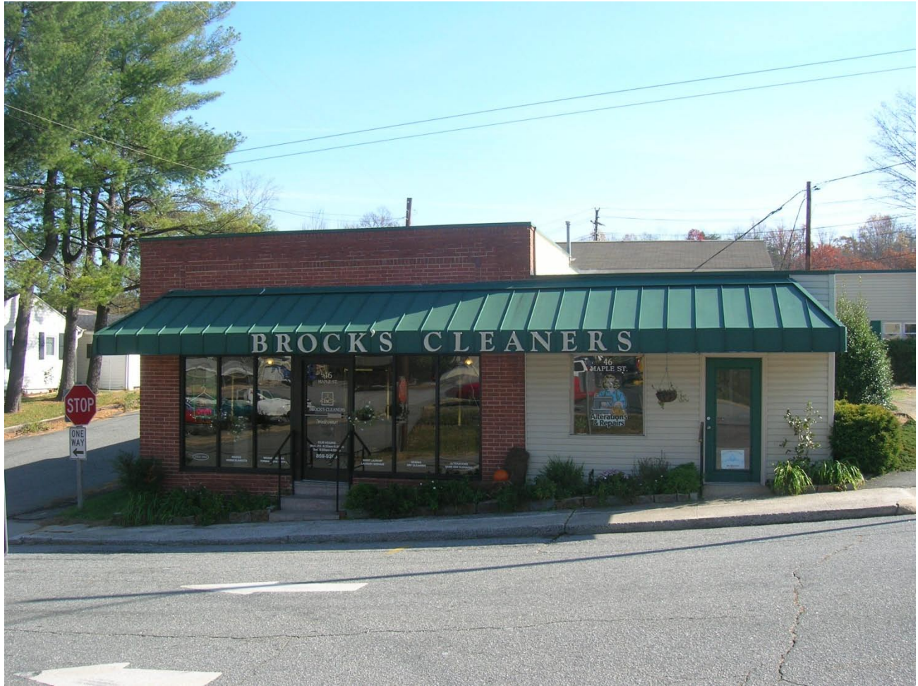
PL 67 – Brock's Cleaner's, 46 Maple Street