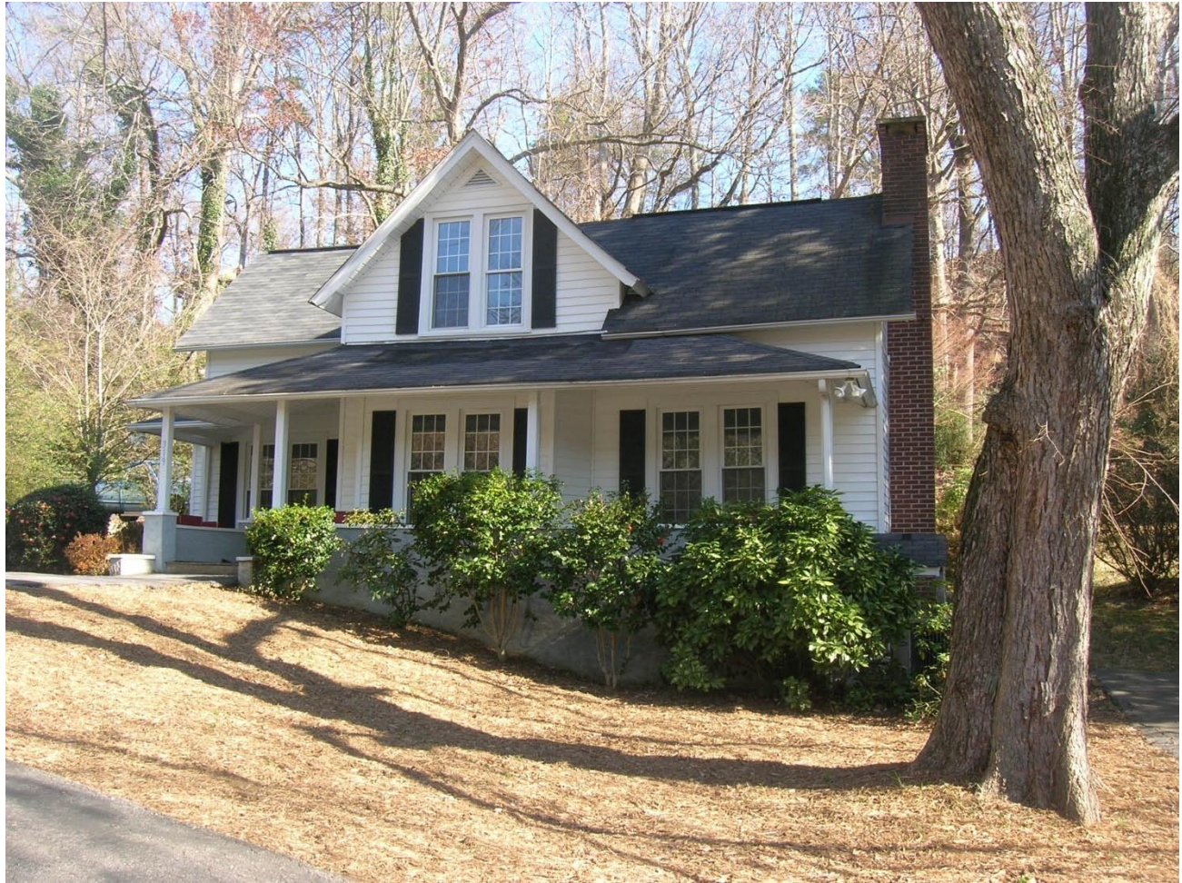
PL 89 – House, 319 S. Trade Street