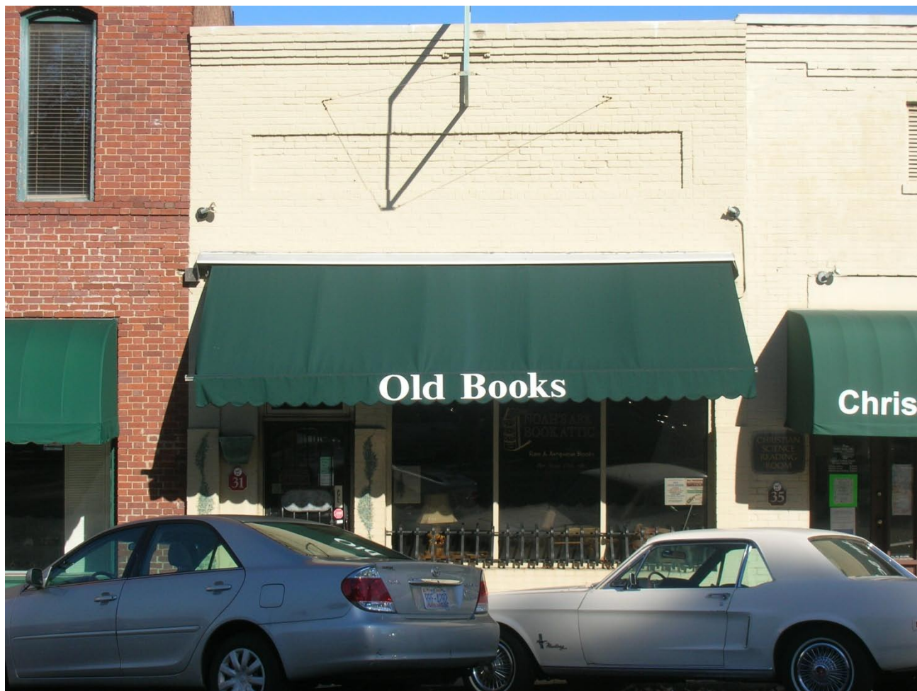
PL 75 – Commercial Building, 31 S. Trade Street