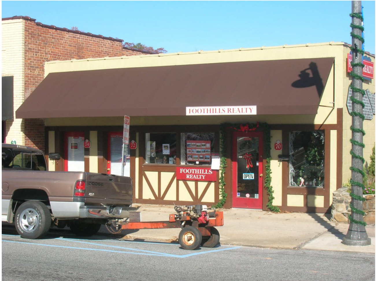
PL 135 – Commercial Building, 70-74 N. Trade Street