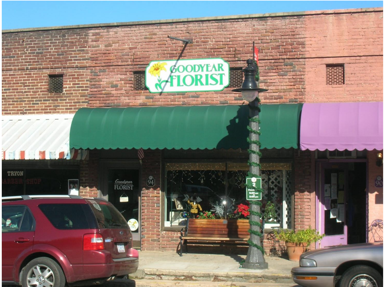
PL 140 – Commercial Building, 94 N. Trade Street