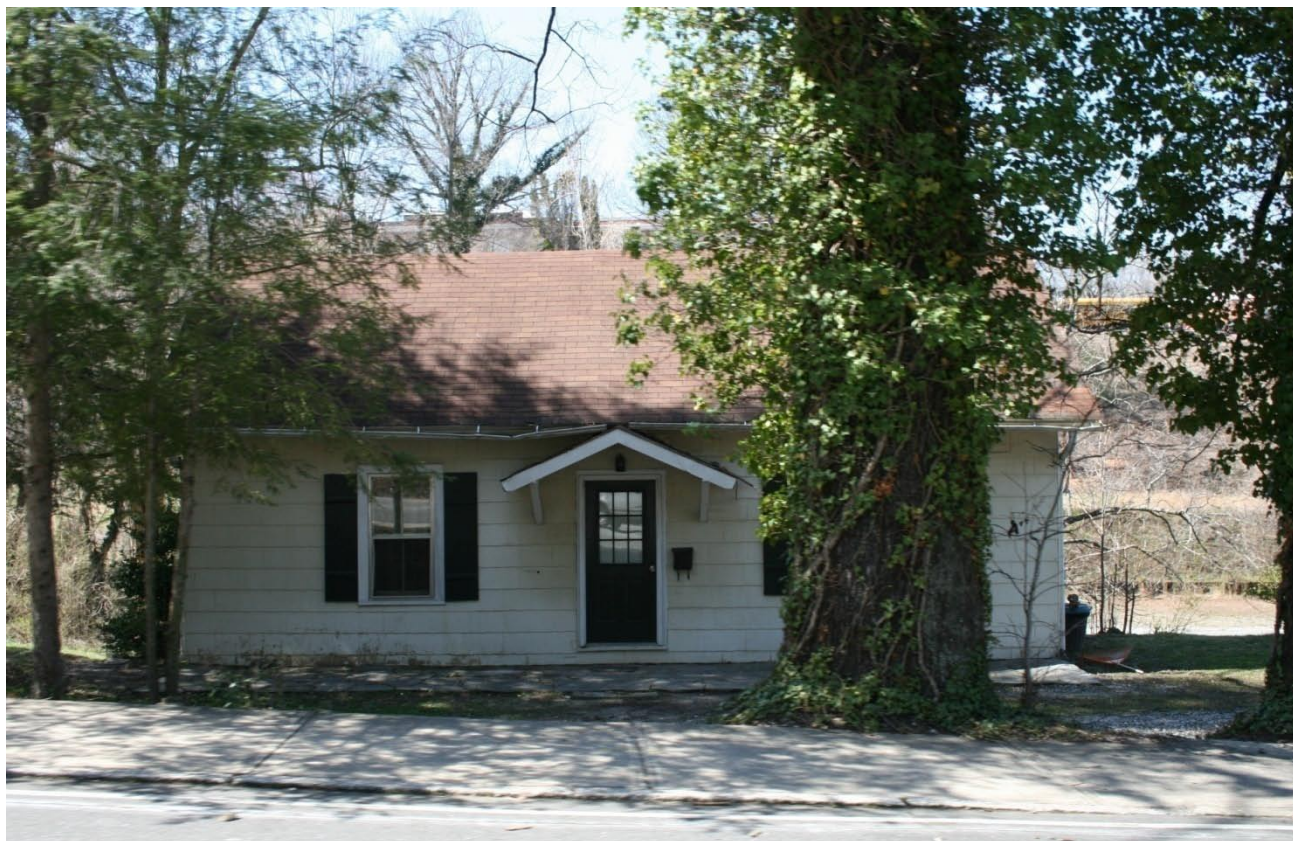
PL 92 – Wilson House, N. Trade Street