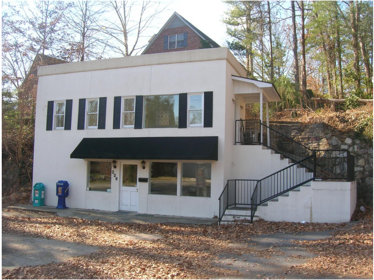
PL 62 – Commercial Building, 226 S. Trade Street