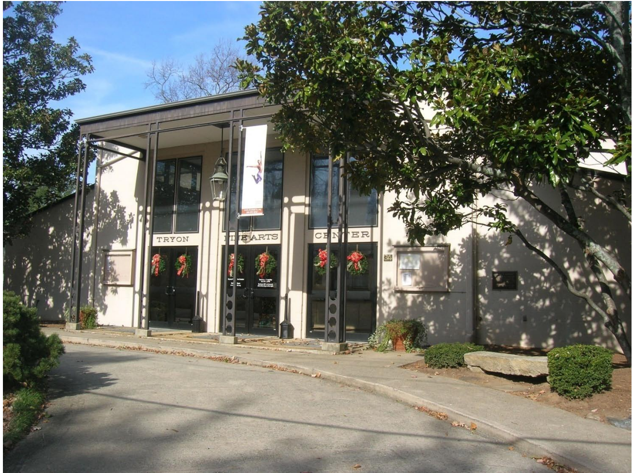
PL 106 – Tryon Fine Arts Center, 34 Melrose Avenue