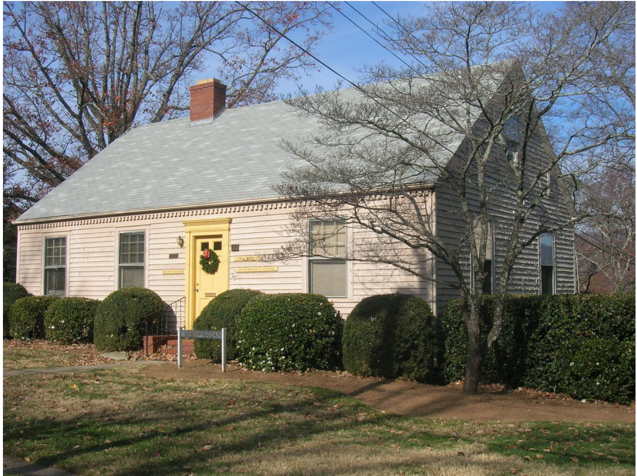
PL 153 – Kell House, 50 Melrose Avenue