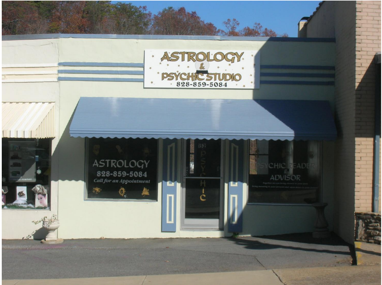
PL 145 – Commercial Building, 152 N. Trade Street