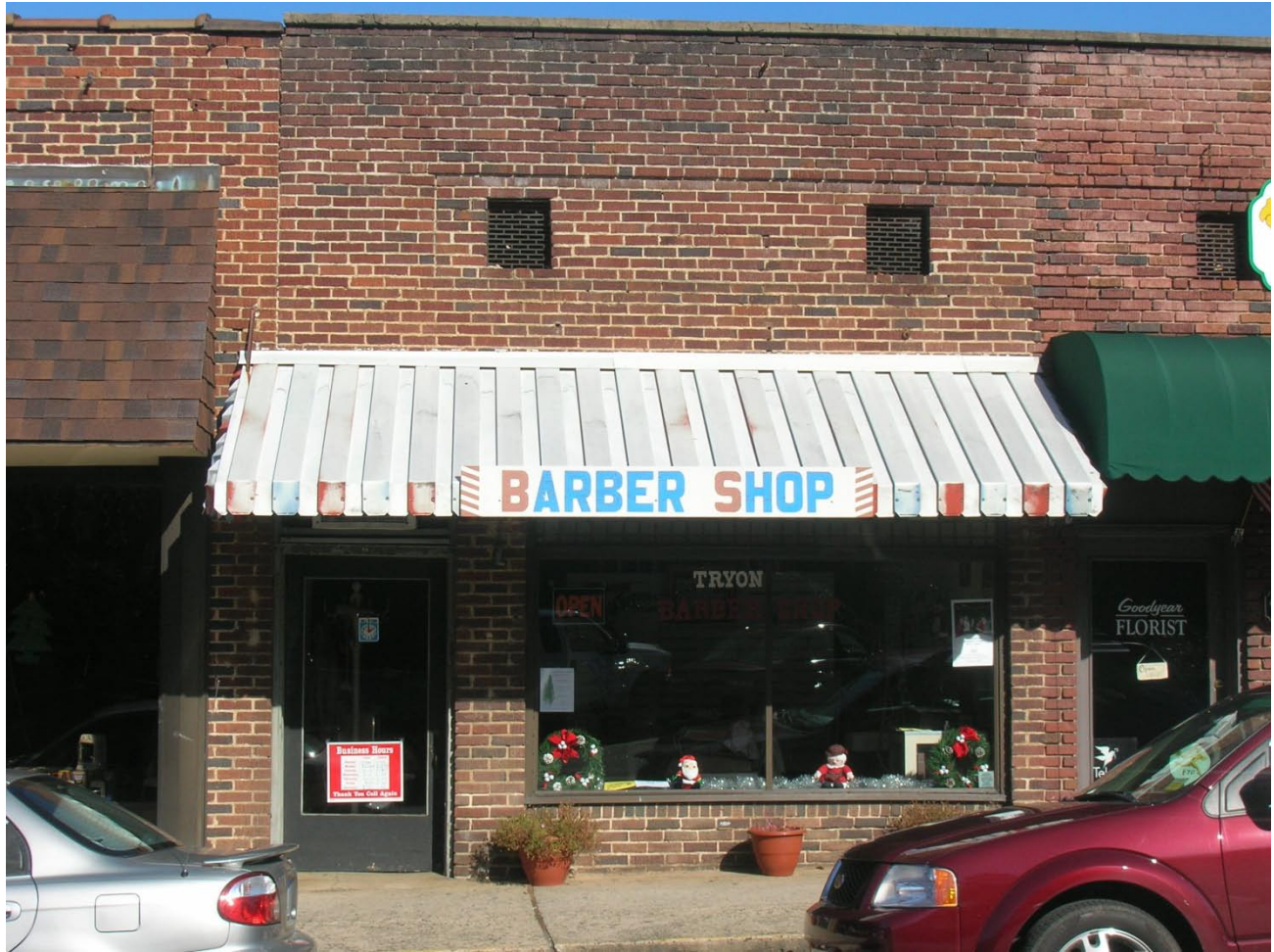
PL 141 – Tryon Barber Shop, 98 N. Trade Street