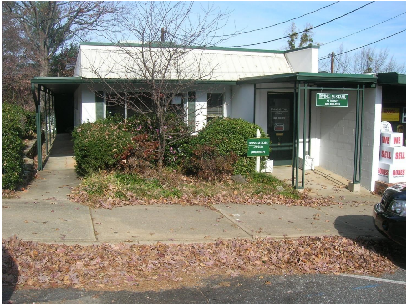
PL 98 – Commercial Building, 98 Pacolet Street