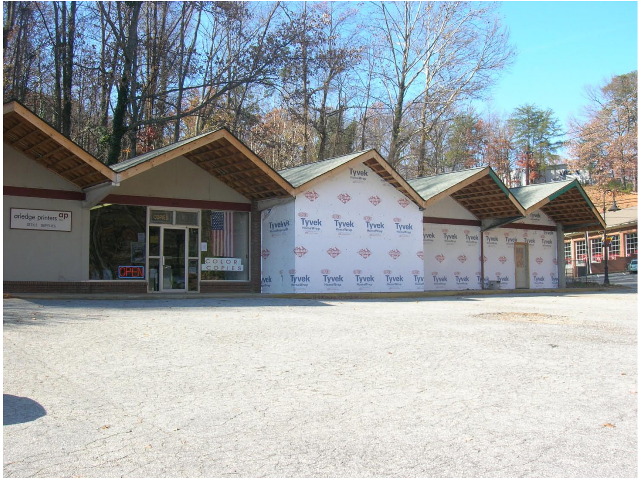
PL 116 – Arledge Printers, 255-257 N. Trade Street