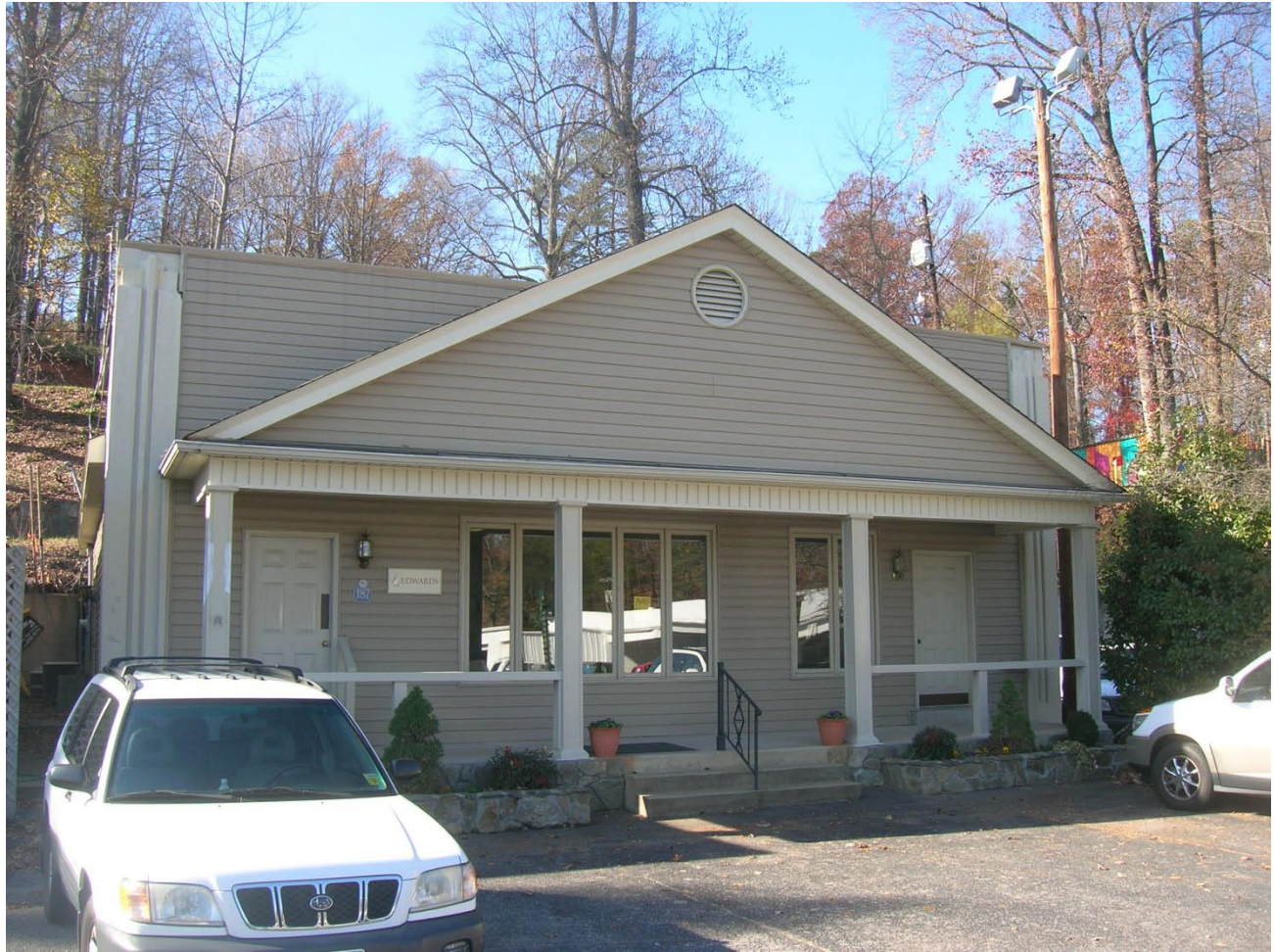
PL 118 – Commercial Building, 187 N. Trade Street