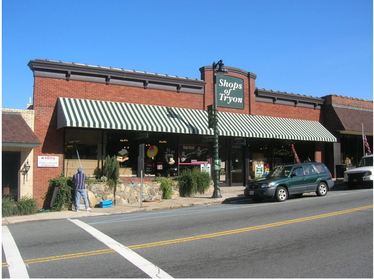
PL 142- Cowan's Supermarket, 112 N. Trade Street