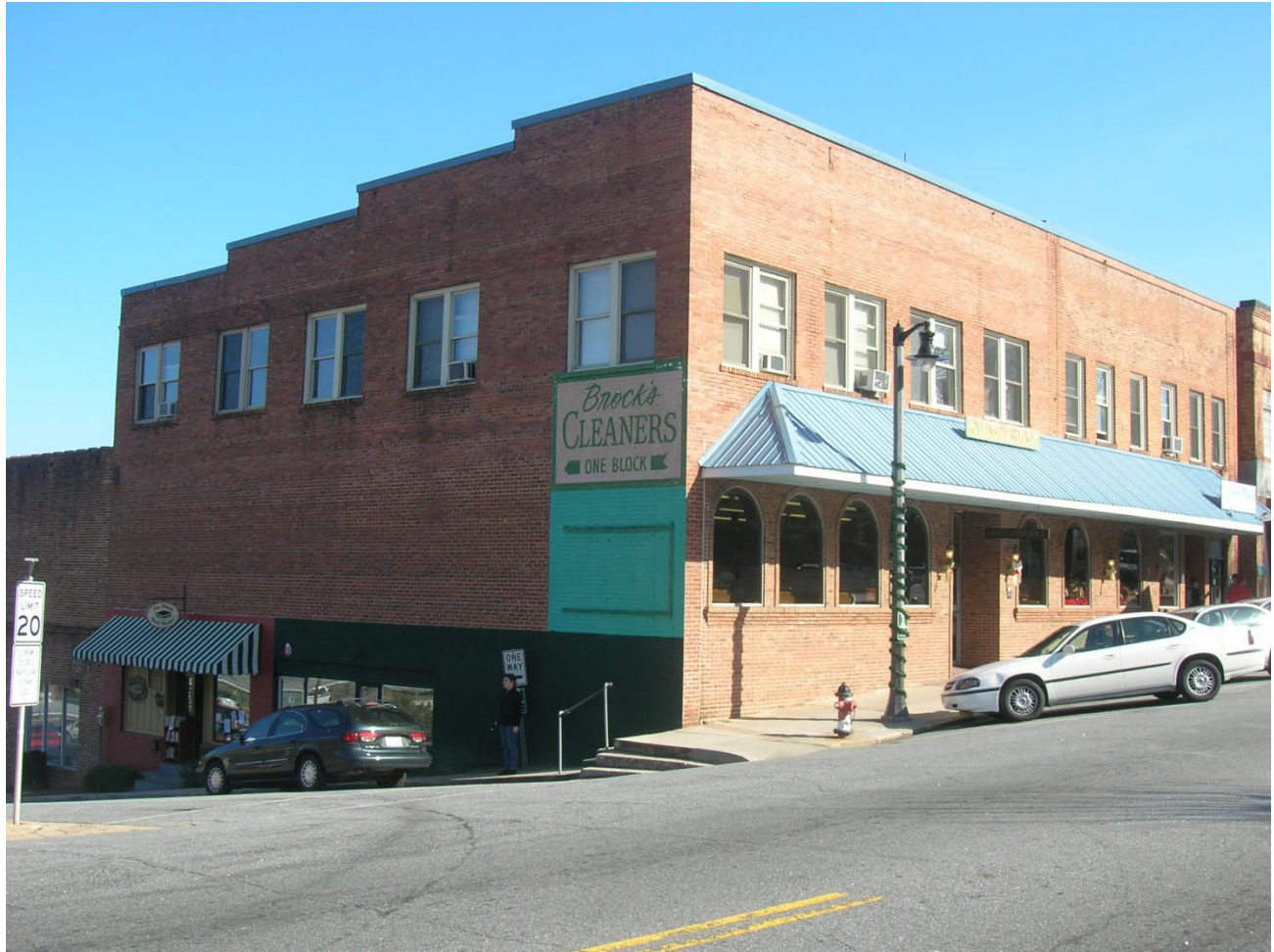
PL 152 – Commercial Building, 38 N. Trade Street