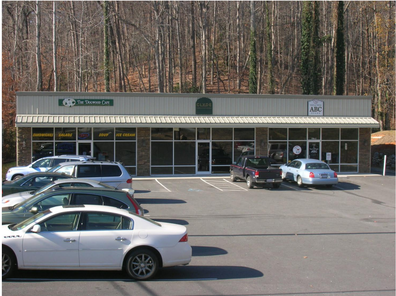
PL 150 – Commercial Building, 354 S. Trade Street