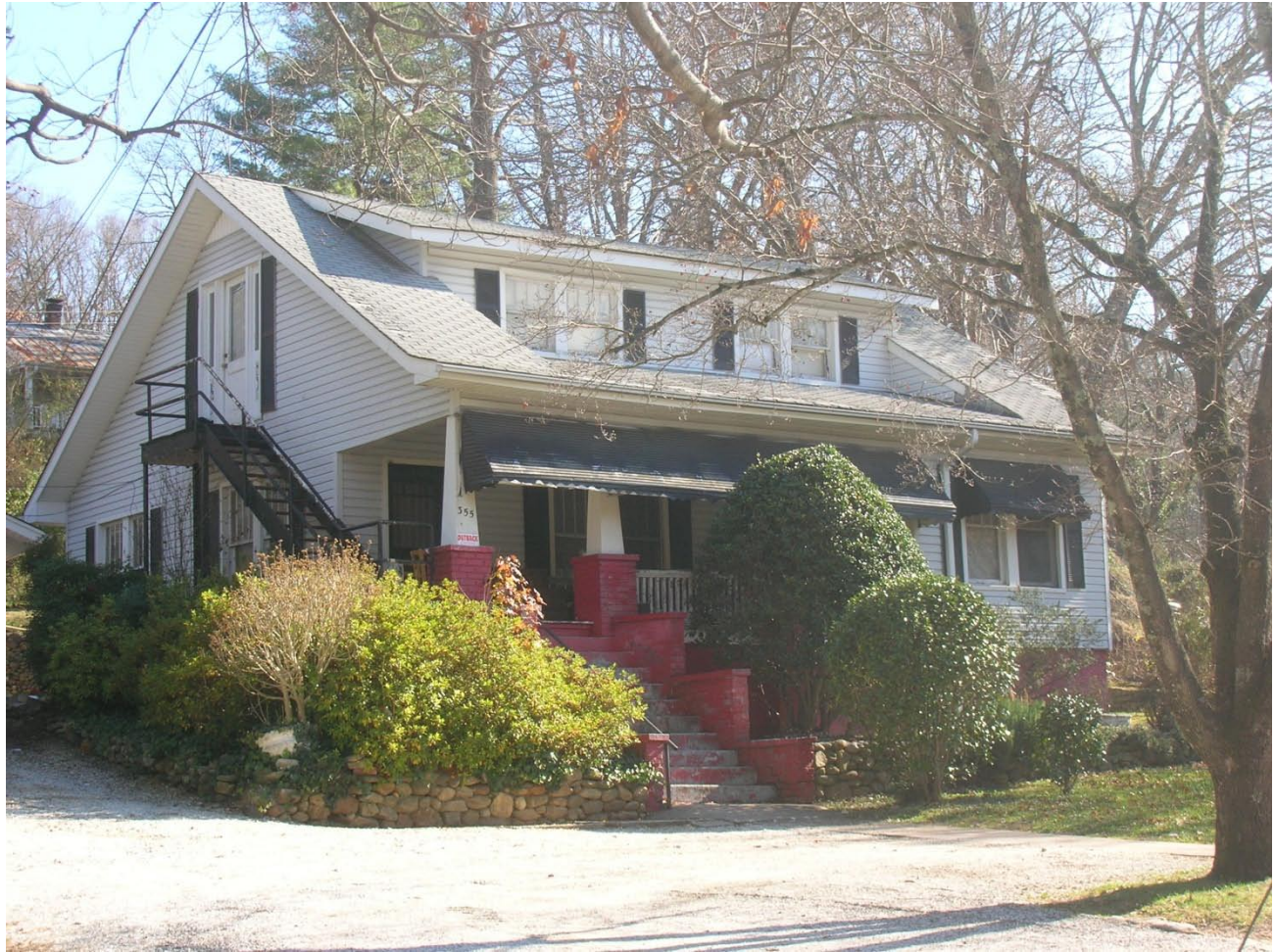
PL 86 – House, 355 S. Trade Street