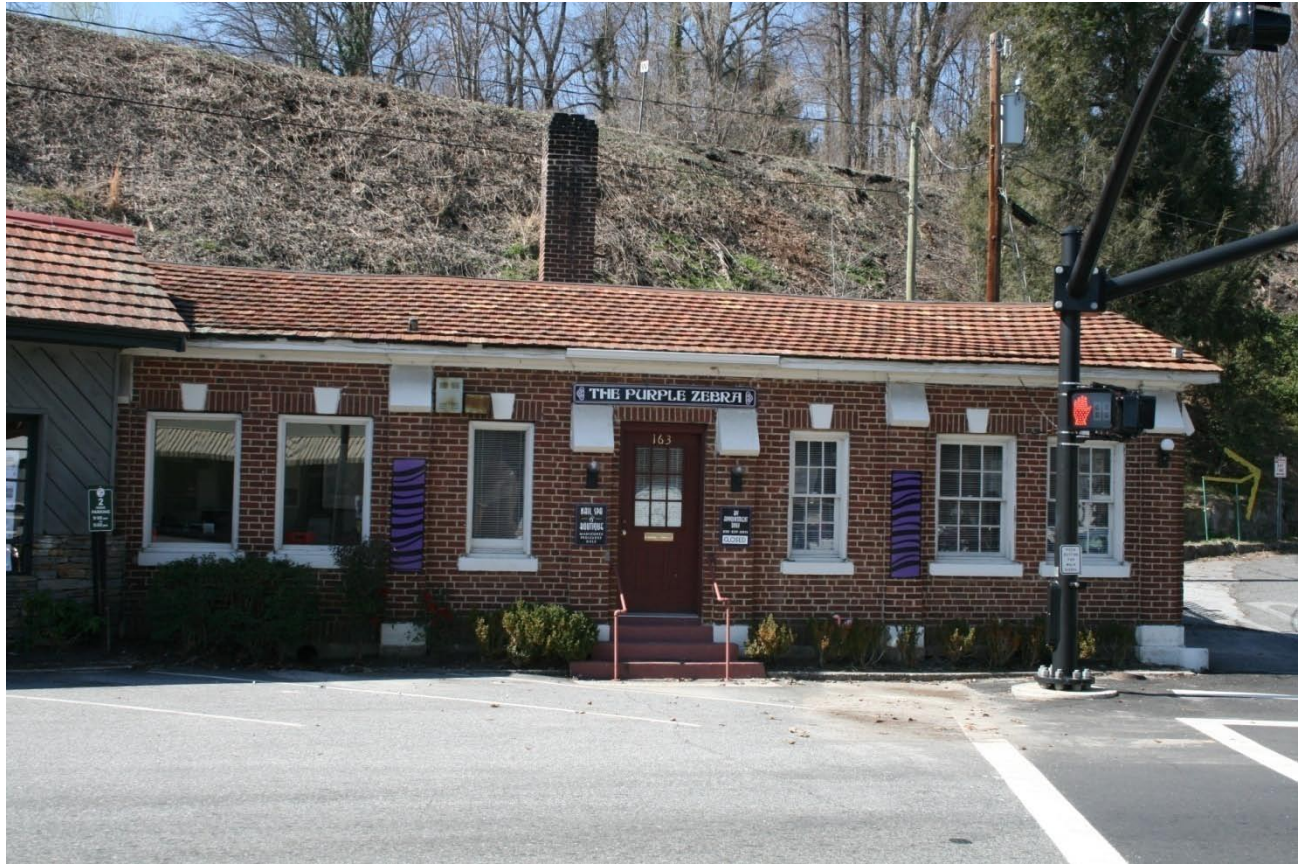
PL 111 – Commercial Building, 163 N. Trade Street