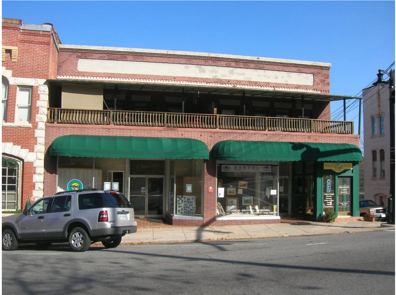
PL 63 – Ballenger Building, 10 N. Trade Street