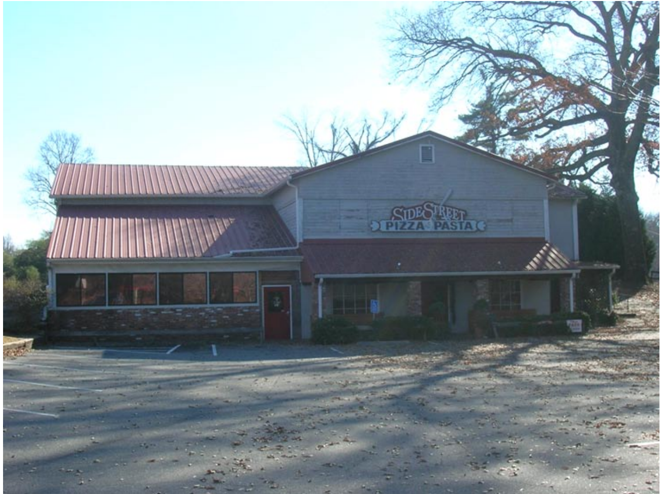
PL 83 – Farmer's Federation Warehouse, 201 S. Trade Street