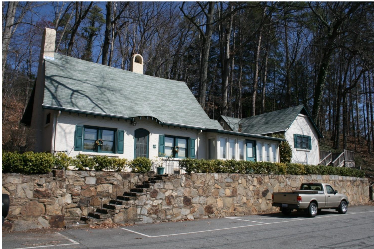
PL 125 – Toy House, 43 E. Howard Street