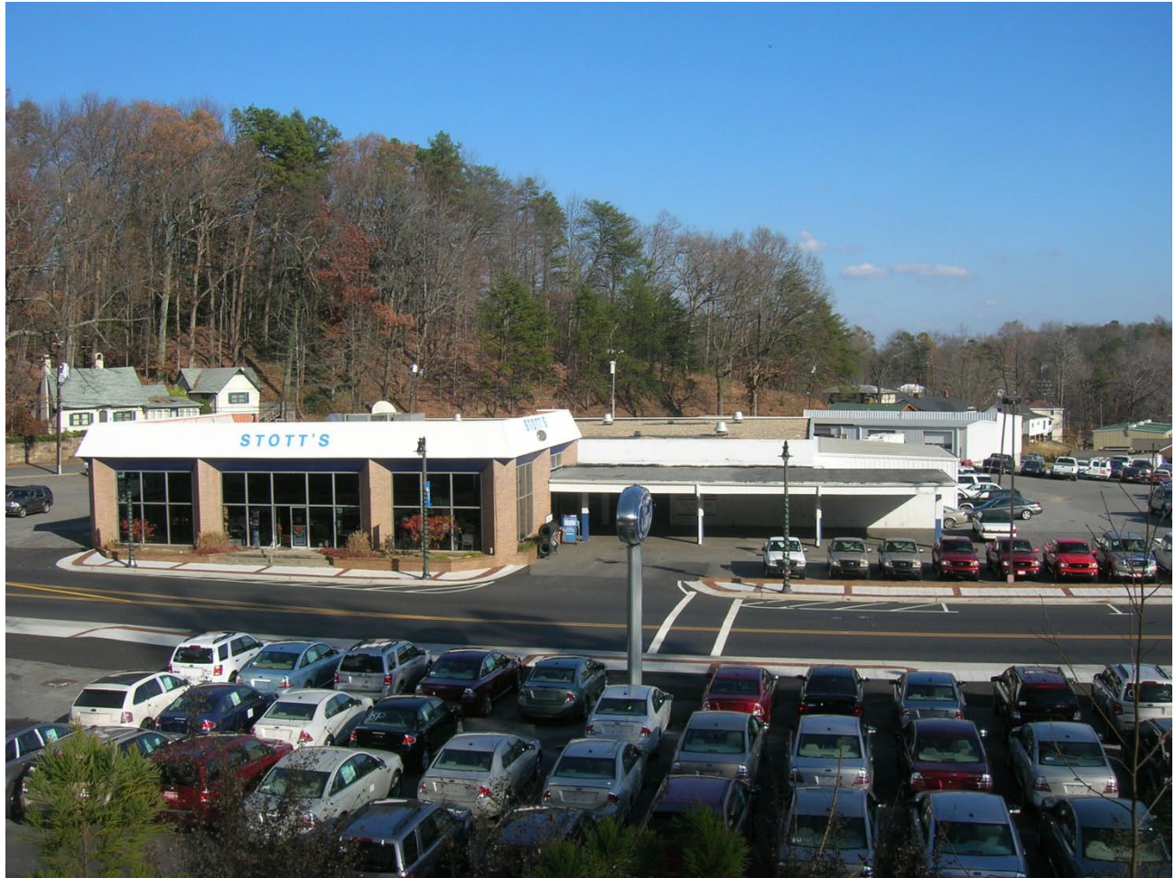
PL 127 – Stott's Ford, 220 N. Trade Street