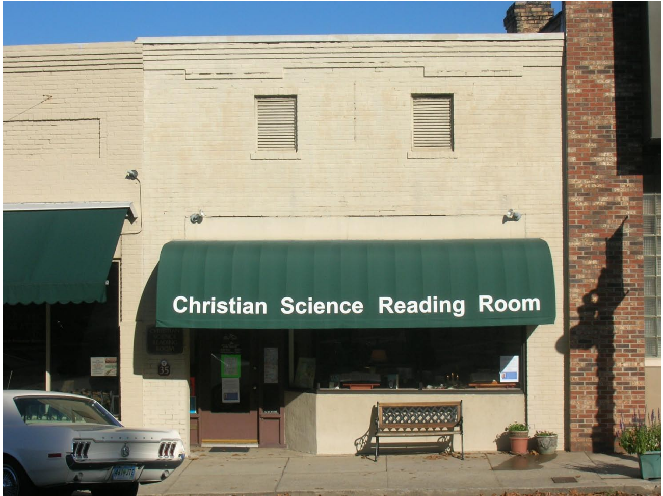
PL 76 – Commercial Building, 35 S. Trade Street