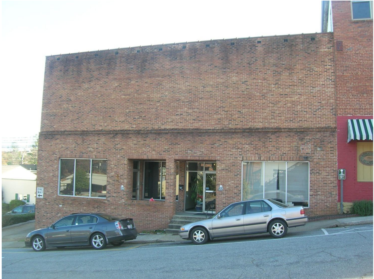
PL 66 – Commercial Building, 22-26 Maple Street