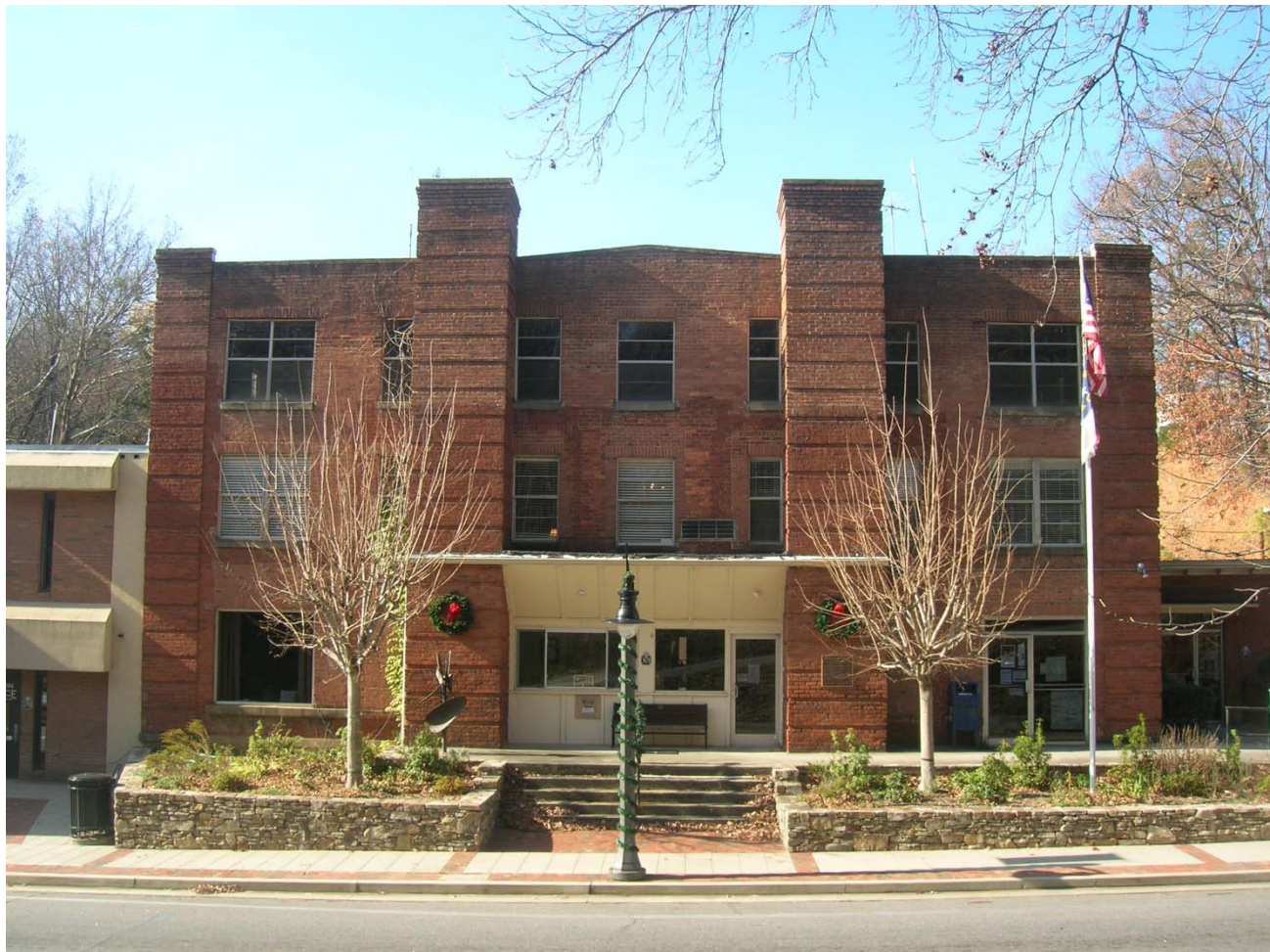
PL 120 – Tryon Town Hall, 301 N. Trade Street