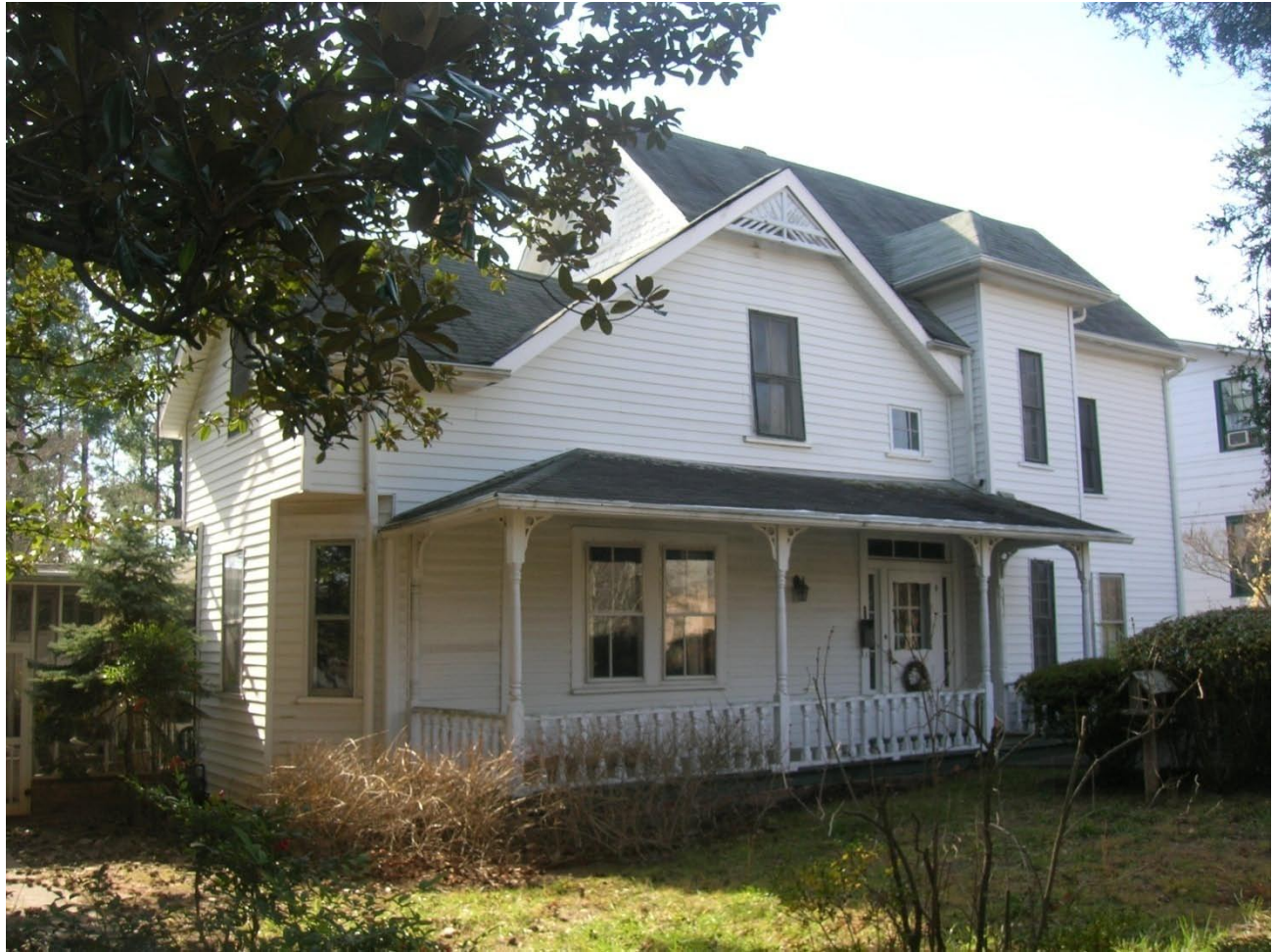
PL 94 – Whitney House, 35 Melrose Avenue