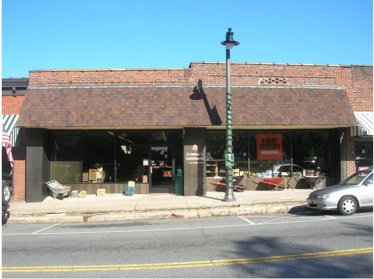
PL 147 – Cowan's Hardware, 104 N. Trade Street