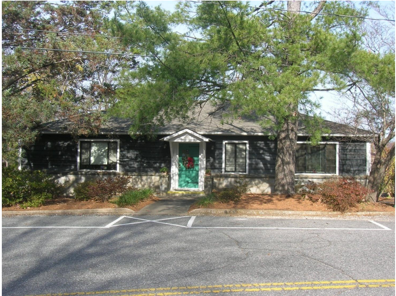
Dr. M. C. Palmer Office Building, 136 Pacolet Street