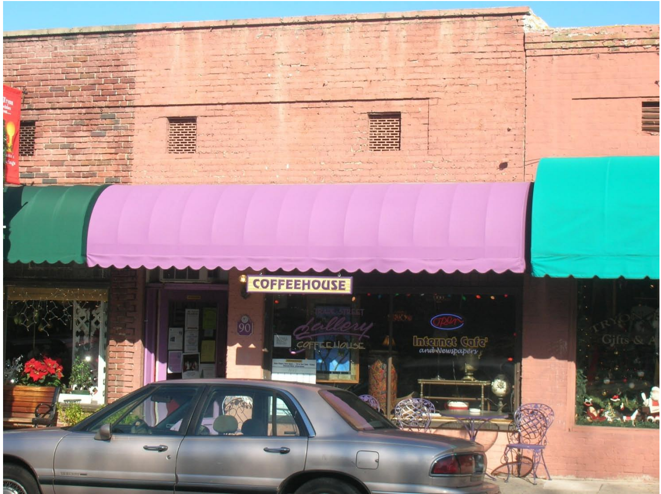
PL 139 – Commercial Building, 90 N. Trade Street