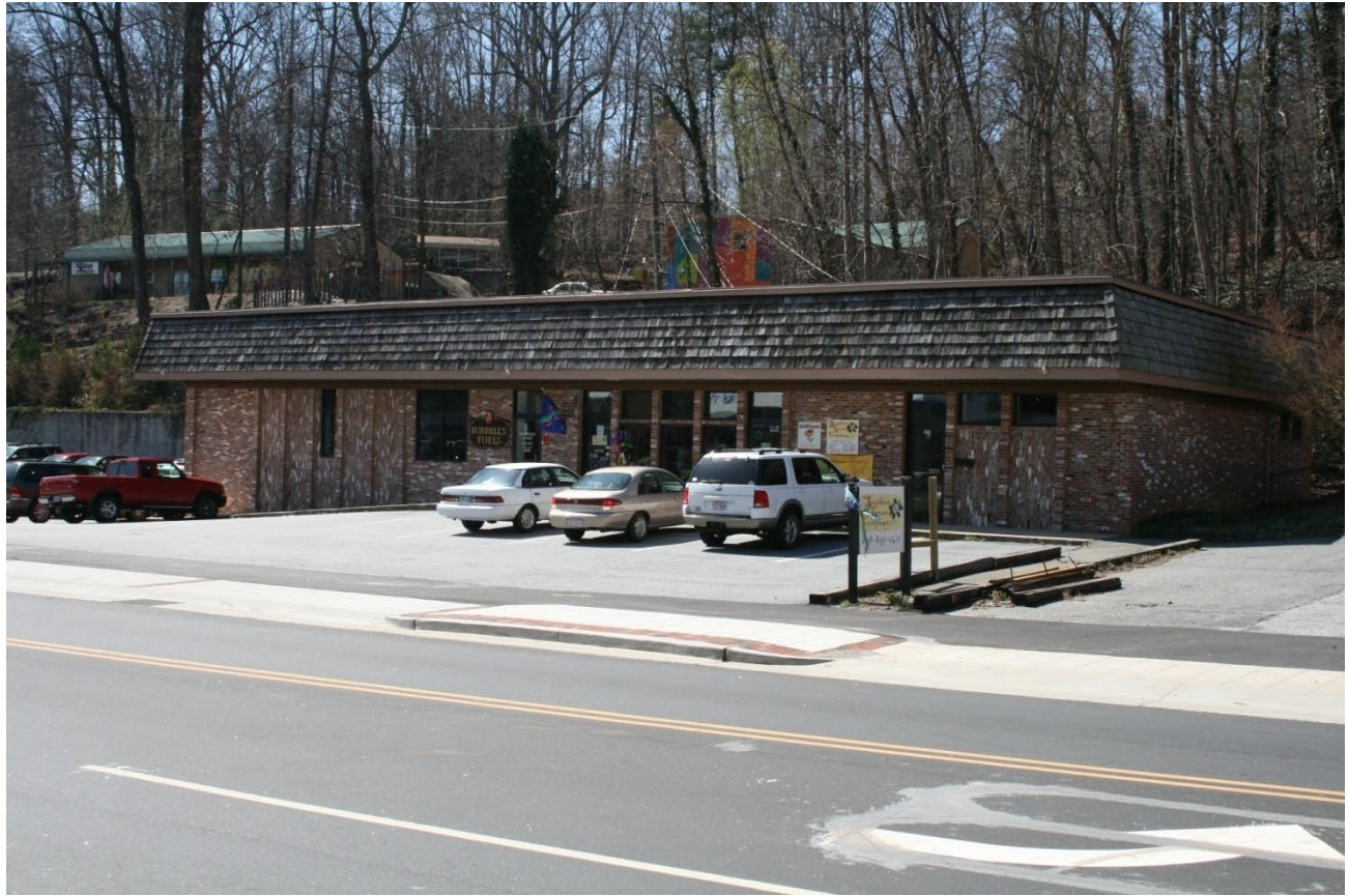
PL 115 – Burrell's Fuel Building, 231 N. Trade Street