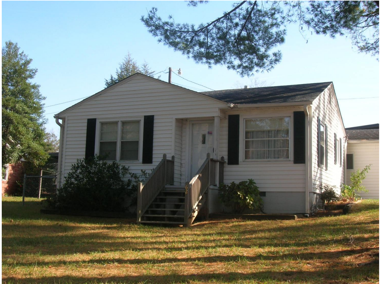
PL 68 – House, 62 Maple Street