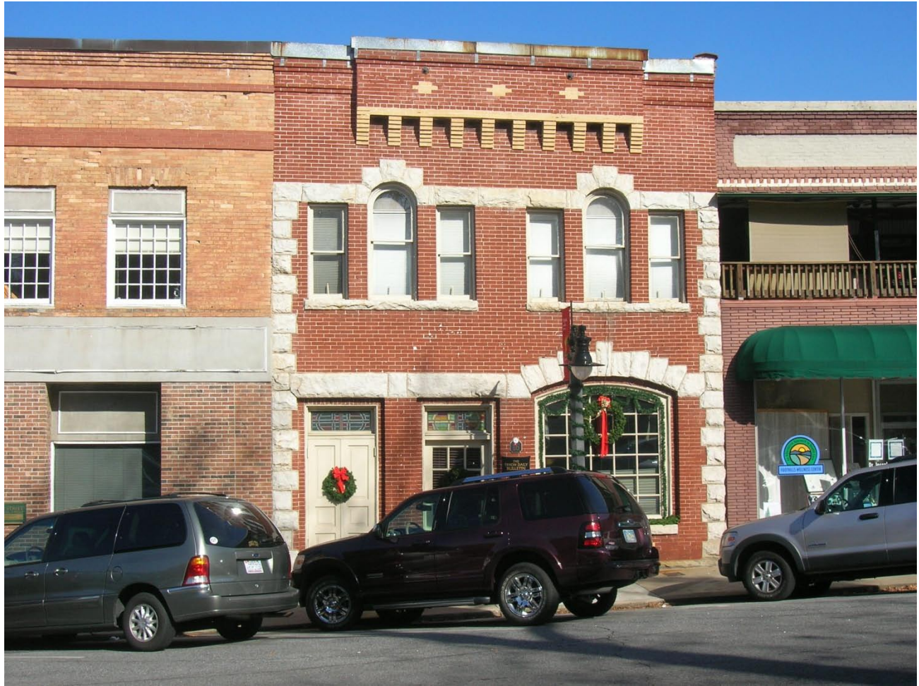
PL 45 – Bank of Tryon Building, 16 N. Trade Street