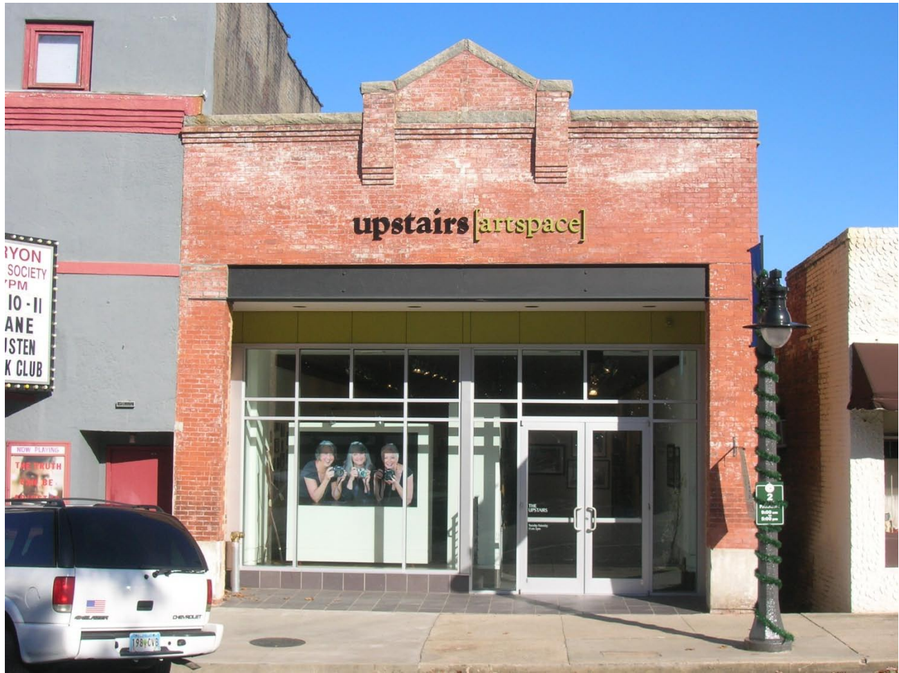
PL 79 – Tryon Supply Company Building, 49 S. Trade Street