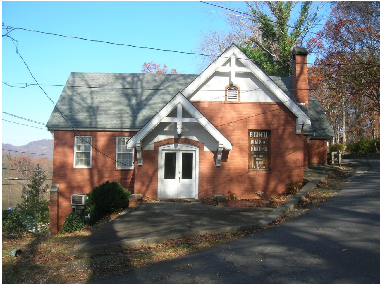
PL 126 – (former) Tryon Presbyterian Church, 201 Freeman Hill Road