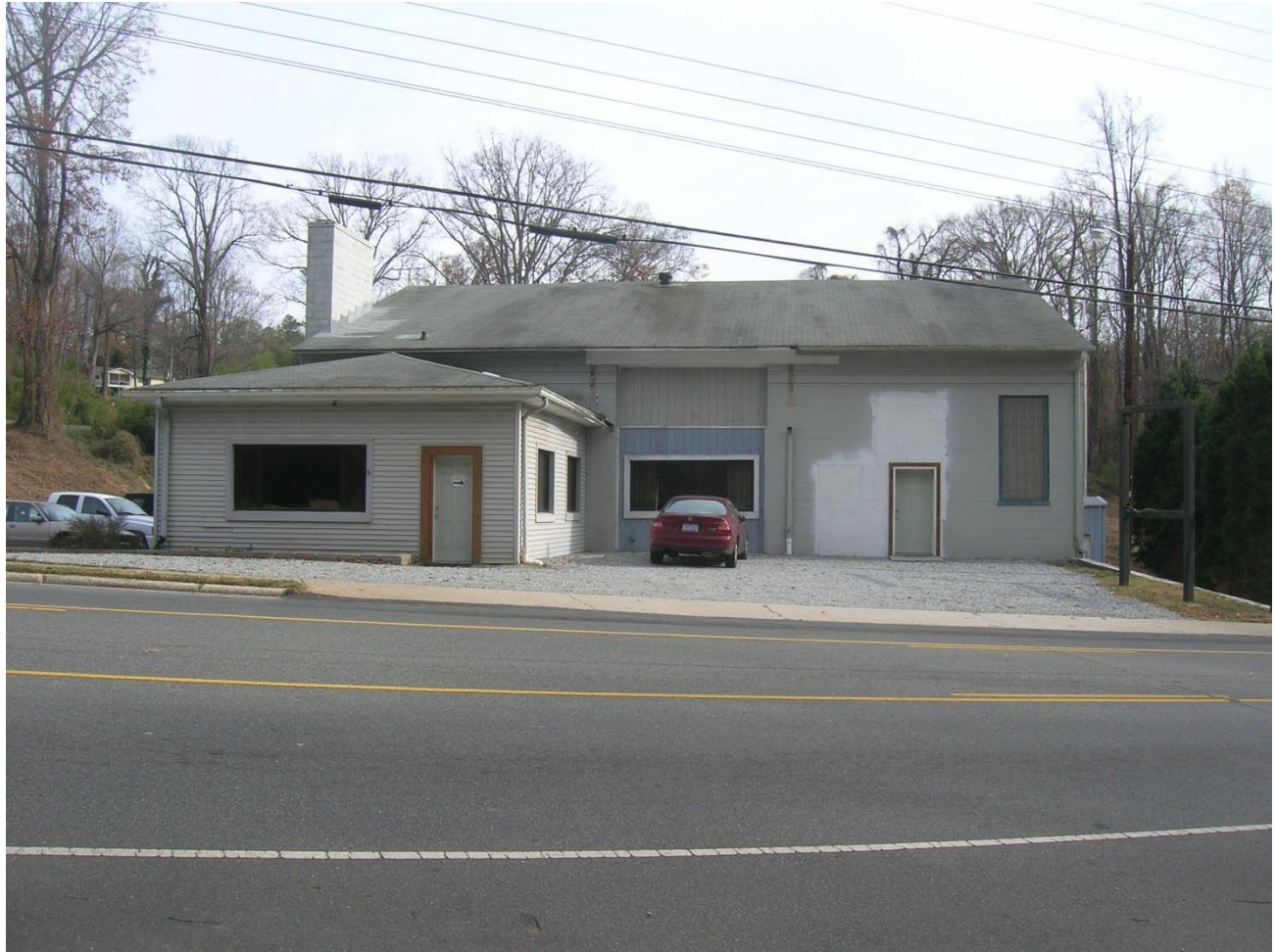
PL 84 – Butler Dairy, 215 S. Trade Street