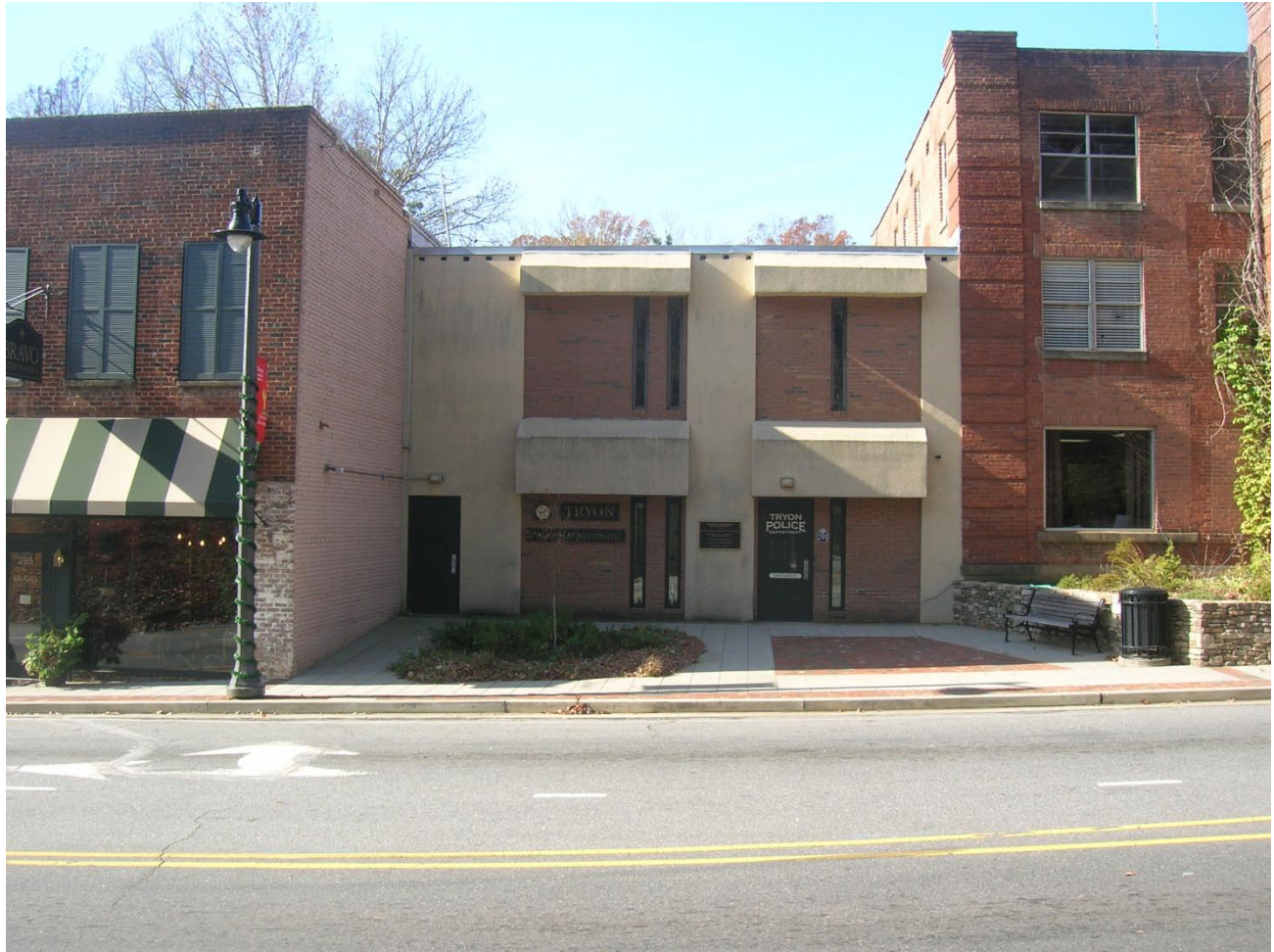
PL 121 – (former) Tryon Fire Department, 291 N. Trade Street