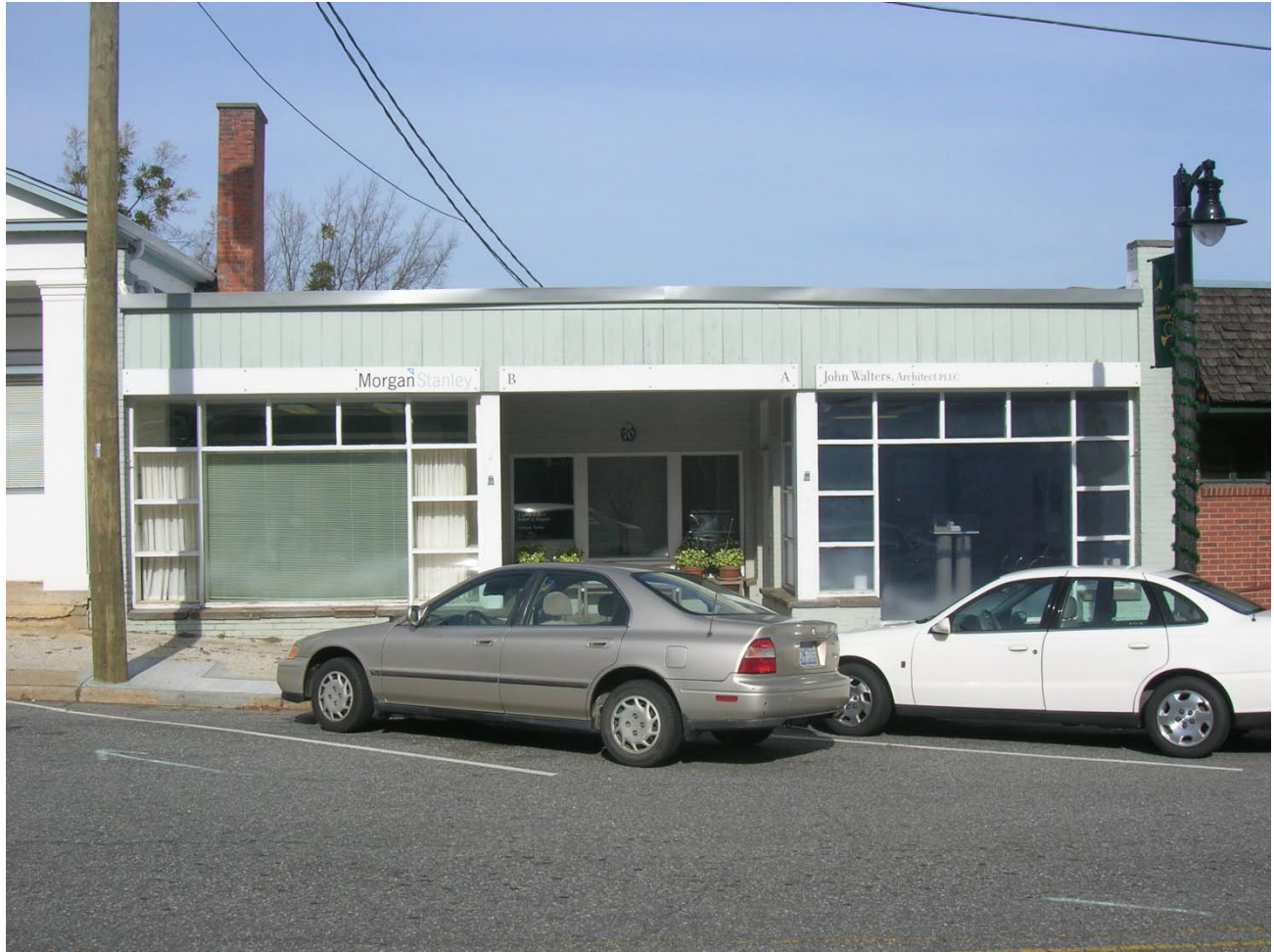
PL 103 – Commercial Building, 70 Pacolet Street