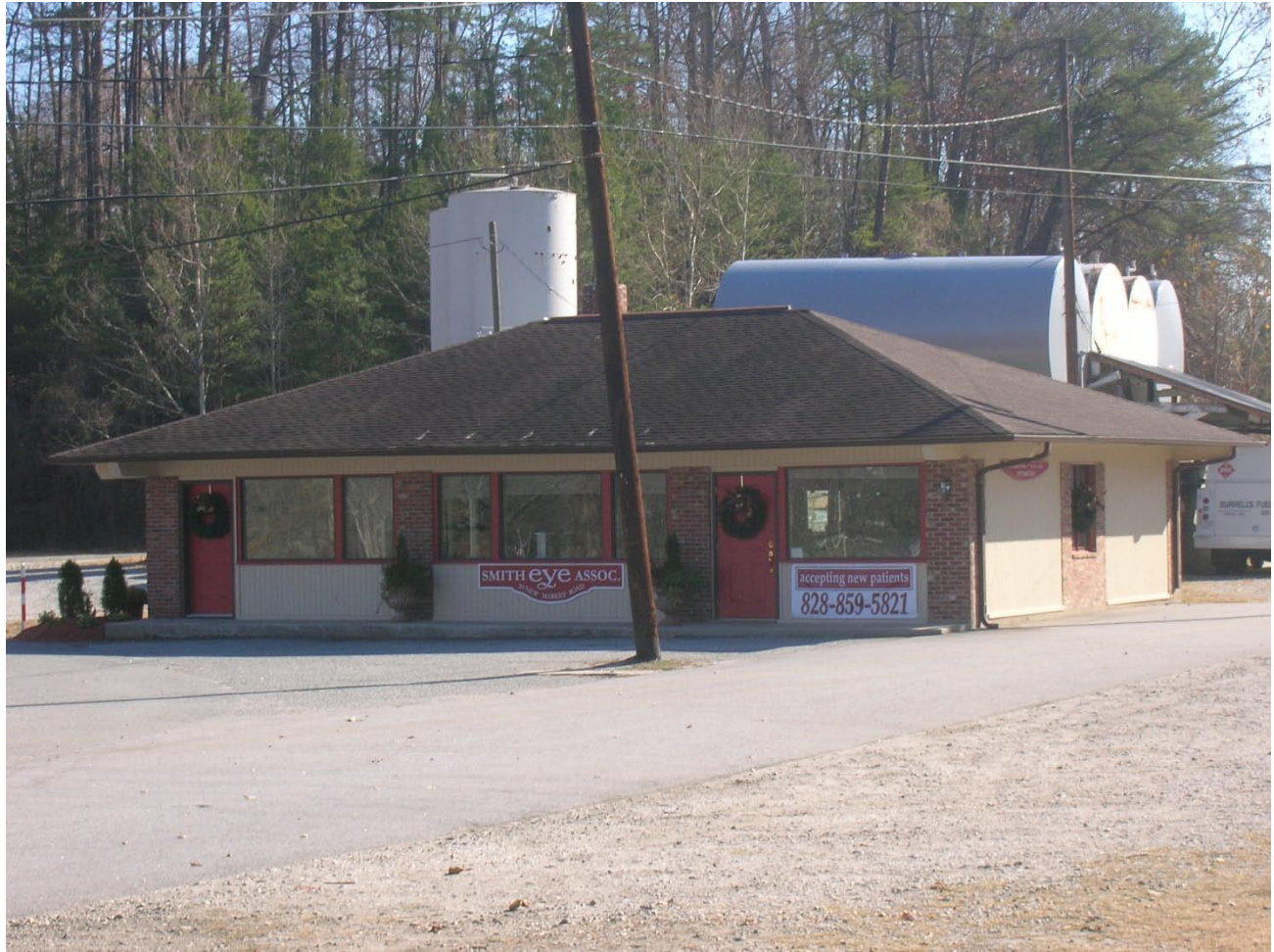
PL 82 – Burrell's Fuel, New Market Street