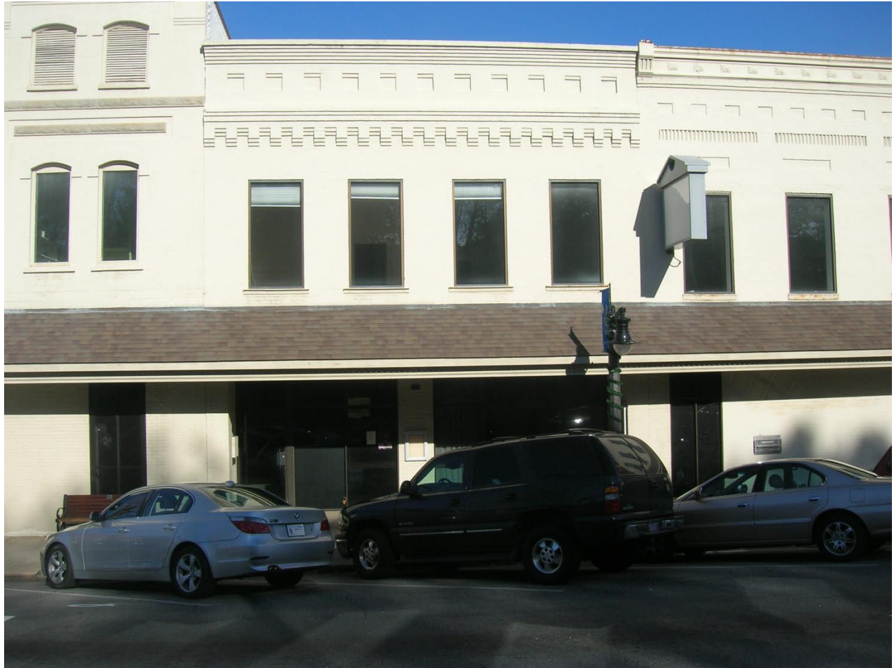
PL 72 – (former) Tryon Federal Savings and Loan, S. Trade Street