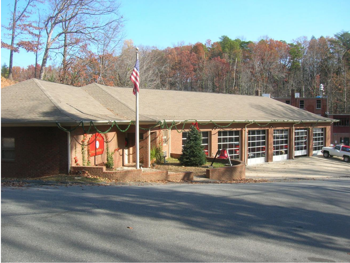
PL 158 – Tryon Fire Department, 56 W. Howard Street