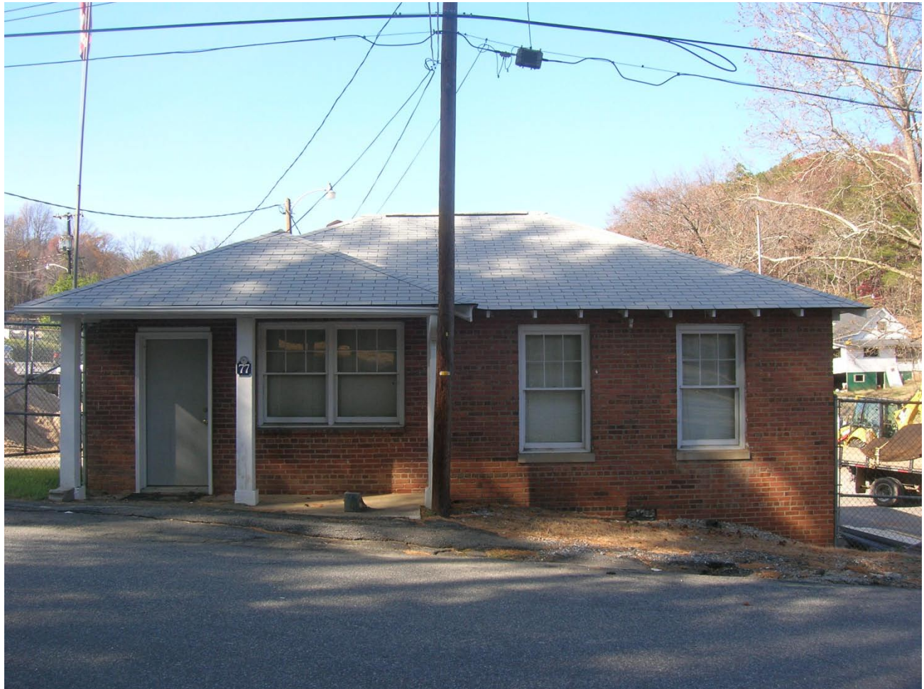
PL 130 – Tryon Maintenance Department, 77 Maple Street