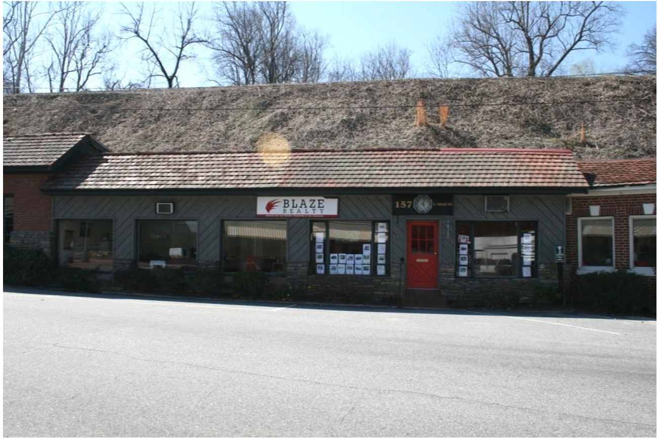
PL 110 – Commercial Building, 157 N. Trade Street