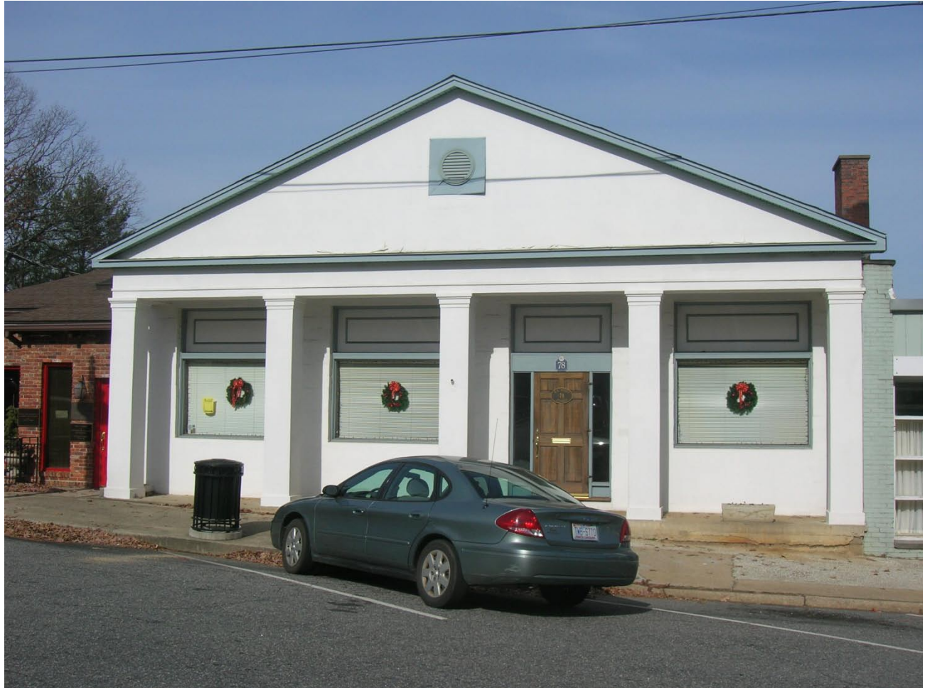
PL 102 – (former) United States Post Office, 78 Pacolet Street