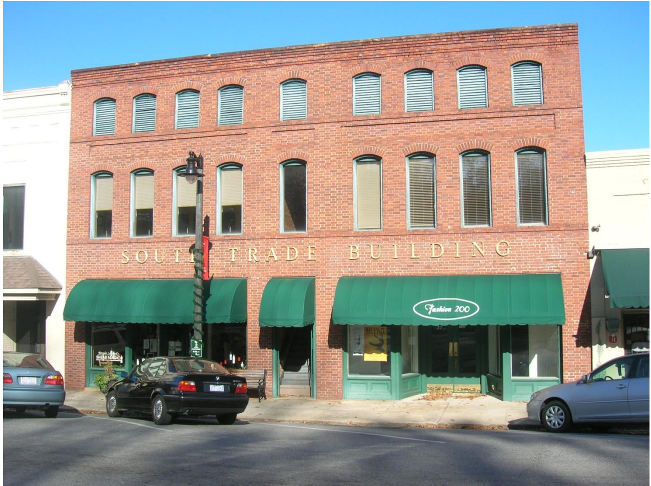
PL 74 – South Trade Building, 25-27 S. Trade Street