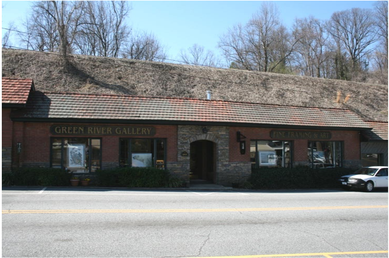
PL 156 – Commercial Building, 145 N. Trade Street