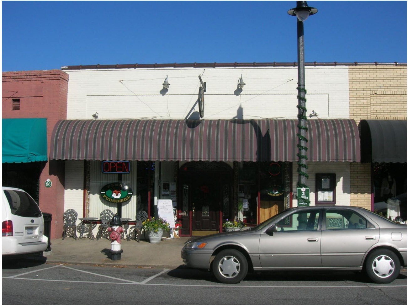
PL 137 – Commercial Building, 82 N. Trade Street