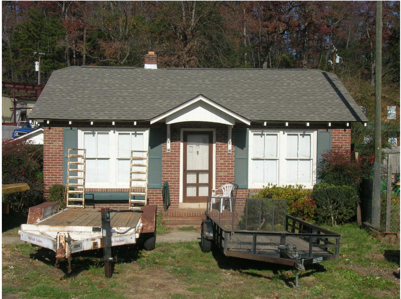
PL 128 – Morris House, 12 Palmer Street