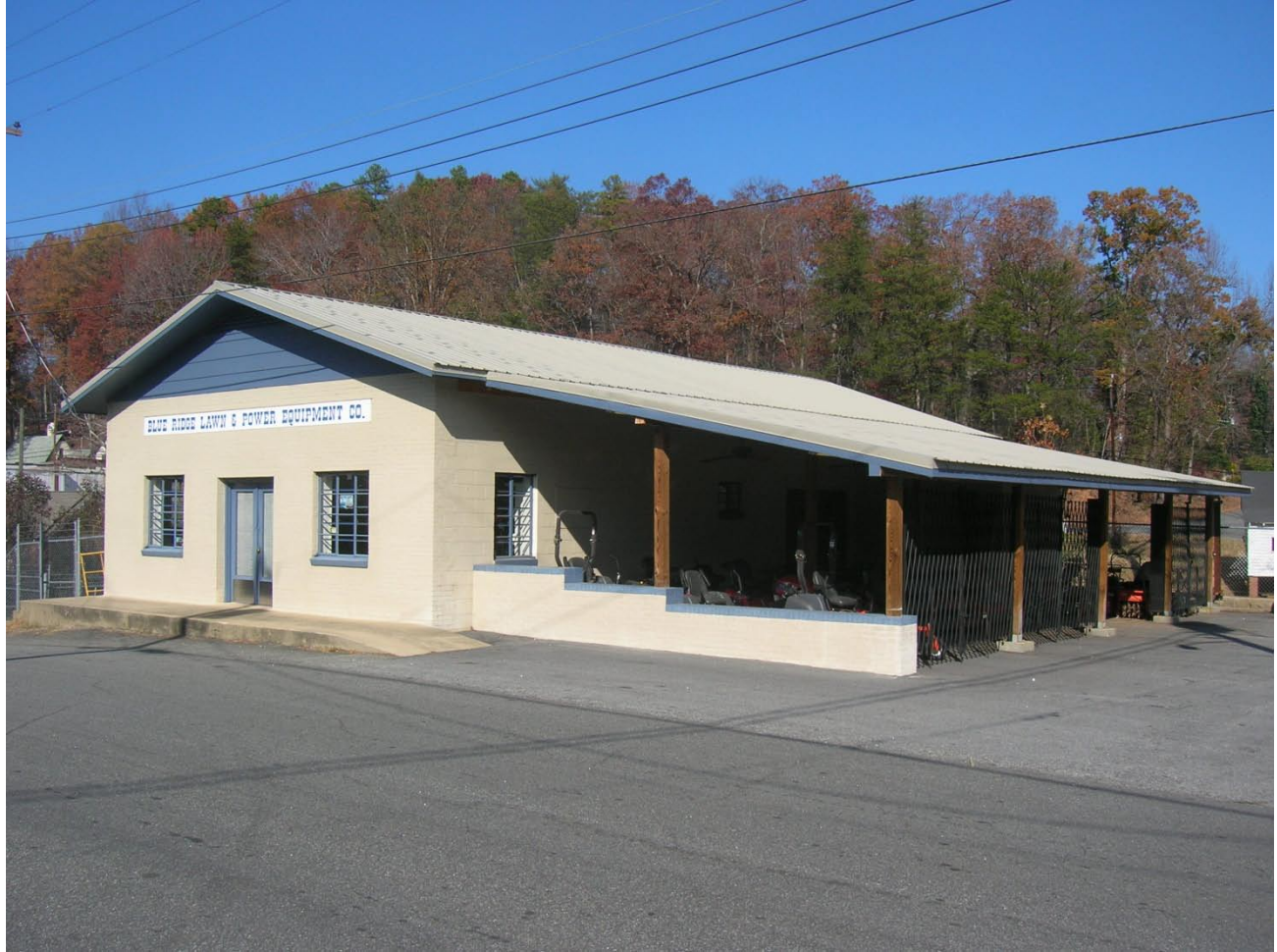
PL 129 – Blue Ridge Lawn and Power Equipment Co., 83 Palmer Street