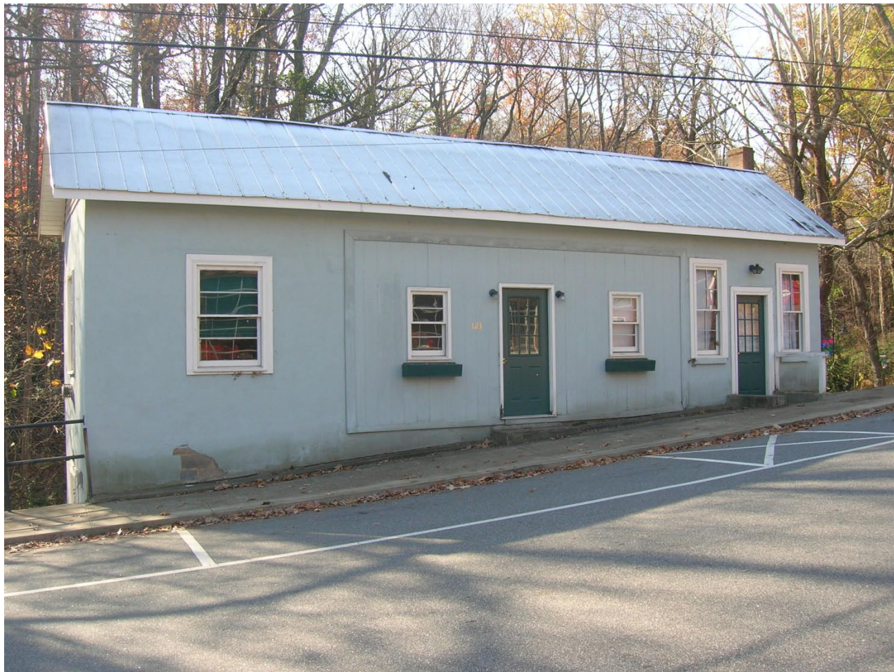
PL 117 – Carrie Lee Massey Building, 123 W. Howard Street