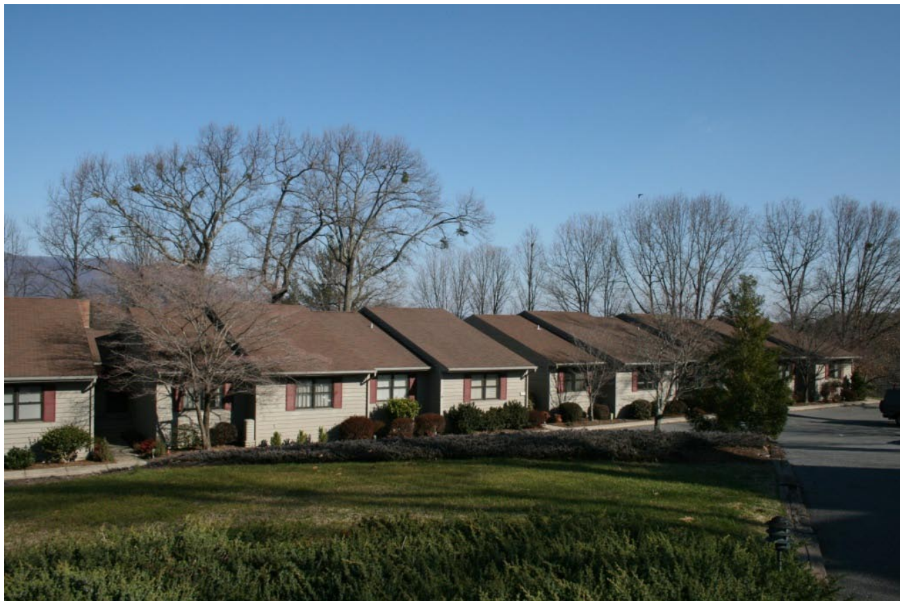
PL 112 – Oak Hall Condominiums, 77 Chestnut Street