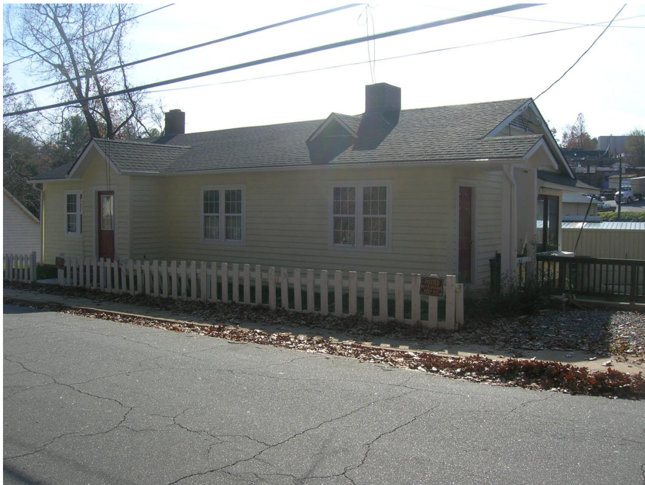
PL 151 – House, E. Howard Street