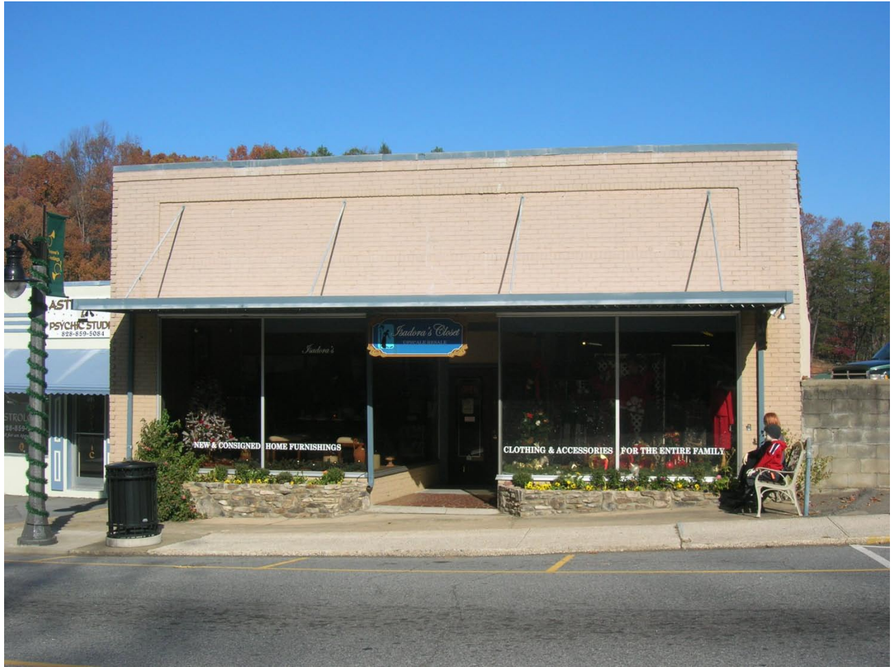
PL 144 – Andrew’s Furniture Co. Building, 148 N. Trade Street