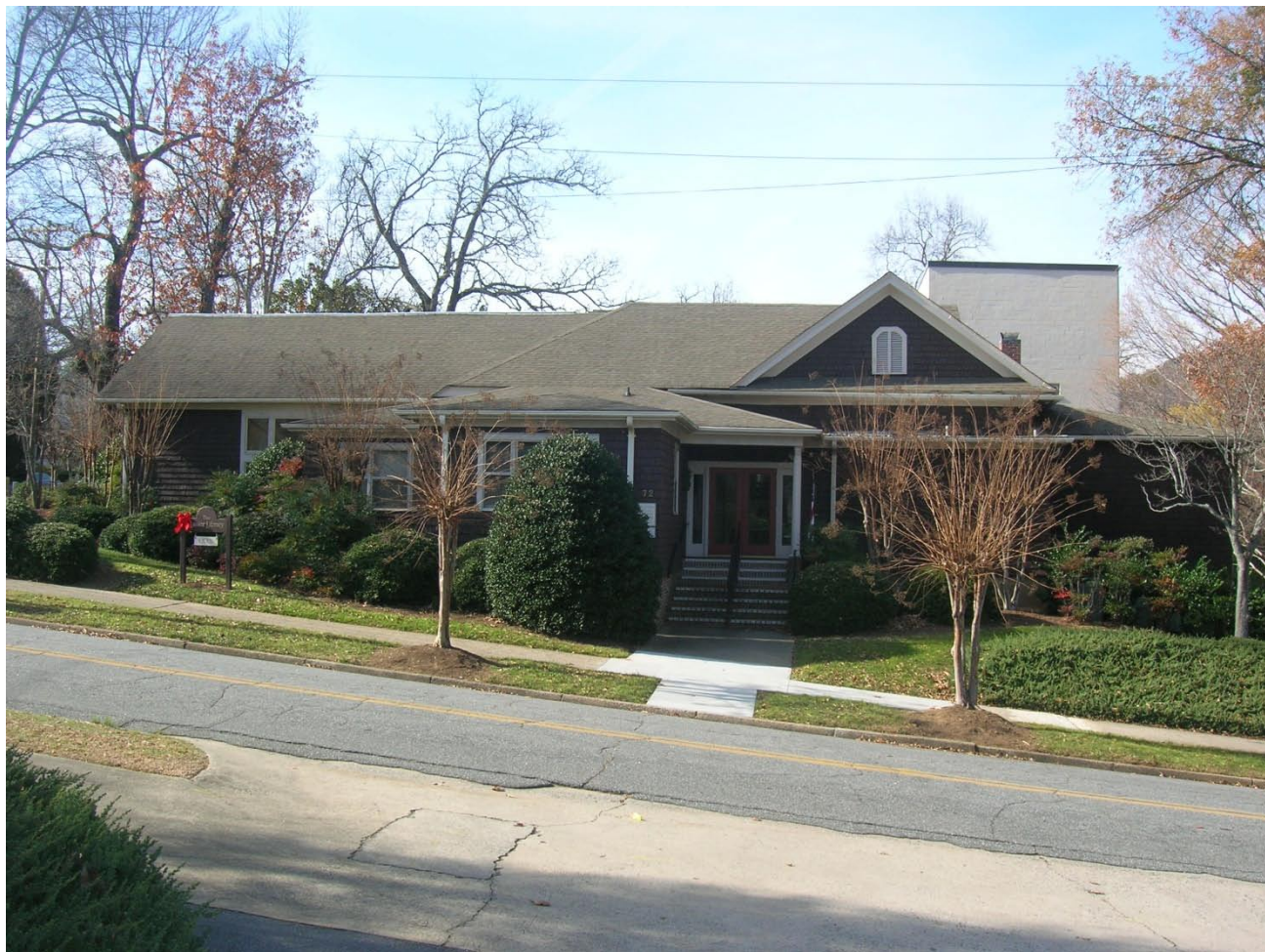
PL 46 – Lanier Library, 72 Chestnut Street