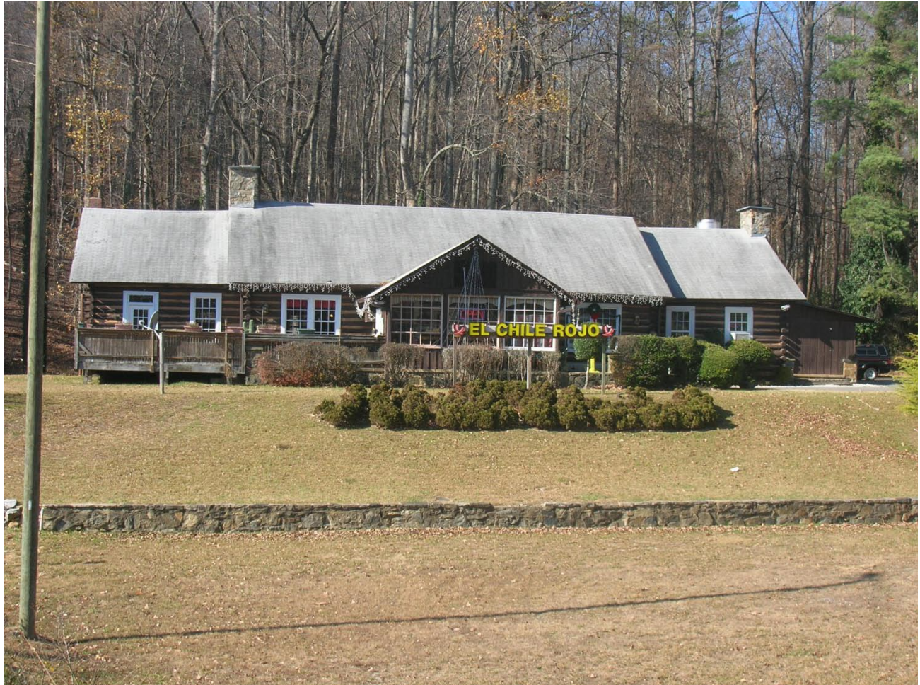
PL 148 – Sunnydale, 334 S. Trade Street