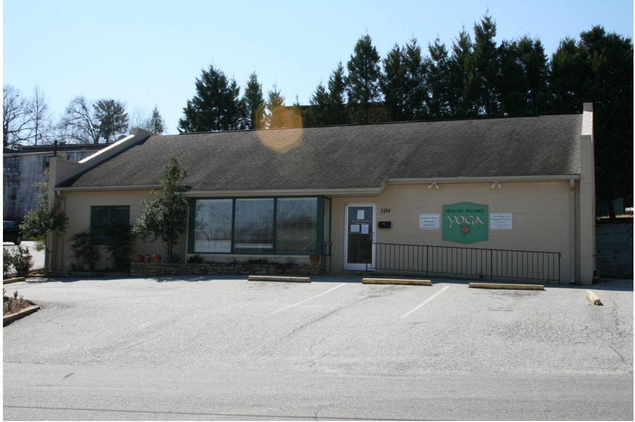
PL 146 – Commercial Building, 104 Palmer Street