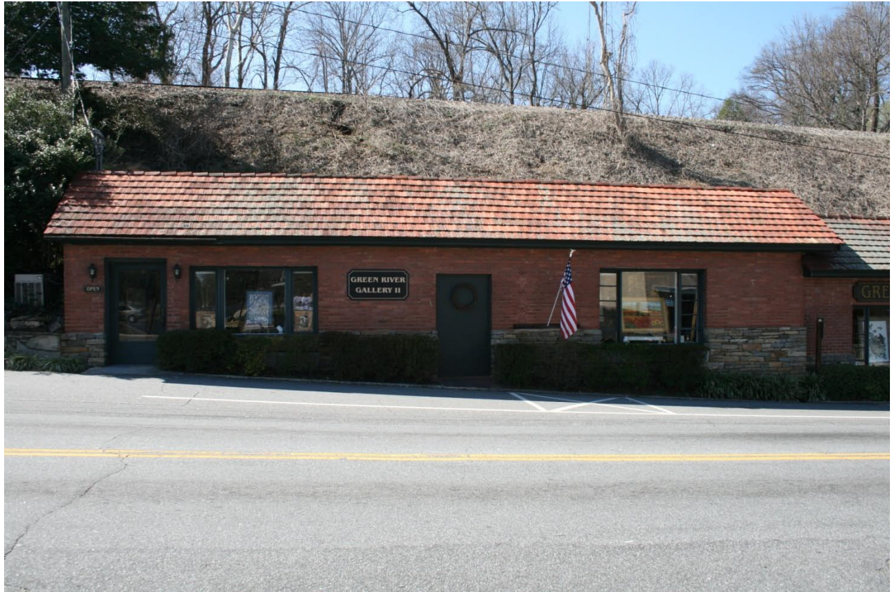
PL 157 – Commercial Building, N. Trade Street