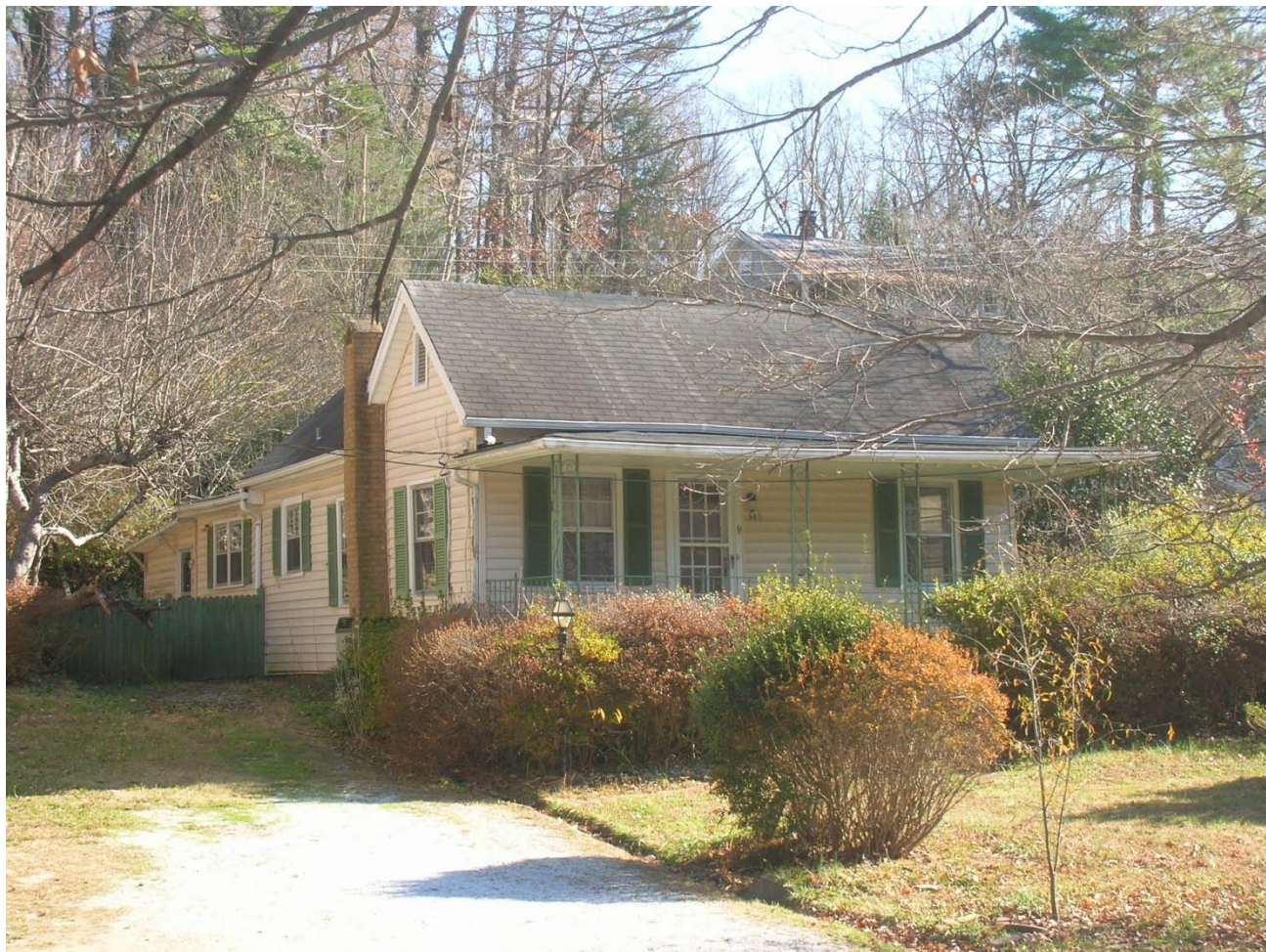
PL 87 – House, 345 S. Trade Street