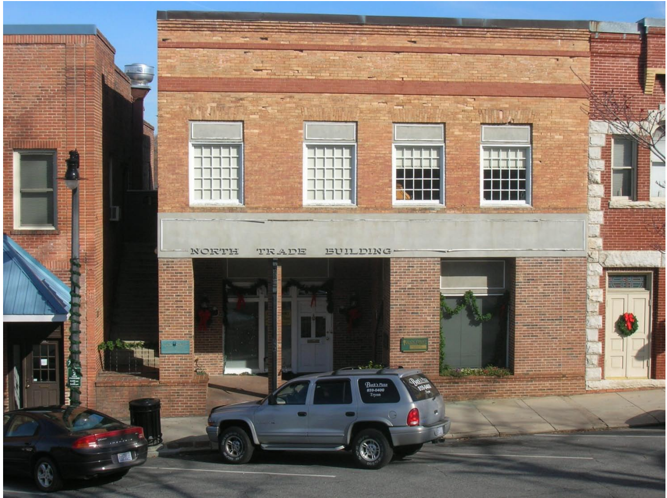
PL 64 – North Trade Building, 22-26 N. Trade Street