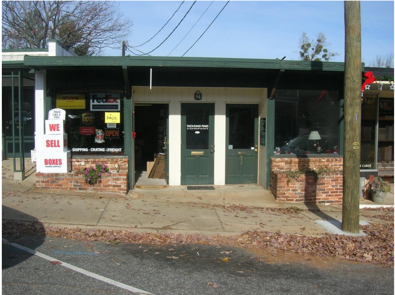
PL 99 – Commercial Building, 92-96 Pacolet Street