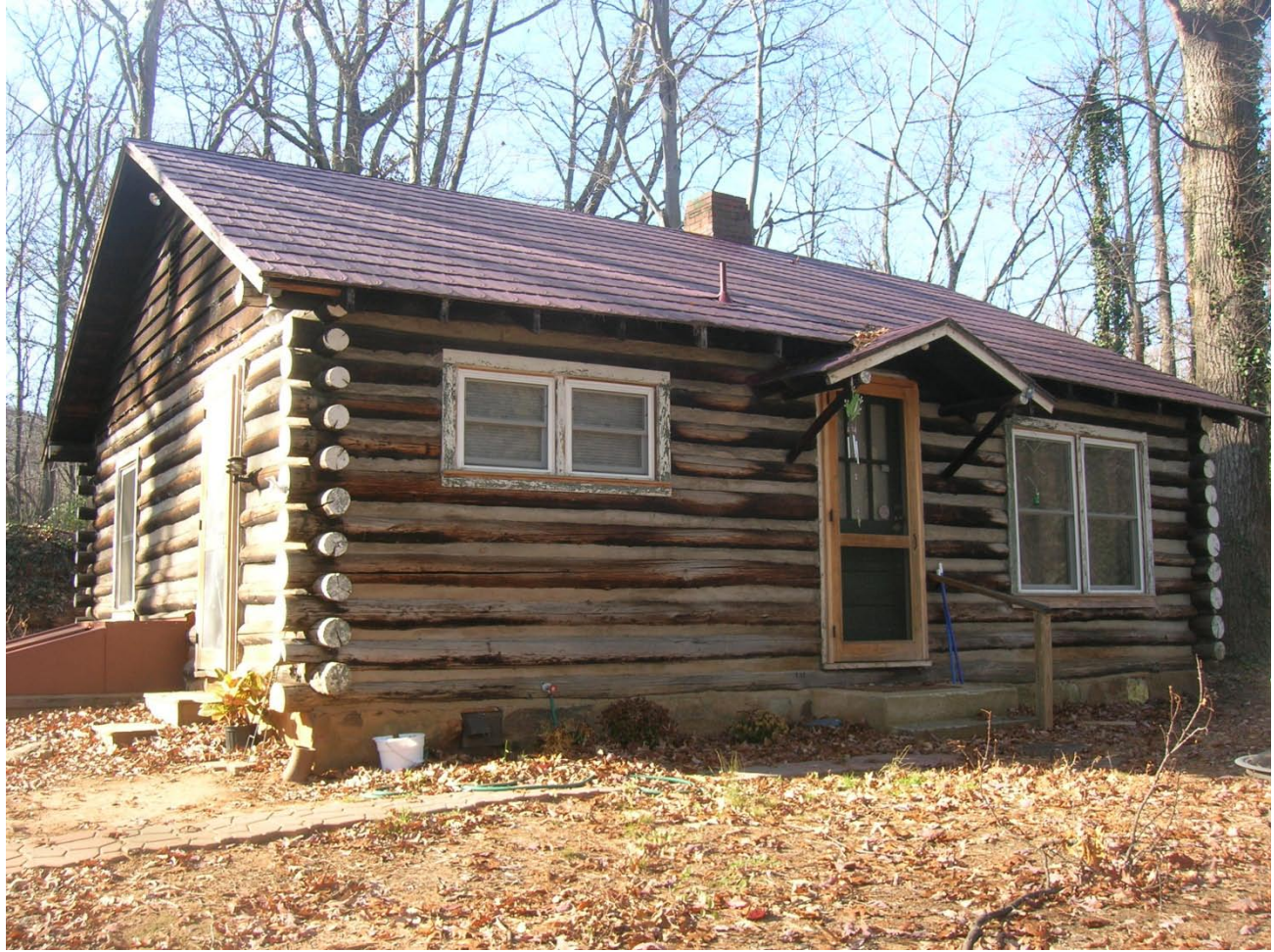
PL 119 – Ballew House, End of private road, SW corner of intersection of N. Trade Street and Howard Street