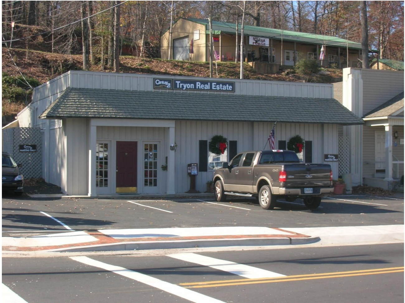
PL 114 – Filling Station, 177 N. Trade Street