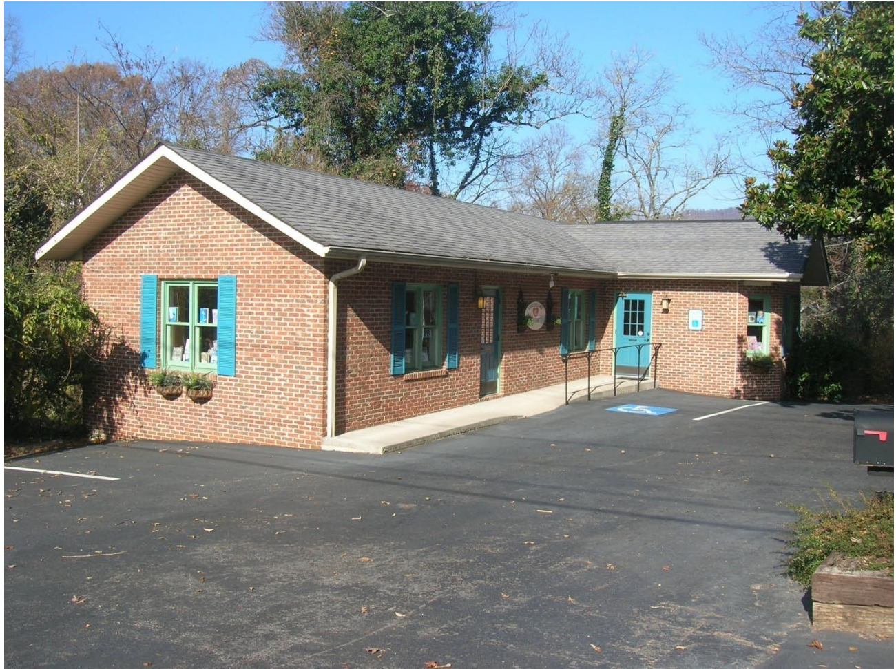
PL 91 – Commercial Building, 431 N. Trade Street