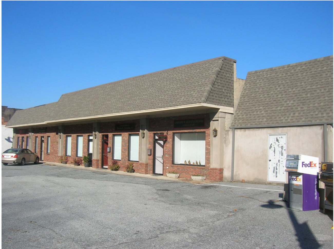
PL 81 – Service Station, 75 S. Trade Street