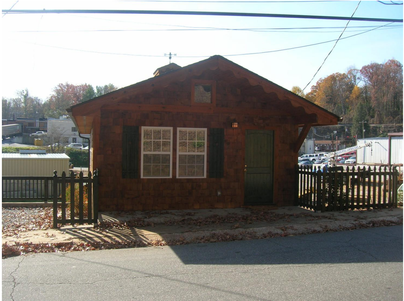
PL 132 – House, 160 E. Howard Street