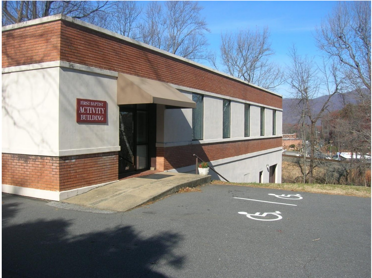
PL 96 – Jackson and Jackson Building, 126 Pacolet Street