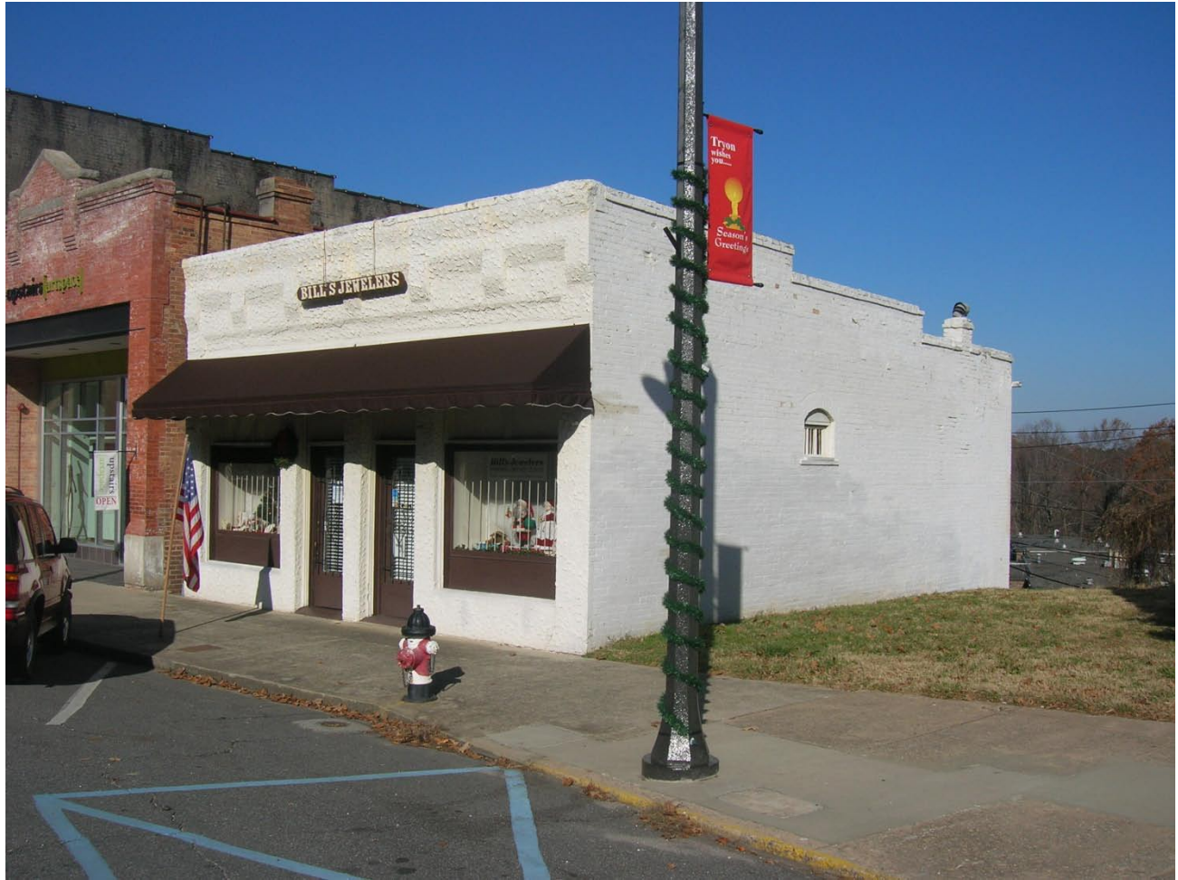
PL 80 – Commercial Building, 55 S. Trade Street