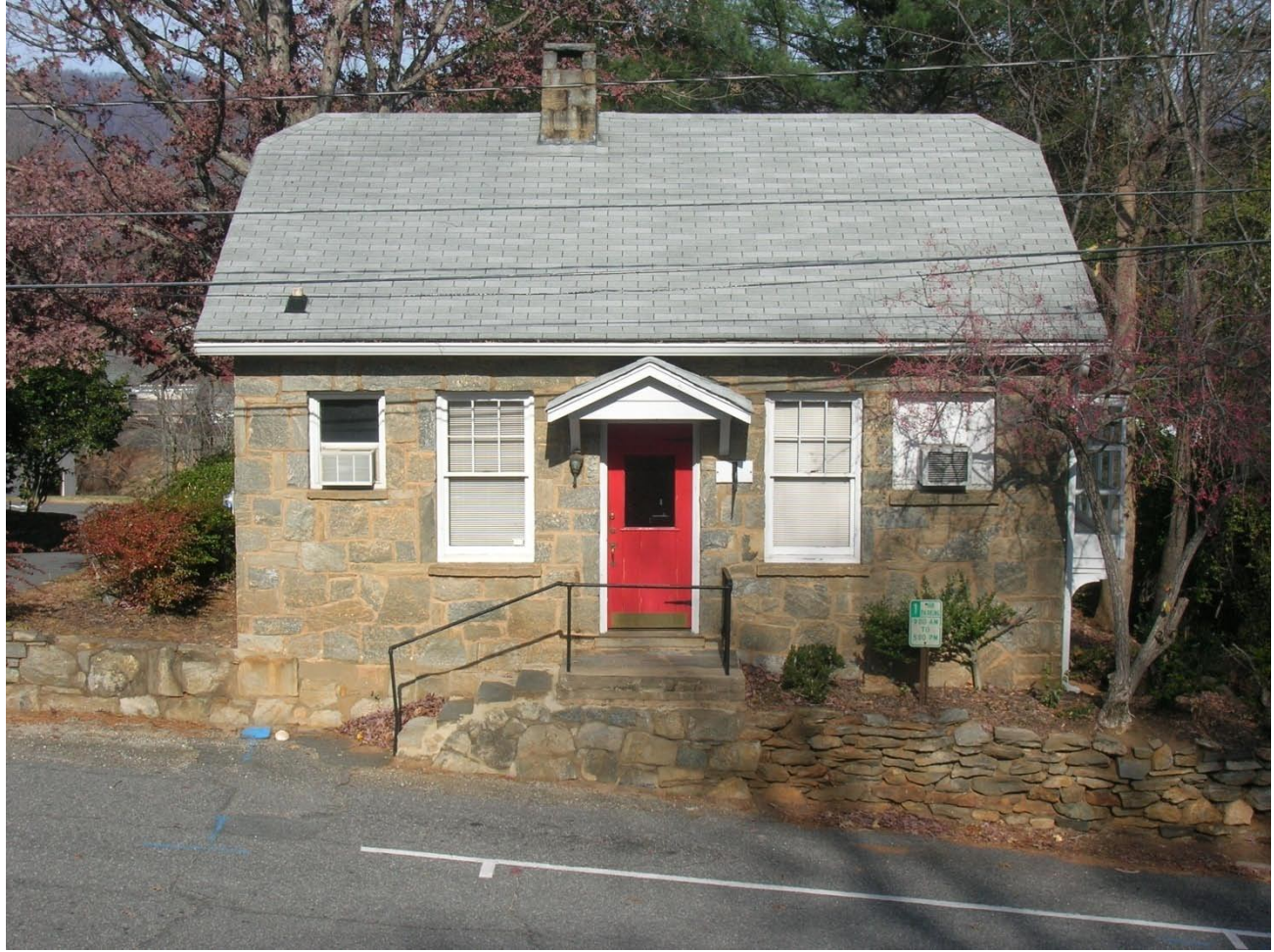
PL 97 – Dr. Allen Jervey Office Building, Pacolet Street