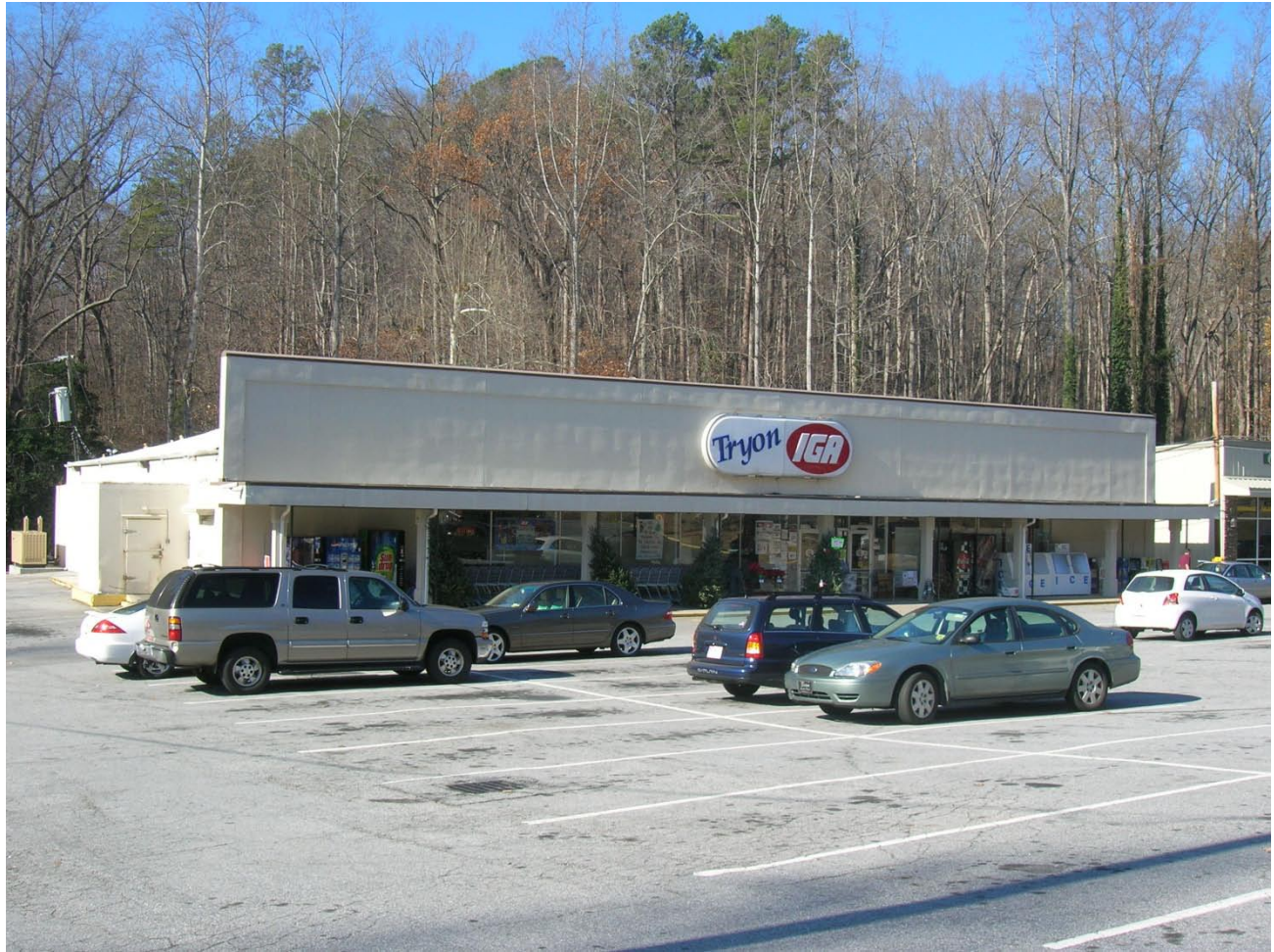
PL 149 – Tryon IGA, 370 S. Trade Street