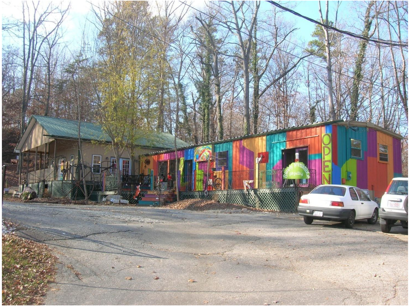
PL 113 – Commercial Building, 66-73 Ola Mae Way