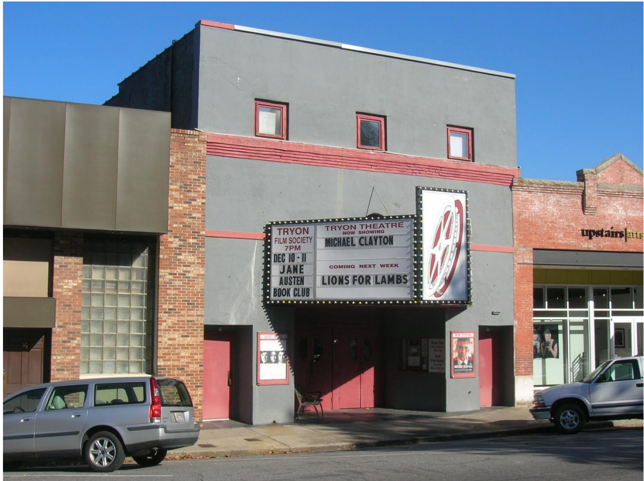
PL 78 – Tryon Theatre, 45 S. Trade Street