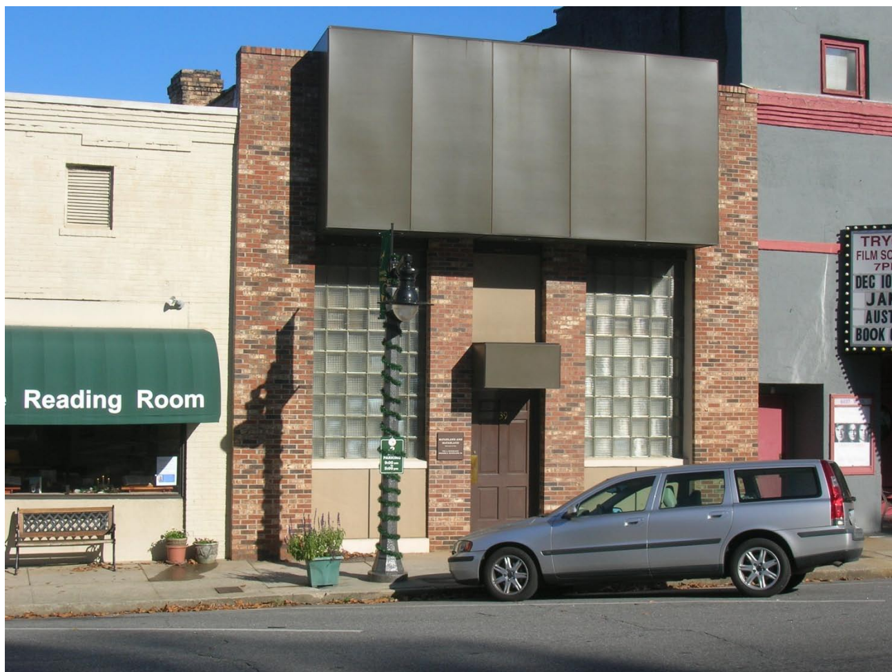
PL 77 – Tryon Bank & Trust Co., 39 S. Trade Street