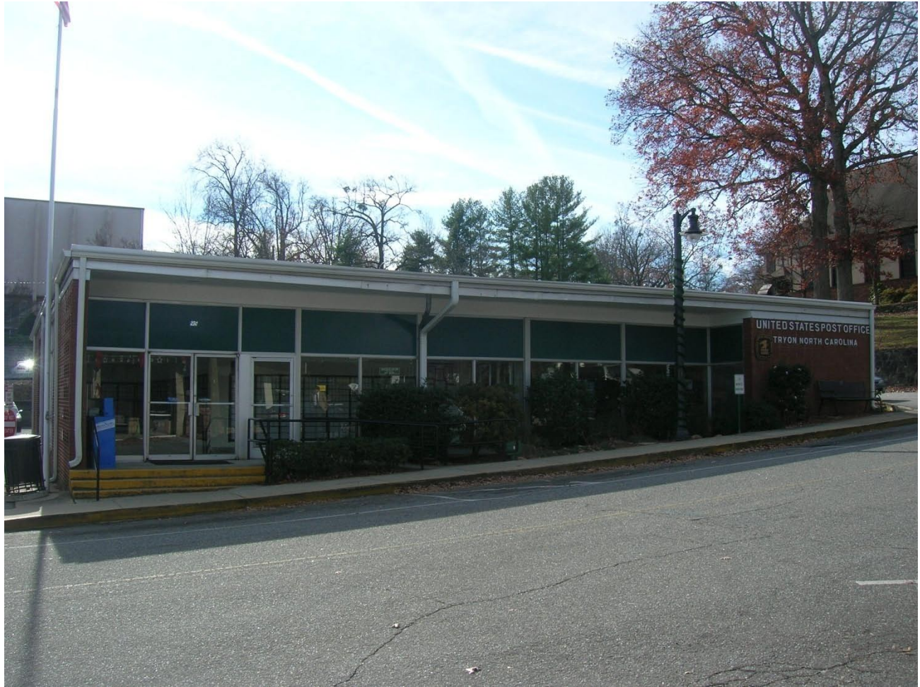
PL 108 – United States Post Office, 95 Pacolet Street