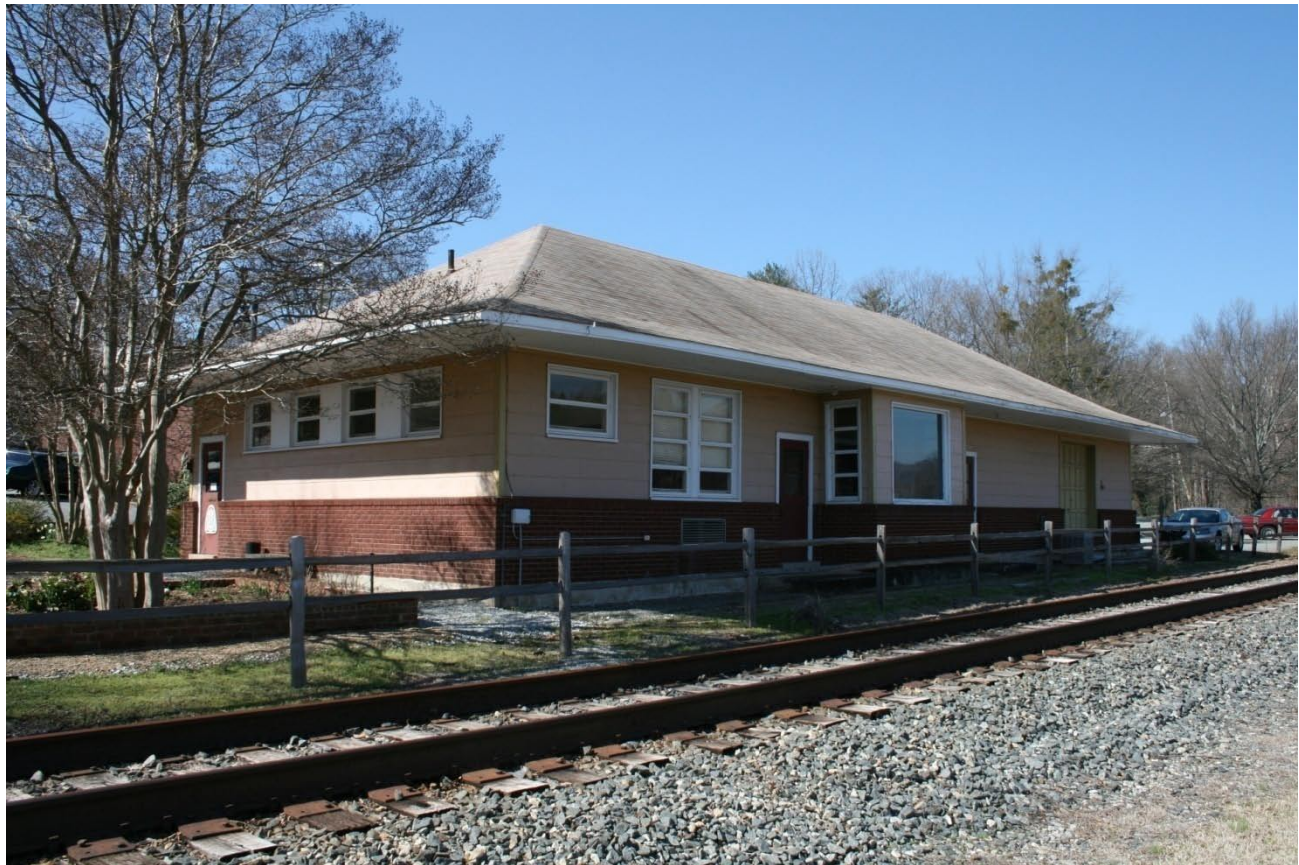
PL 105 – Southern Railway Depot, 22 Depot Street