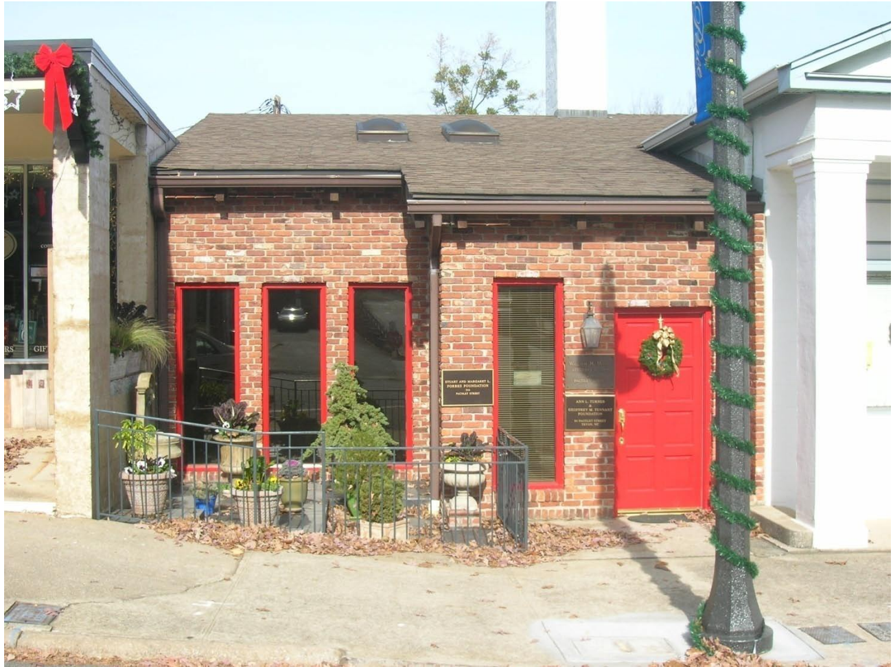
PL 101 – Commercial Building, 84 Pacolet Street