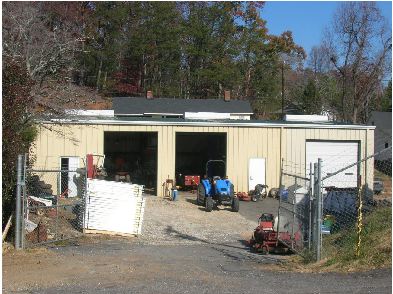
PL 133 – Commercial Building, 65 Palmer Street