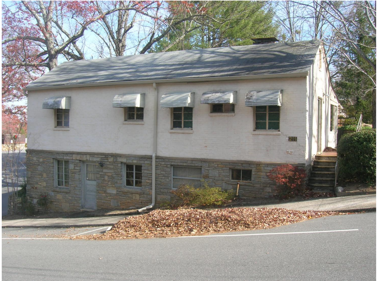
PL 154 – House, 211 Walnut Street