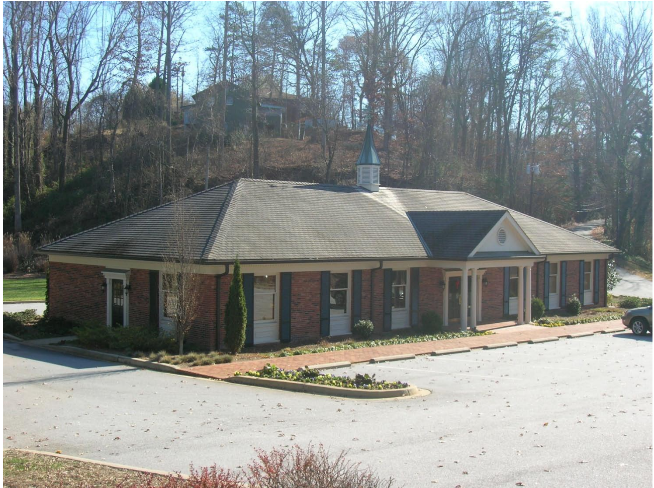
PL 85 – (former) First Union Bank, 255 S. Trade Street