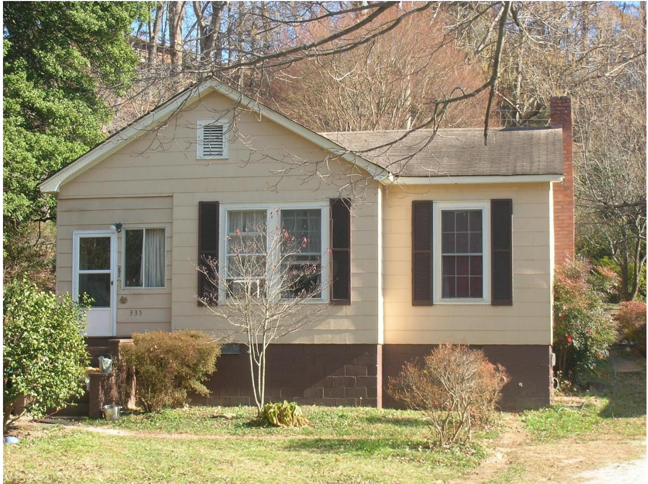
PL 88 – House, 335 S. Trade Street