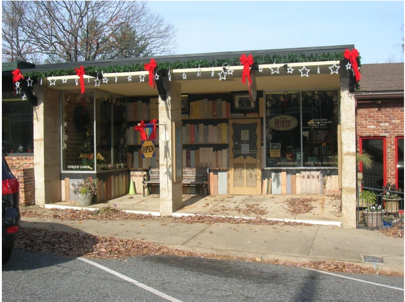
PL 100 – Commercial Building, 90 Pacolet Street