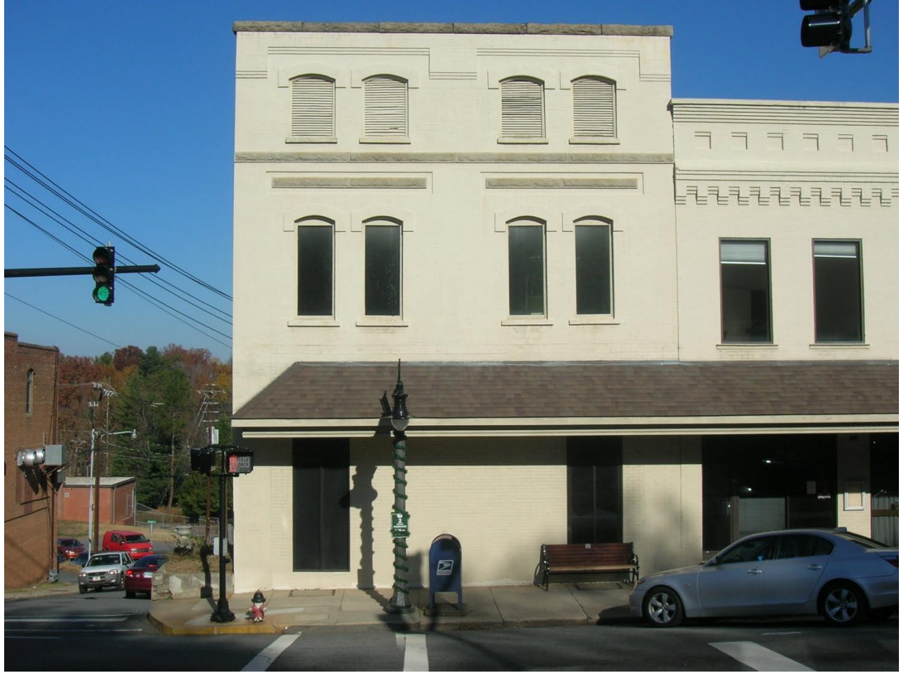
PL 71 – Missildine's Pharmacy, S. Trade Street