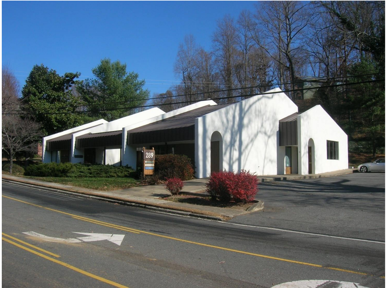
PL 90 – Commercial Building, 289 S. Trade Street