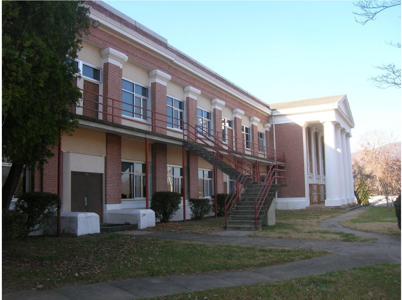
PL 93 – Tryon Elementary School, 100 School Place