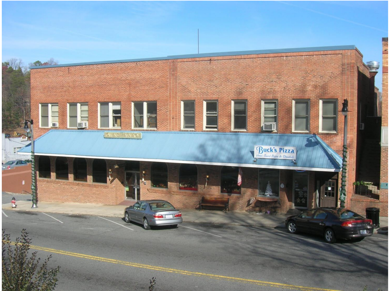
PL 65 – Wilkins Building, 28 N. Trade Street