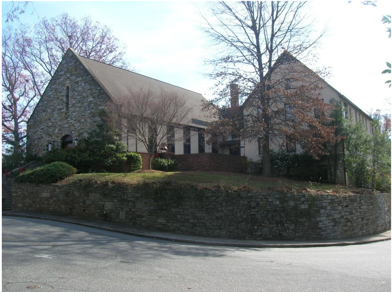
PL 109 – Tryon First Baptist Church, 125 Pacolet Street