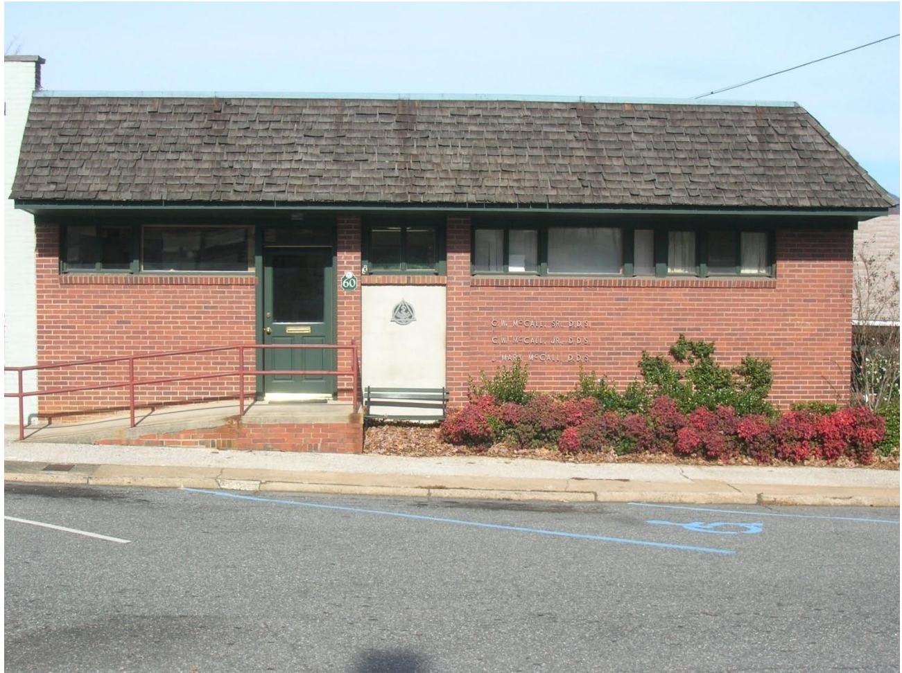
PL 104 – Commercial Building, 60 Pacolet Street