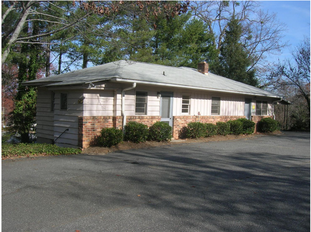
PL 155 – House, 213 Walnut Street