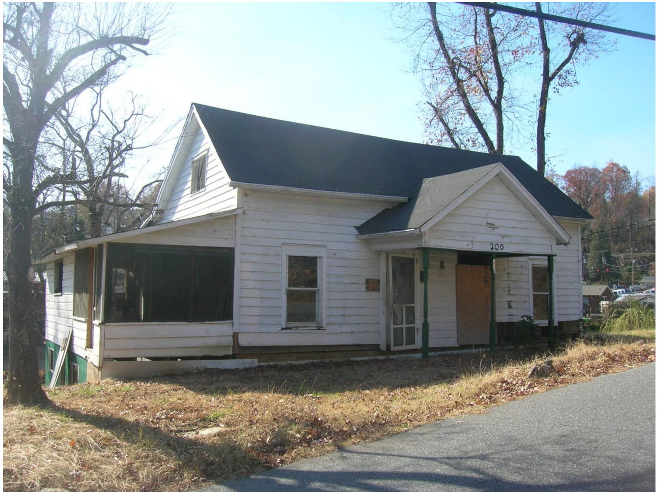
PL 131 – House, 200 E. Howard Street