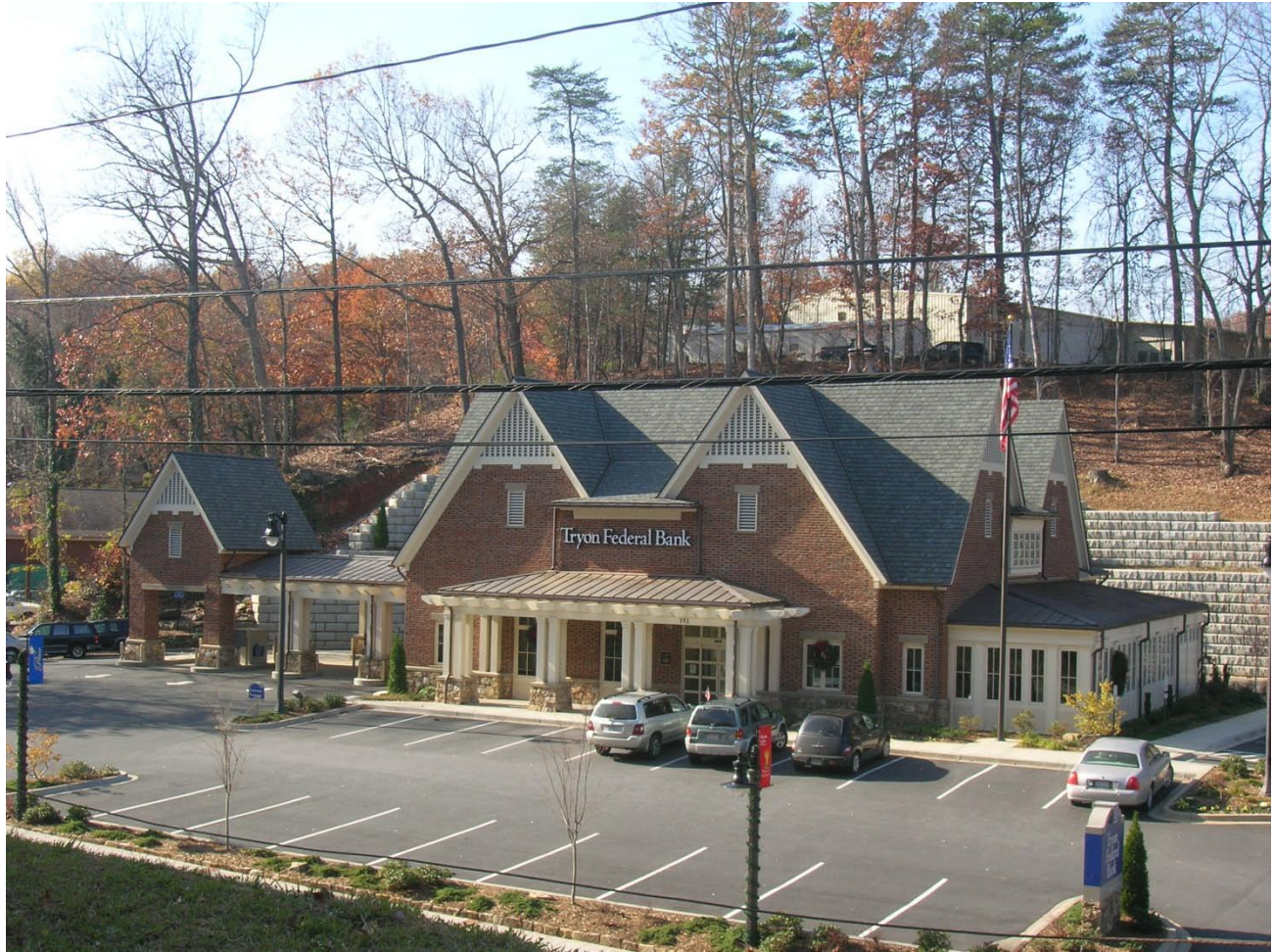
PL 123 – Tryon Federal Savings & Loan Bank, 341 N. Trade Street