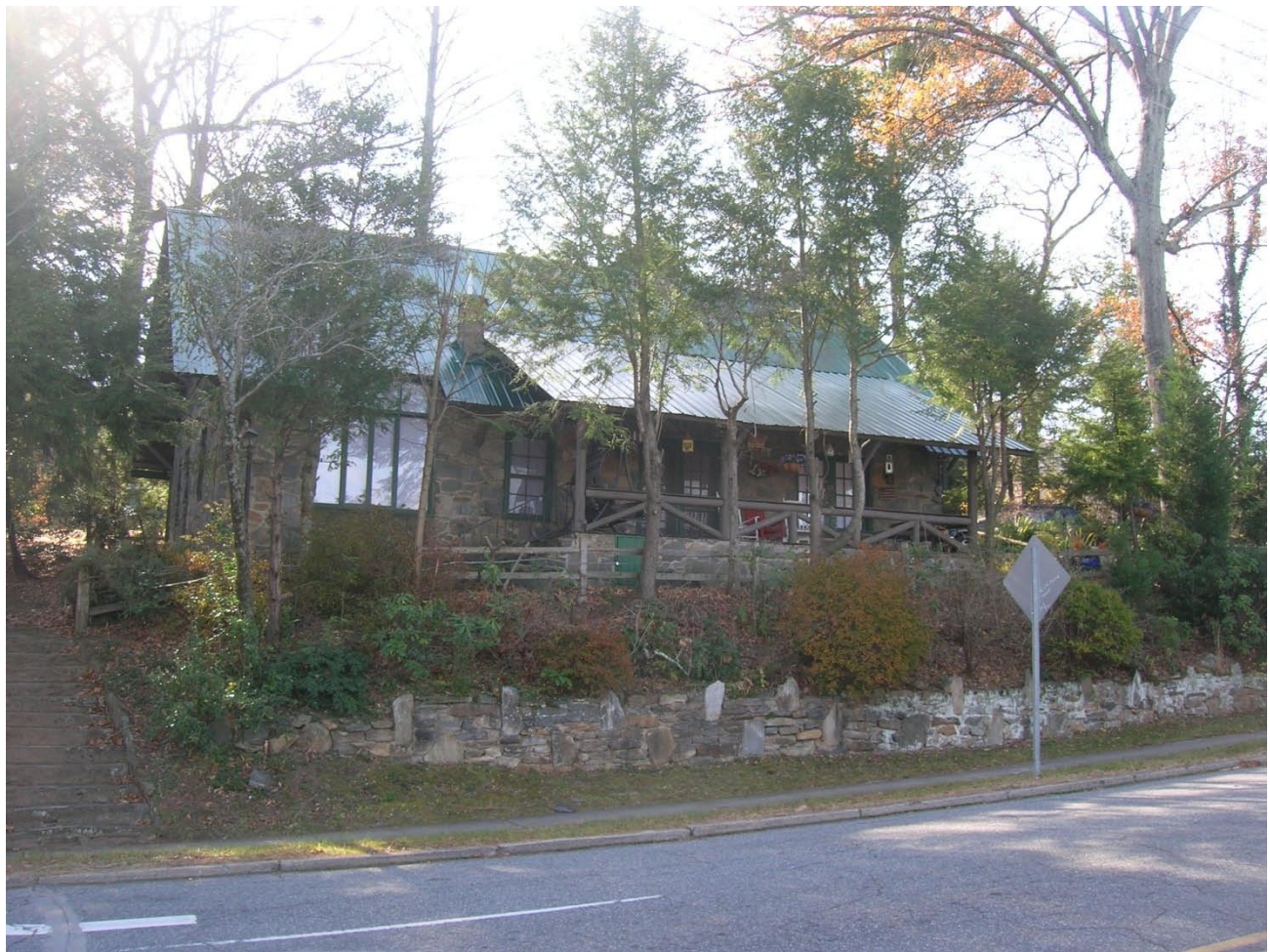
PL 60 – Rock House Art Gallery, 107 Pacolet Street