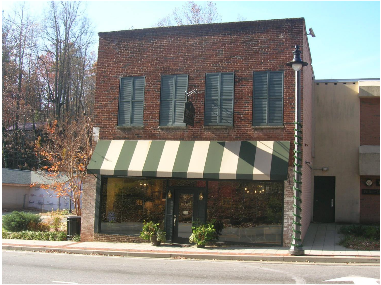
PL 122 – Commercial Building, 285 N. Trade Street