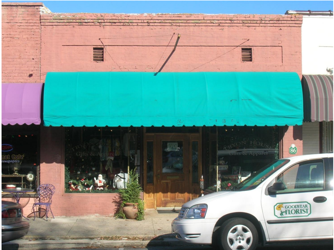
PL 138 – Commercial Building, 86 N. Trade Street