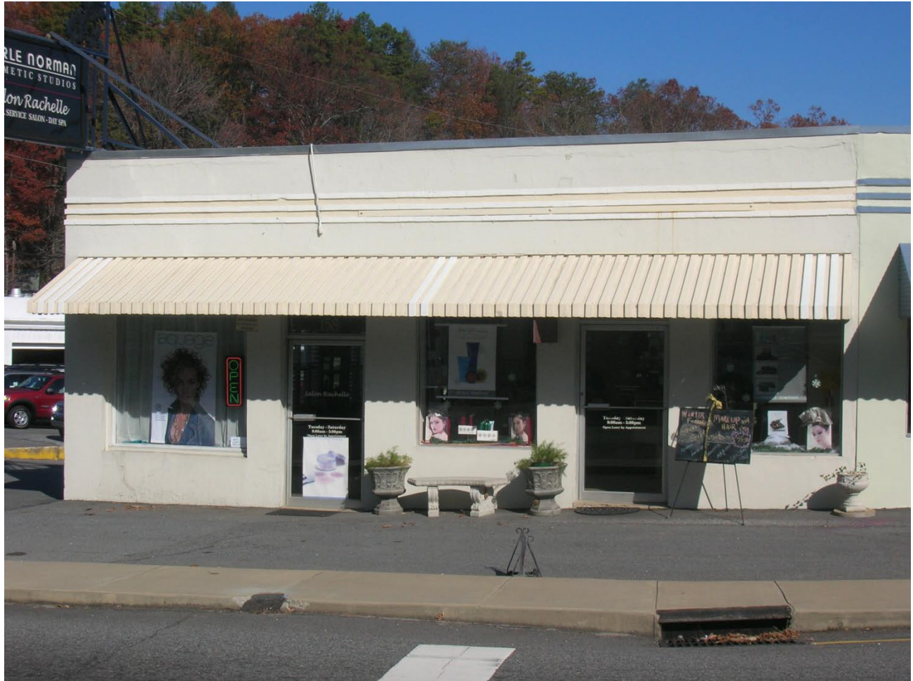
PL 159 – Commercial Building, 158 N. Trade Street