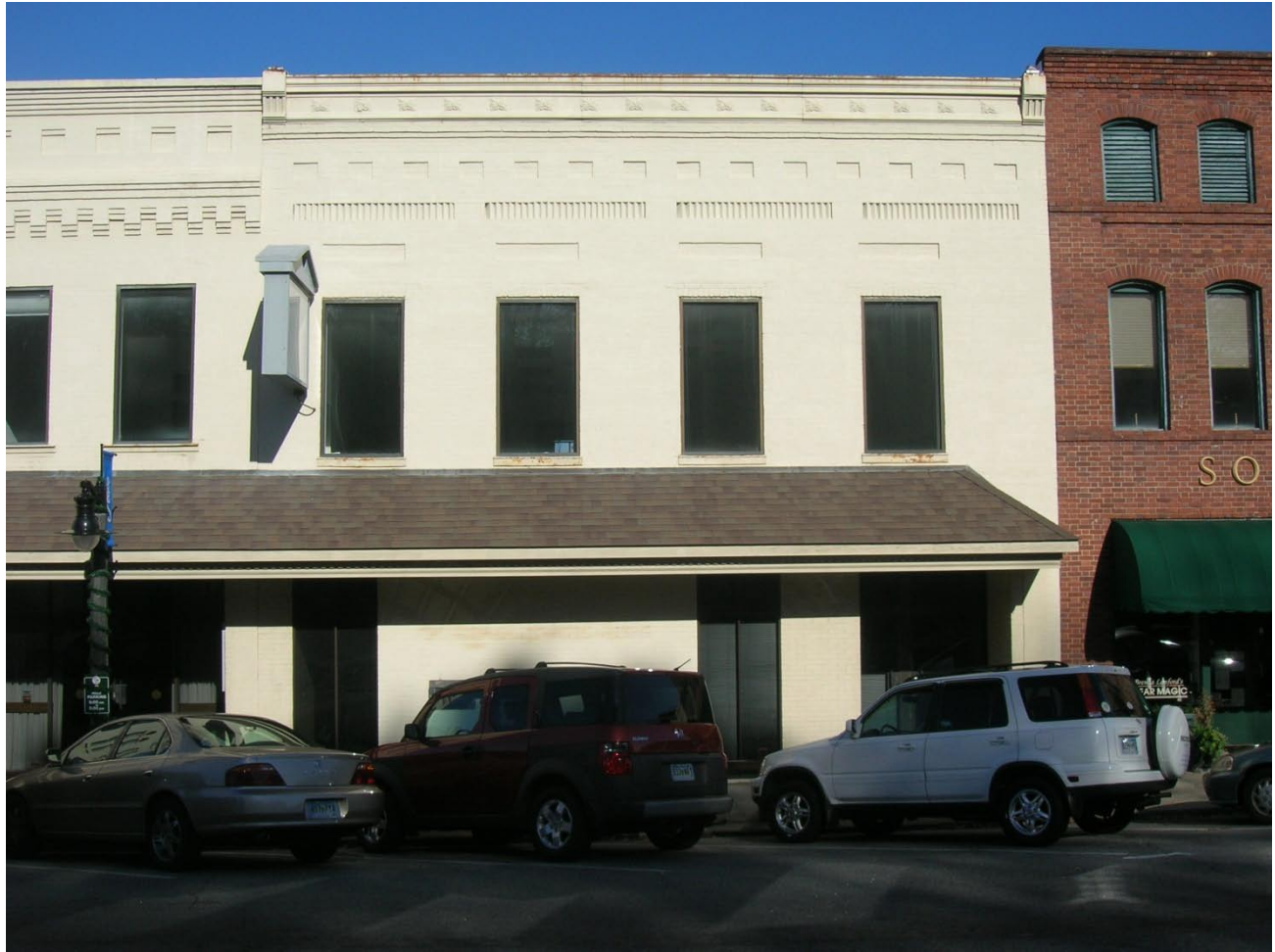
PL 73 – Jackson Building, S. Trade Street