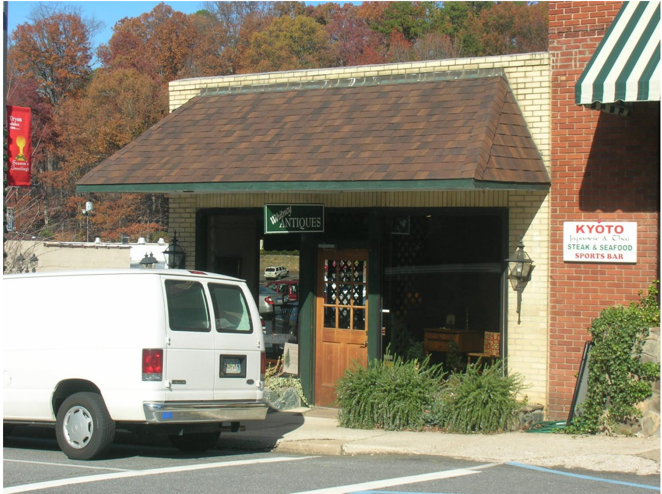
PL 143 – Commercial Building, 120 N. Trade Street