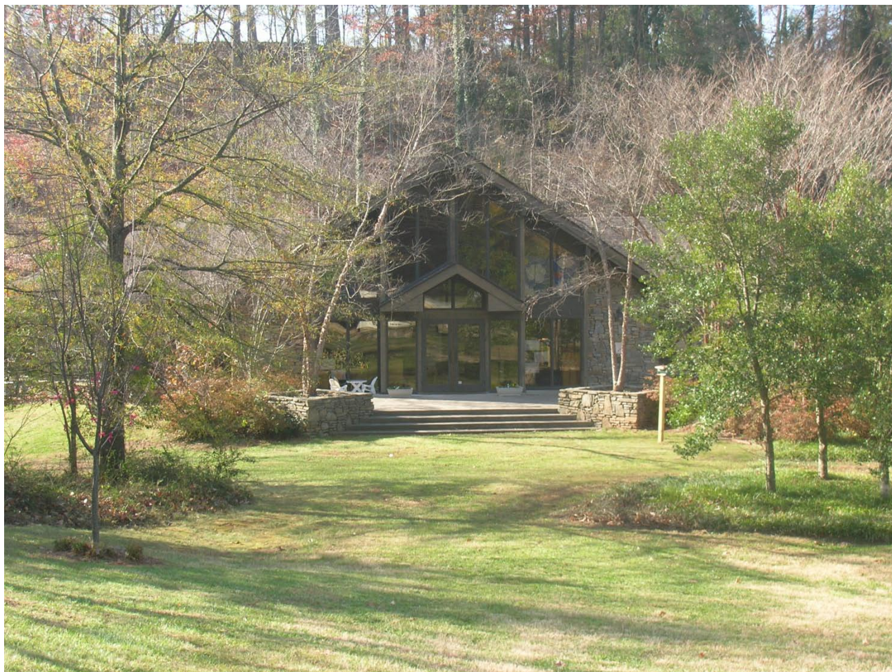
PL 124 – Duke Power Office, 25 School Street