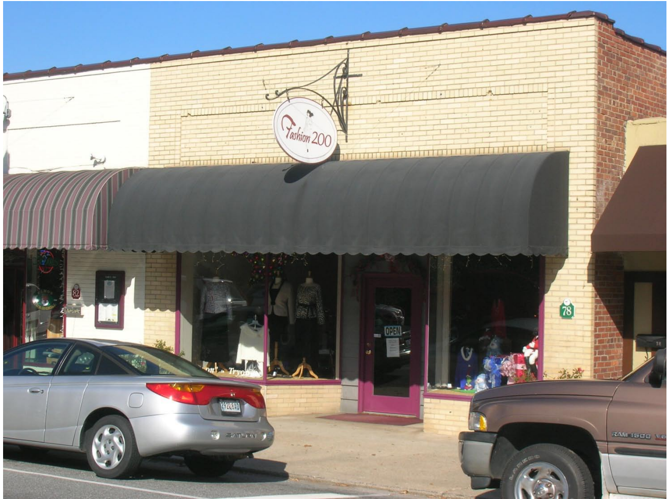
PL 136 – Commercial Building, 78 N. Trade Street