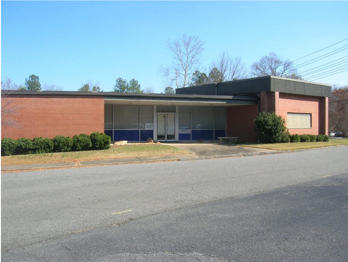
PL 70 – Thermal Belt Telephone Company, 169 Palmer Street