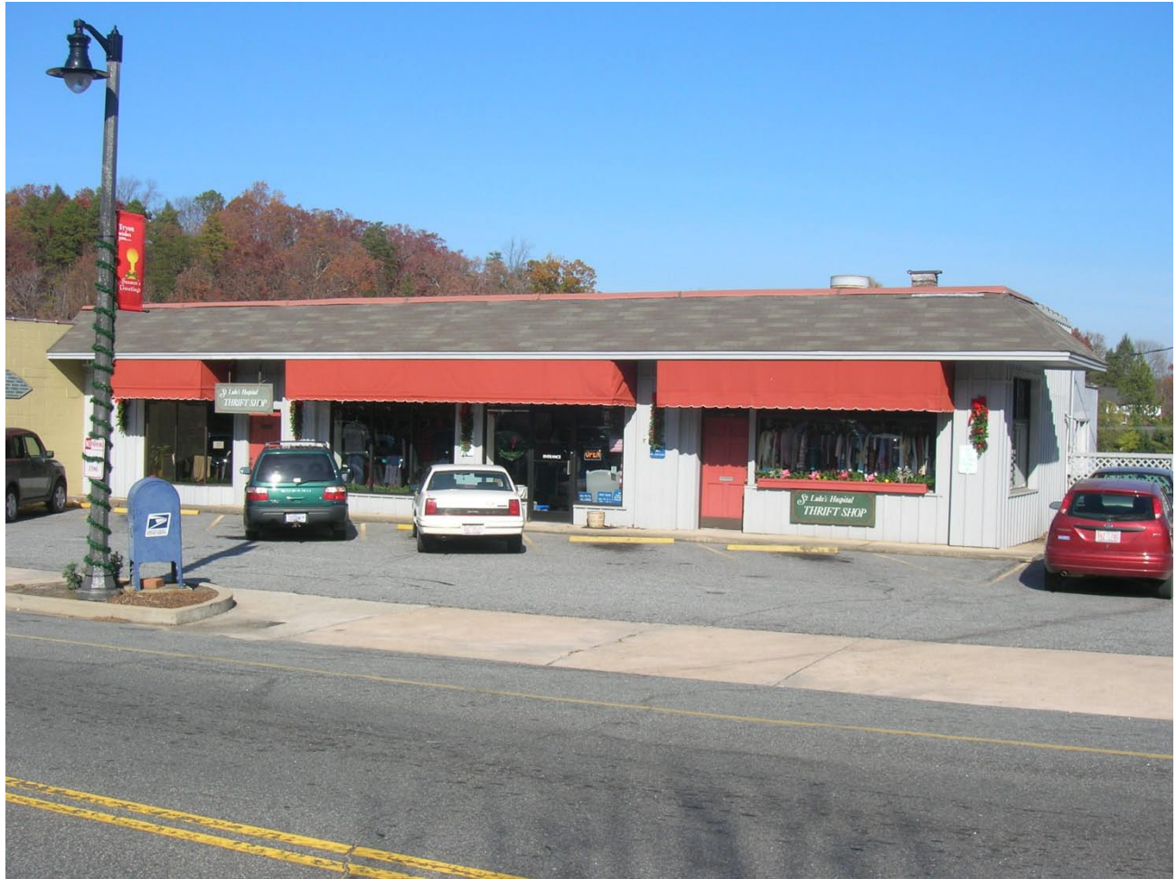
PL 134 – Service Station, 62 N. Trade Street