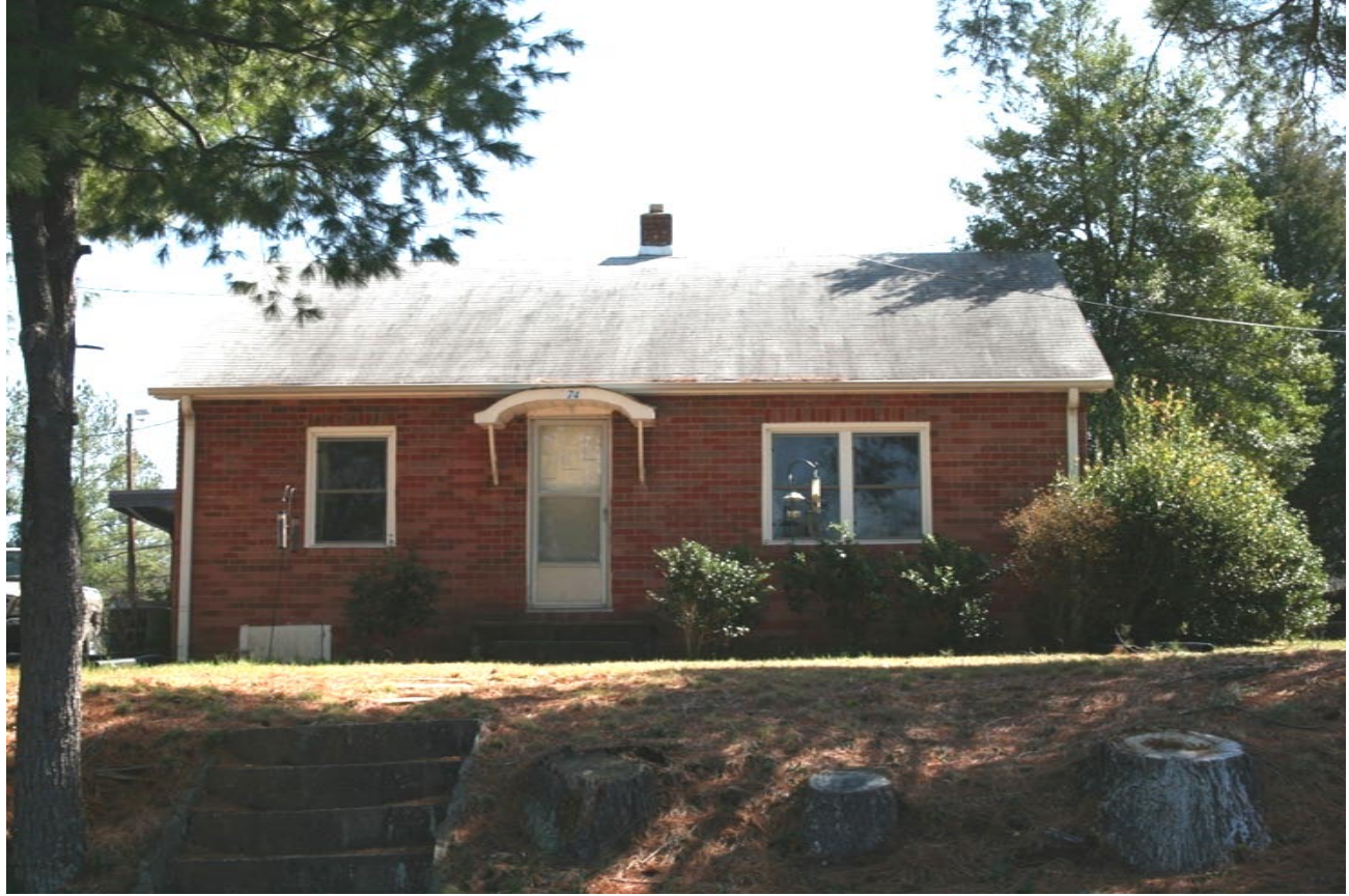
PL 69 – House, 74 Maple Street