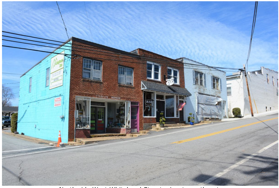
North side West Whitehead Street, view to northeast.