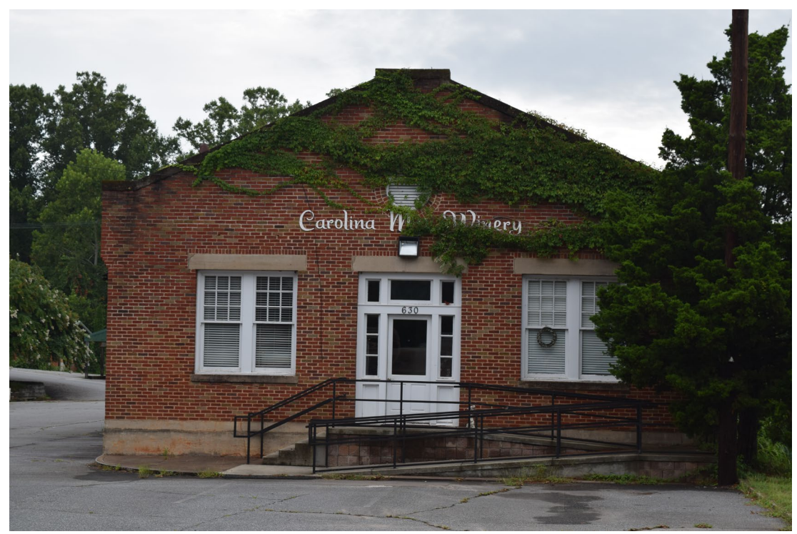
Façade, view east

Southern Railway Freight Station Morganton, Burke County, BK0310, Listed 12/29/2020 Nomination by Sybil H. Argintar, Southeastern Preservation Services Photographs by Sybil H. Argintar, August 2018