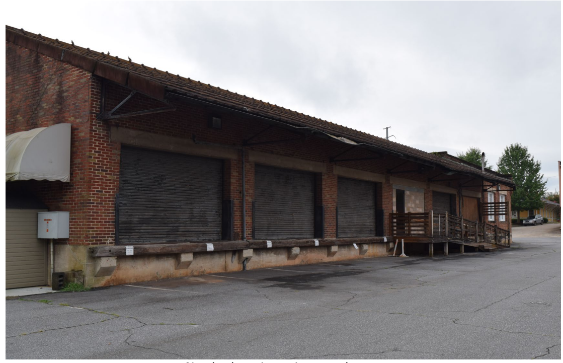
North elevation, view southwest