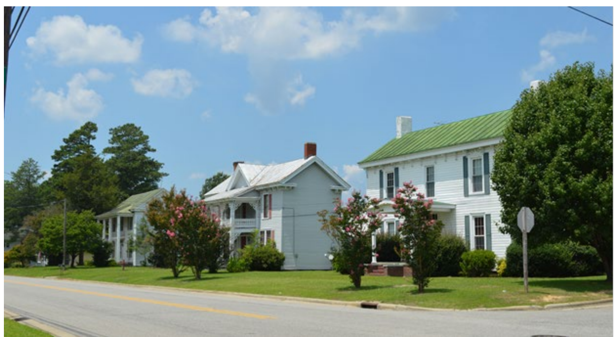
View of 200 block of W. River Street, north side looking west.