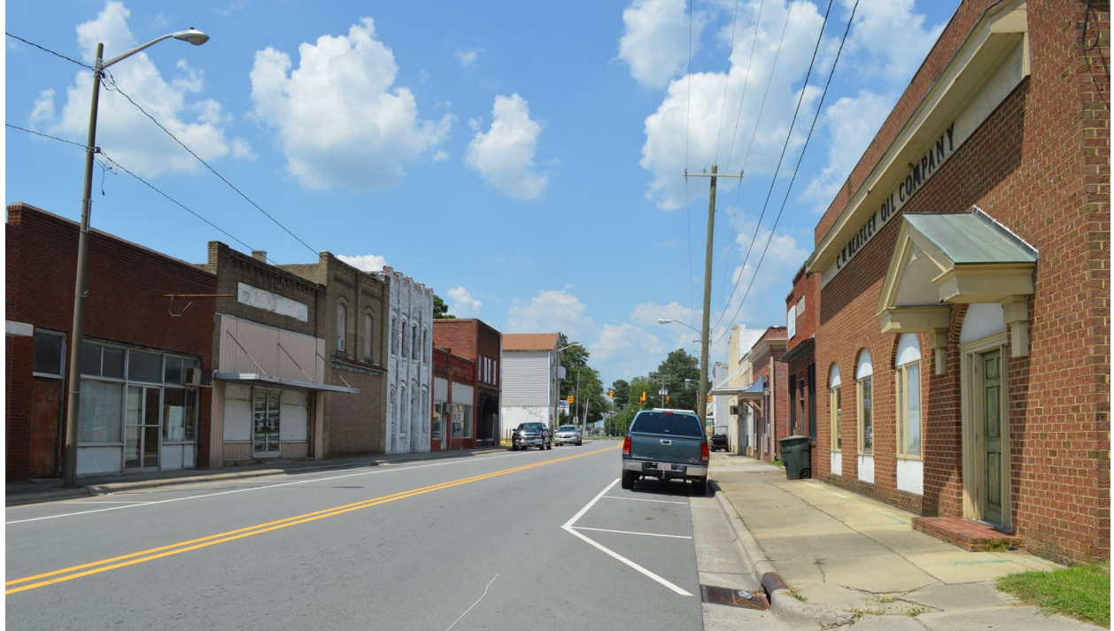
View of South Main Street, looking north.