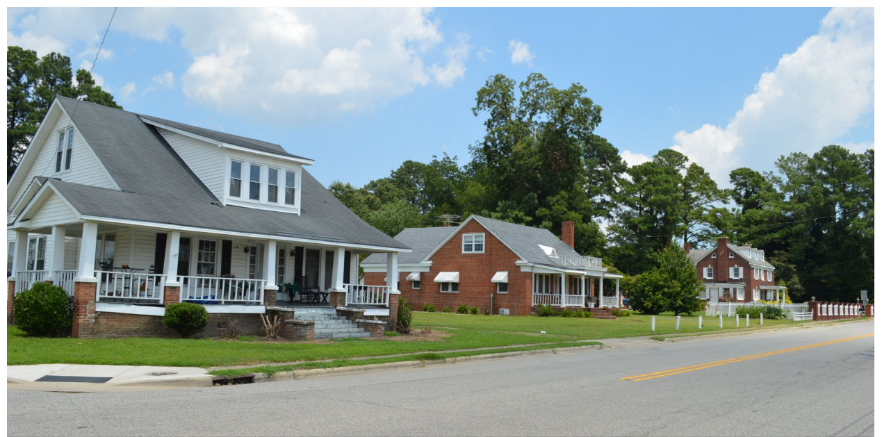
View of 100 block W. River Street, north side looking east.