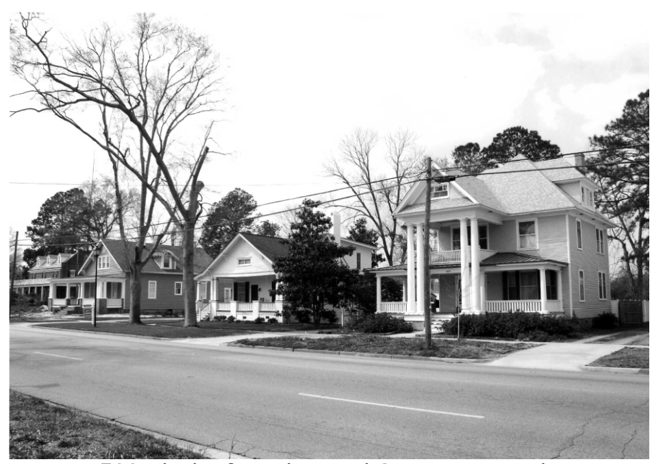
500 Block of North Broad Street, west side