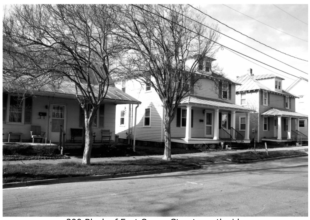
300 Block of East Queen Street, south side