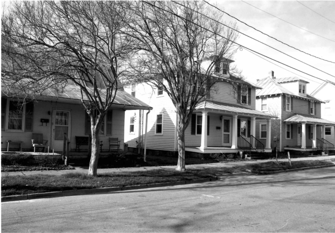
300 Block of East Queen Street, south side