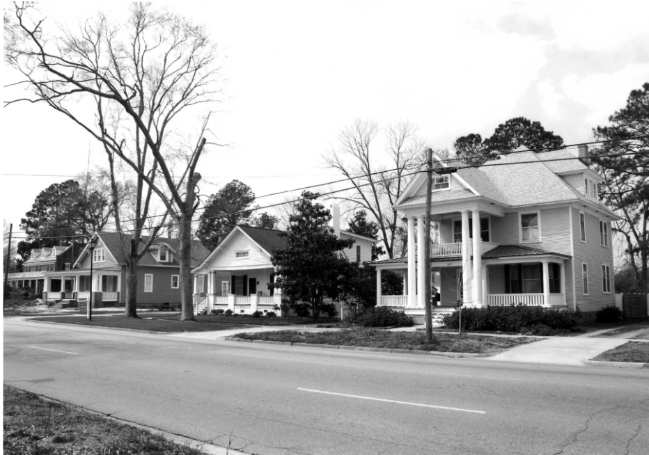
500 Block of North Broad Street, west side

Photographs by Michelle Michael, March 2007