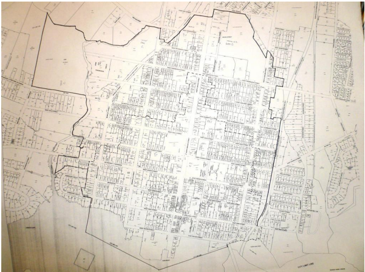
Historic District map