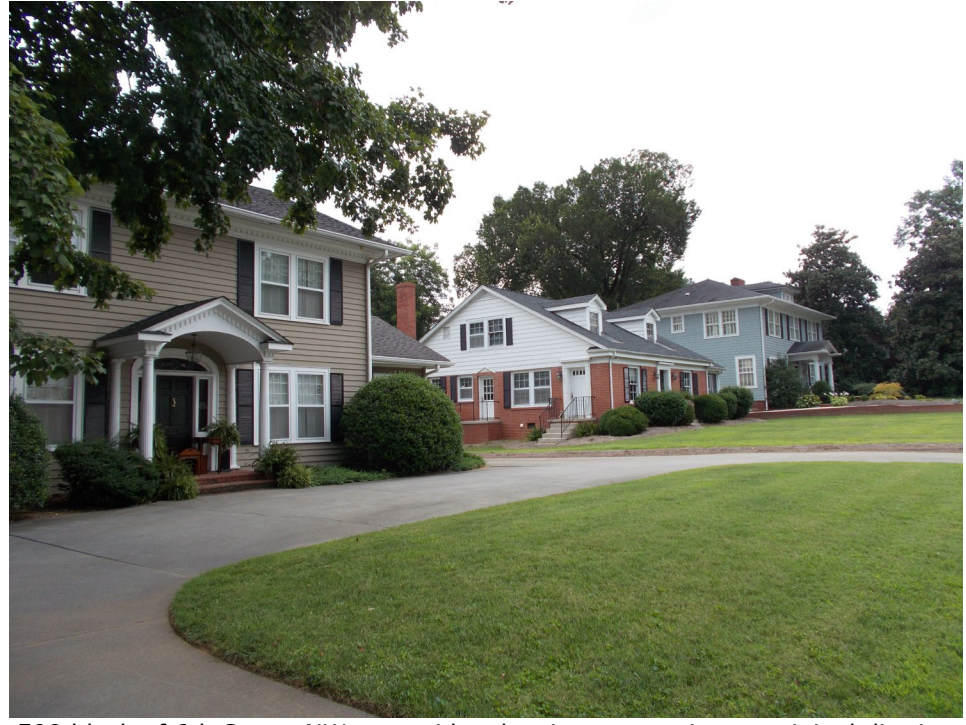
500 block of 6th Street NW, east side, showing connection to original district. View facing southeast.