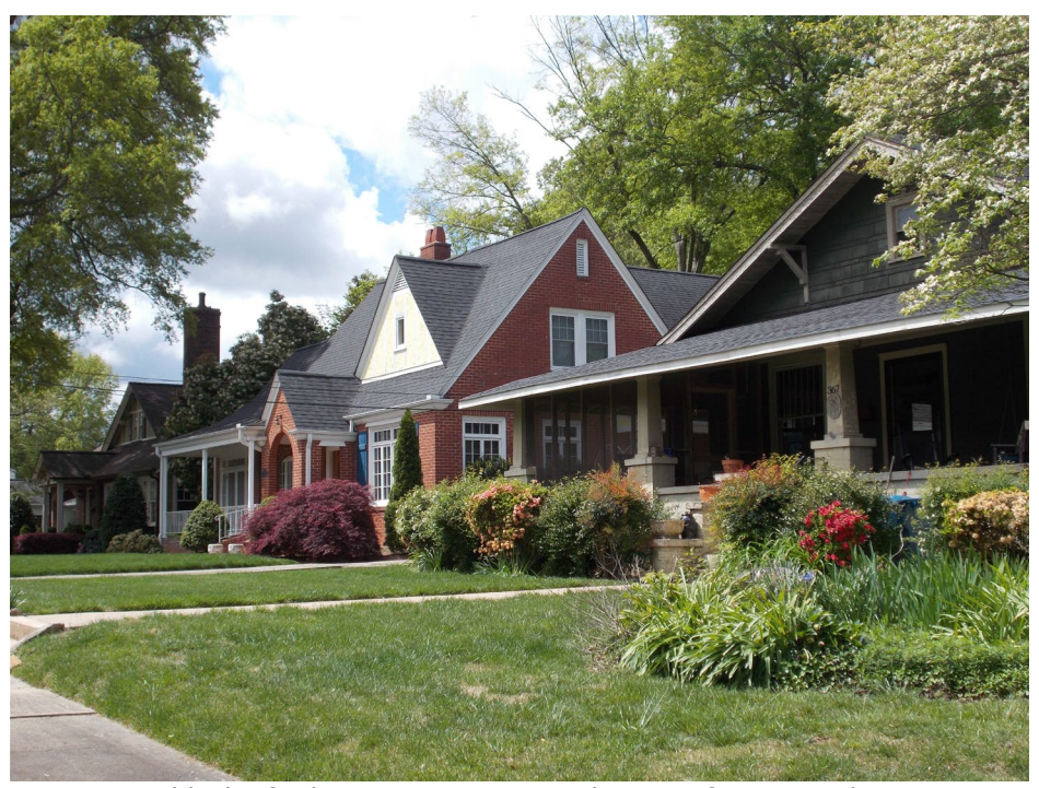
300 block of 7th Street NW, west side. View facing southwest