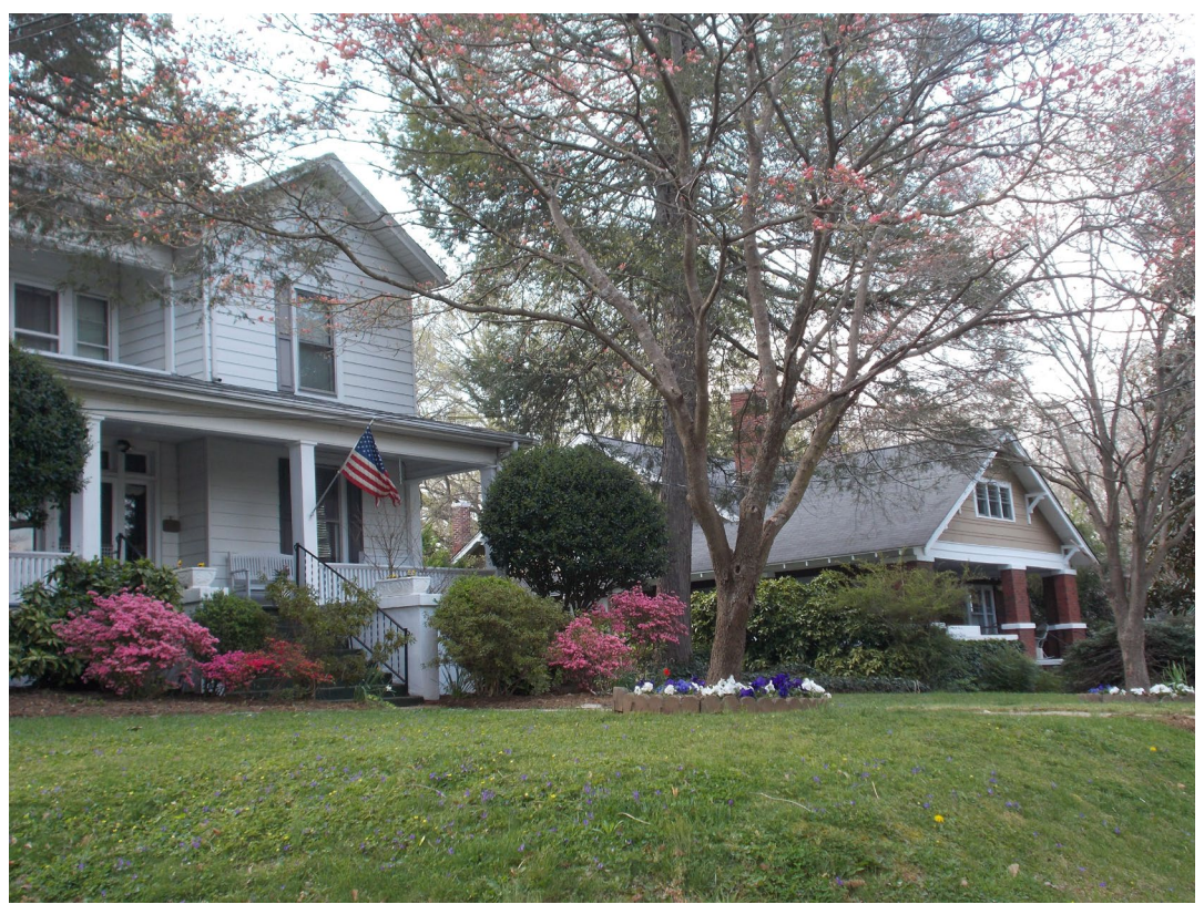
Houses, 300 block of 3rd Street NW, west side. View facing northwest.