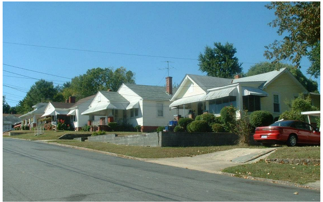
600 Block of Price Street, north side

Durham, Durham County, DH2668, Listed 12/28/2010 Nomination by Heather Wagner Photographs by Heather Wagner, September 2005 and December 2009