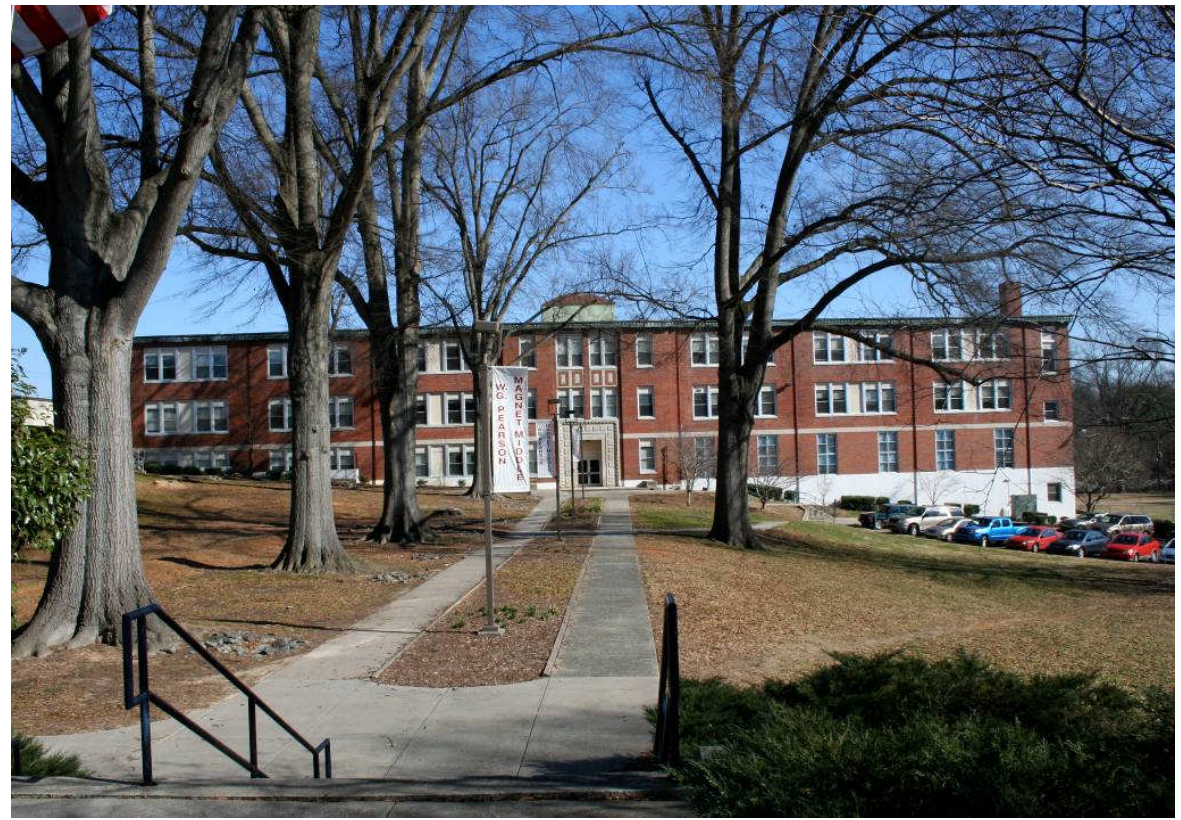
W. G. Pearson Elementary School, 600 East Umstead Street