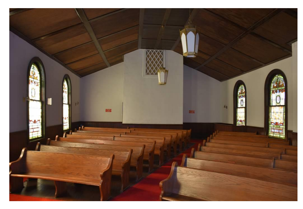
6. 1921 sanctuary, looking west and 7. 1921 north wing, looking north

Section number Photos Page 25 St. Stephen United Methodist Church Davidson County, NC