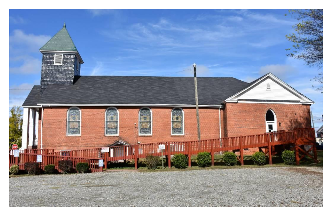
2. South elevation (above) and 3. Northwest oblique (below)

Section number Photos Page 23 St. Stephen United Methodist Church Davidson County, NC