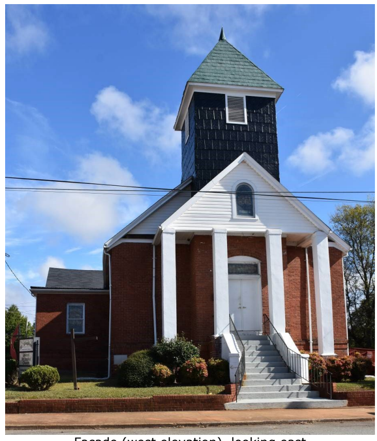
Façade (west elevation), looking east