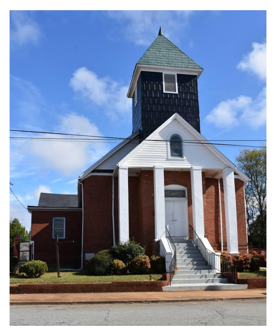
1. Façade (west elevation), looking east