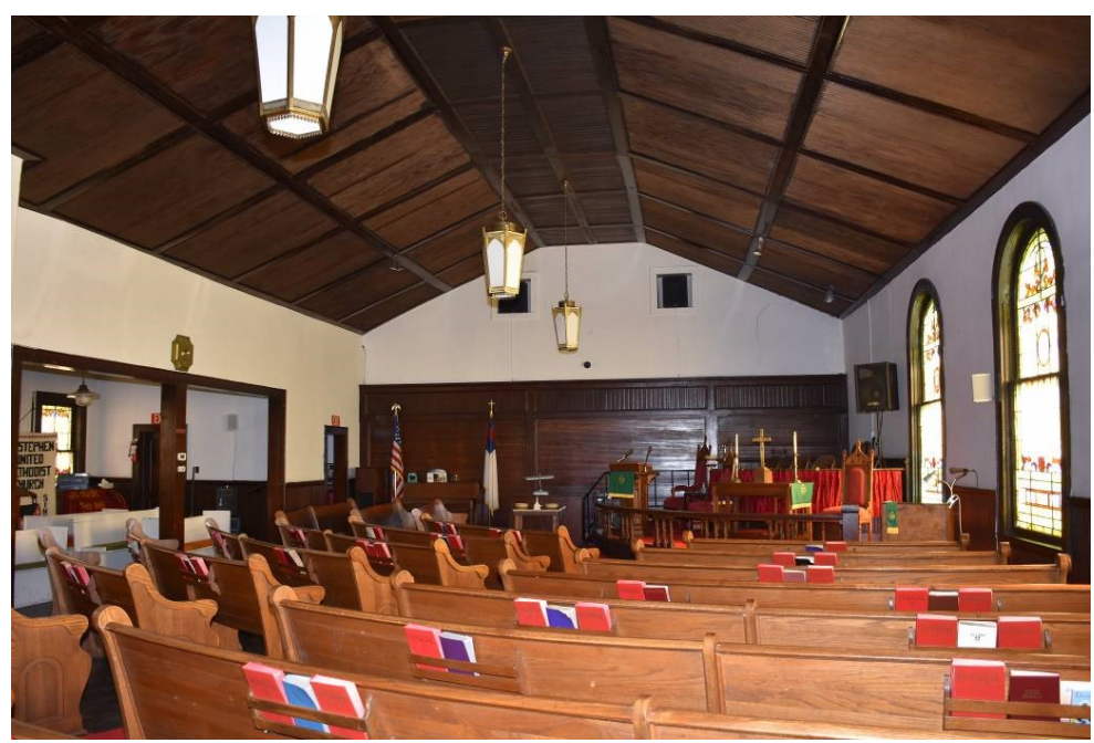
1921 sanctuary, looking east