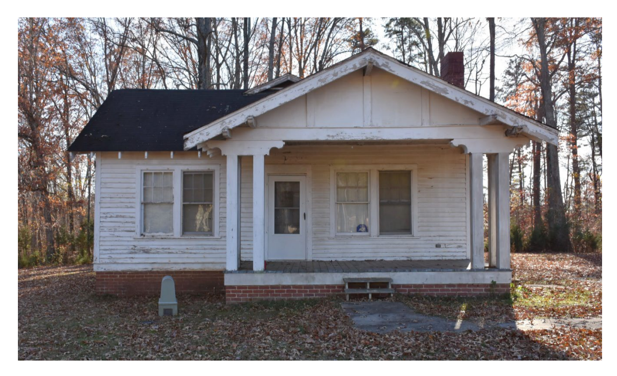
8. Brightside Cottage, north elevation (below) and 9. Tea House, north elevation (below)

Palmer Memorial Institute Historic District (Additional Documentation) Guilford County, NC