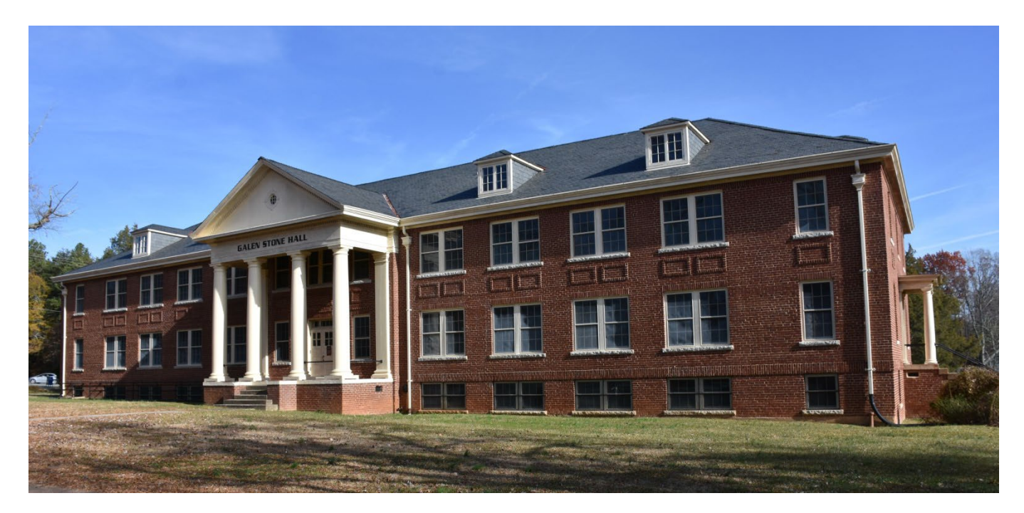
1. Galen Stone Hall, west elevation

Digital images located at the North Carolina Department of Natural and Cultural Resources.