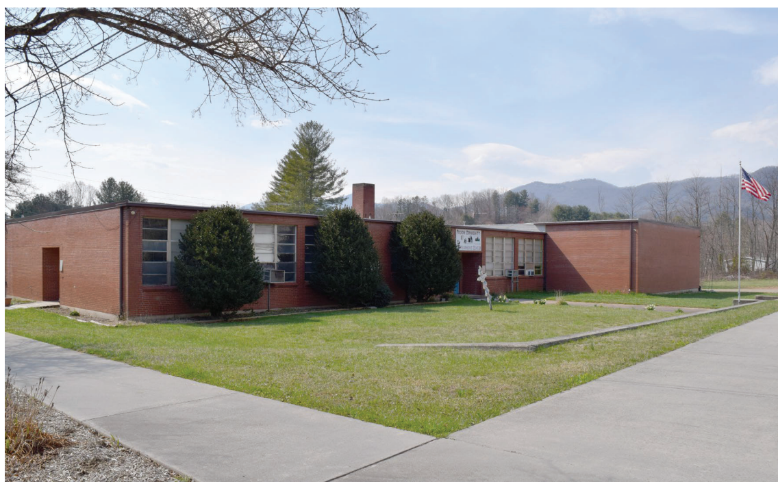
Site and building location, view southwest.

Pigeon Street School Waynesville, Haywood County, HW0128, Listed 4/26/2021 Nomination by Sybil Argintar, Southeastern Preservation Services Photographs by Sybil Argintar, March 2018