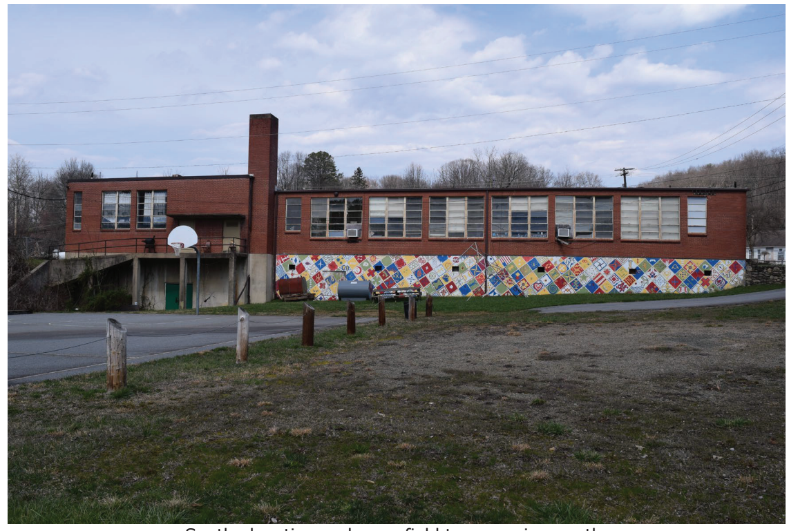
South elevation and open field to rear, view north.