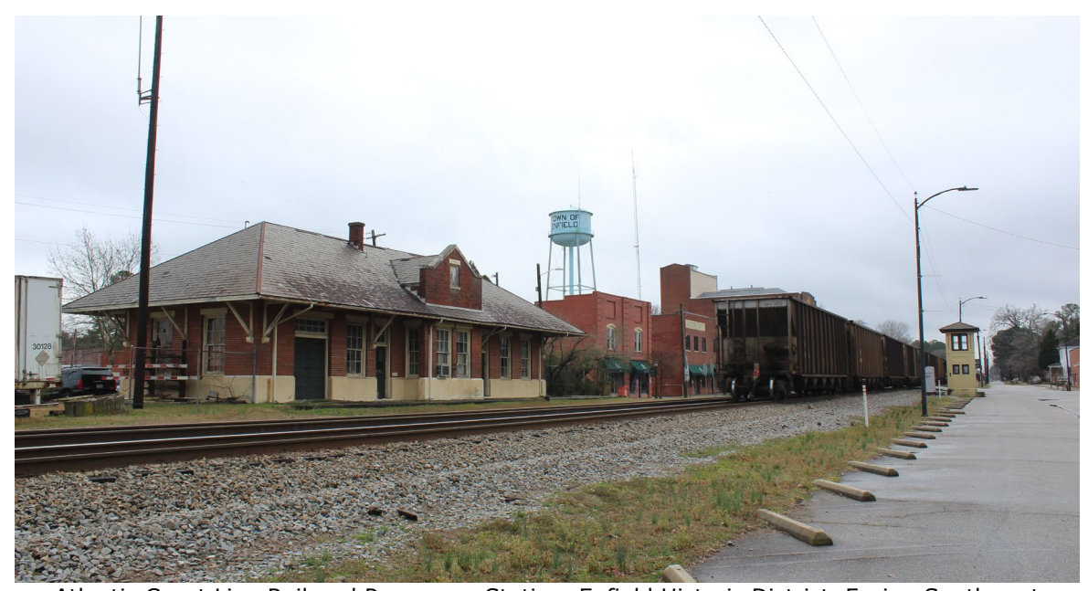
Atlantic Coast Line Railroad Passenger Station, Enfield Historic District, Facing Southwest