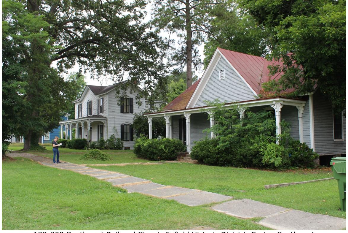
122-200 Southwest Railroad Street, Enfield Historic District, Facing Southwest