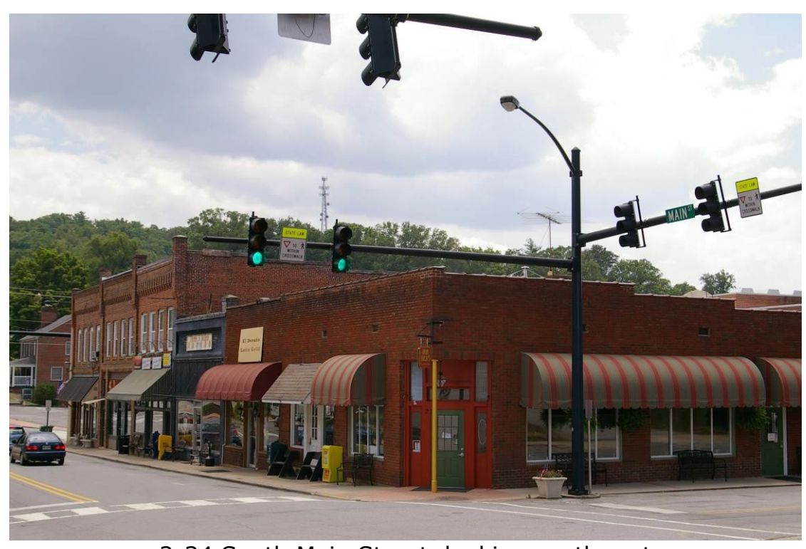
2-34 South Main Street, looking southwest