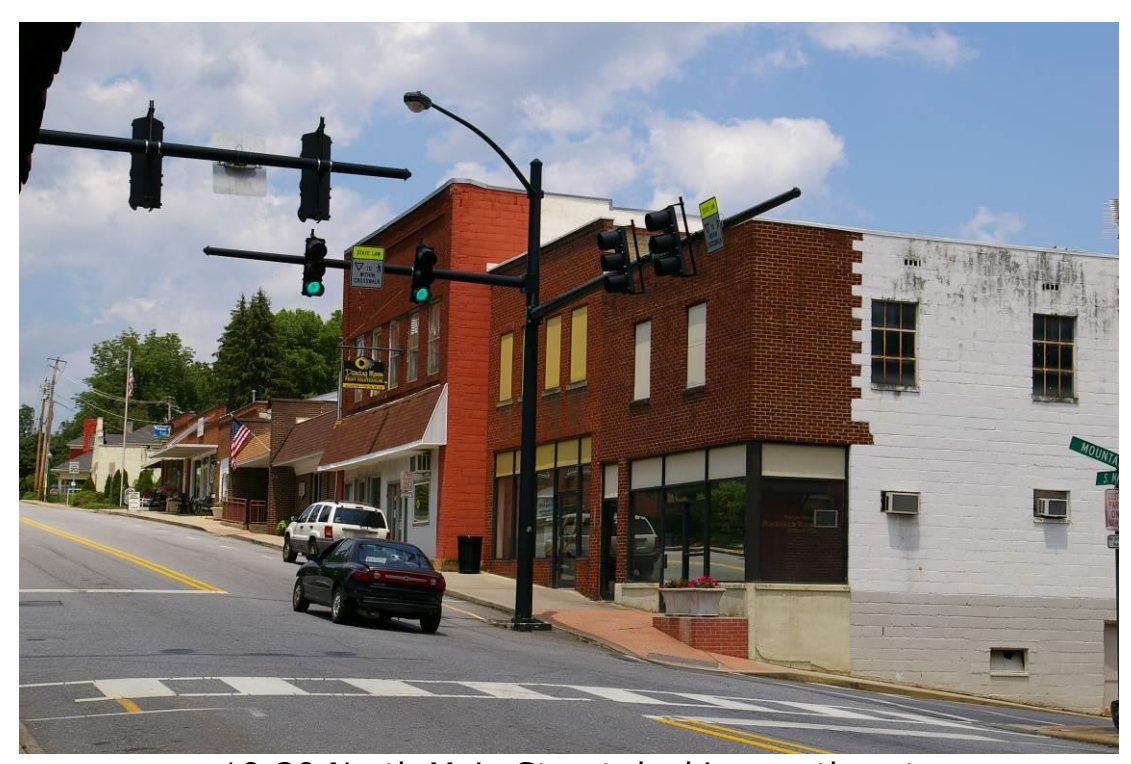
10-20 North Main Street, looking northeast

Mars Hill, Madison County, MD0284, Listed 09/08/2015 Nomination by Sybil Argintar Photographs by Sybil Argintar, July 2014