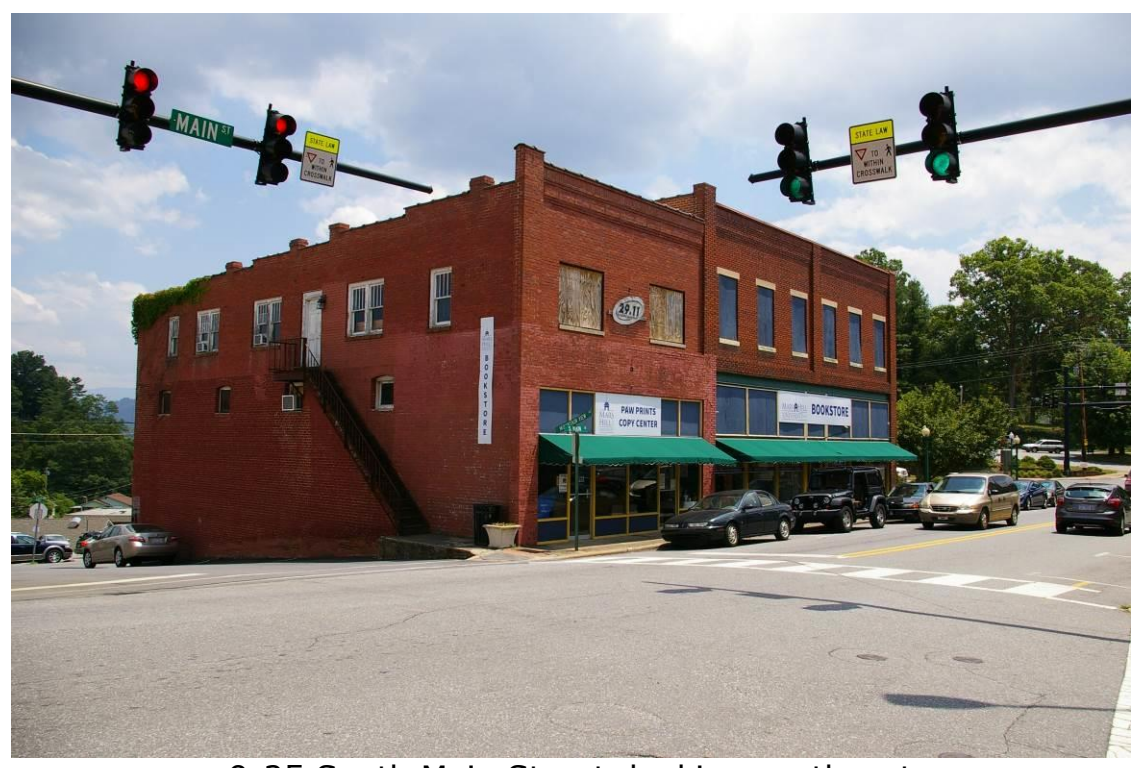
9-25 South Main Street, looking southeast