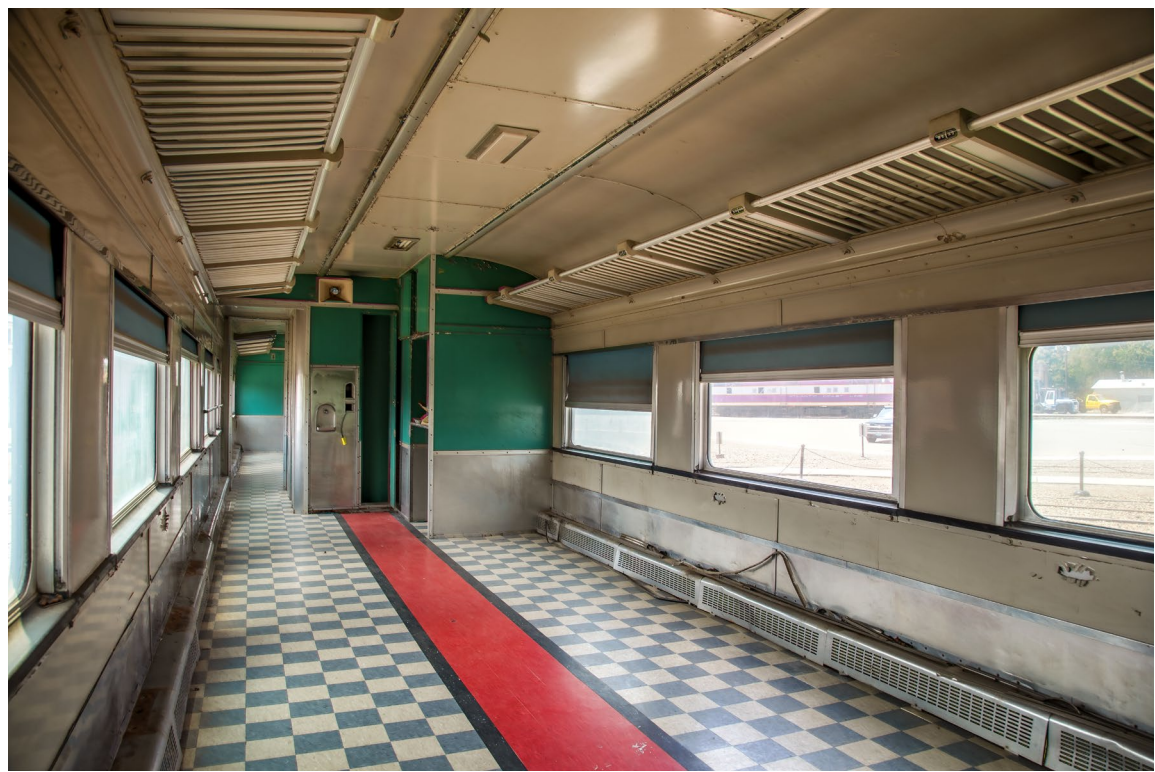
Black passenger area facing men's lounge