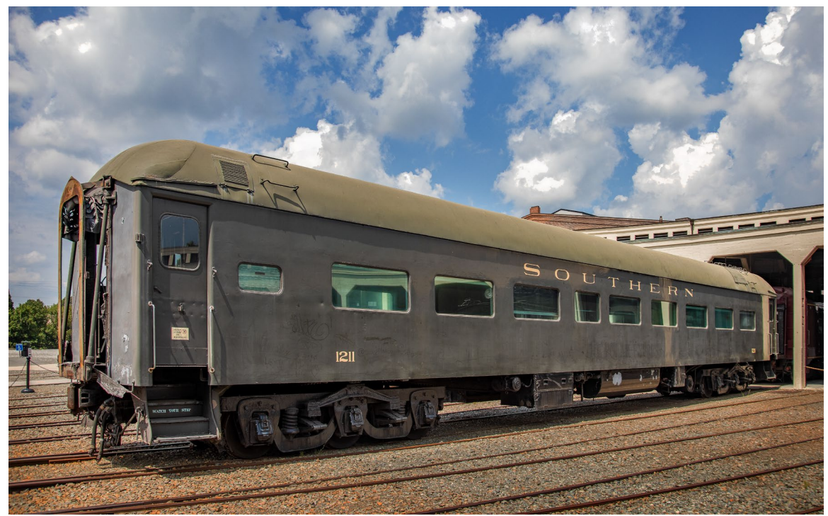
Side of car