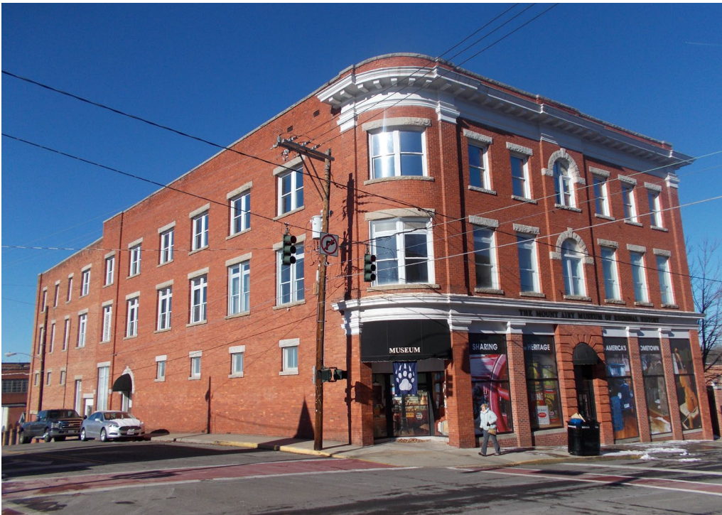
Merritt Building, 301-307 N. Main (SR0319). View facing northwest.