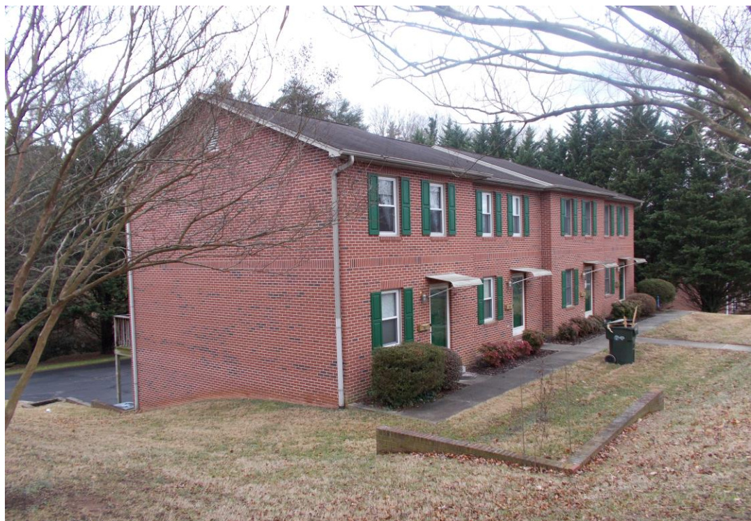
Area A, 409 Franklin with 419 Franklin beyond, view facing west.