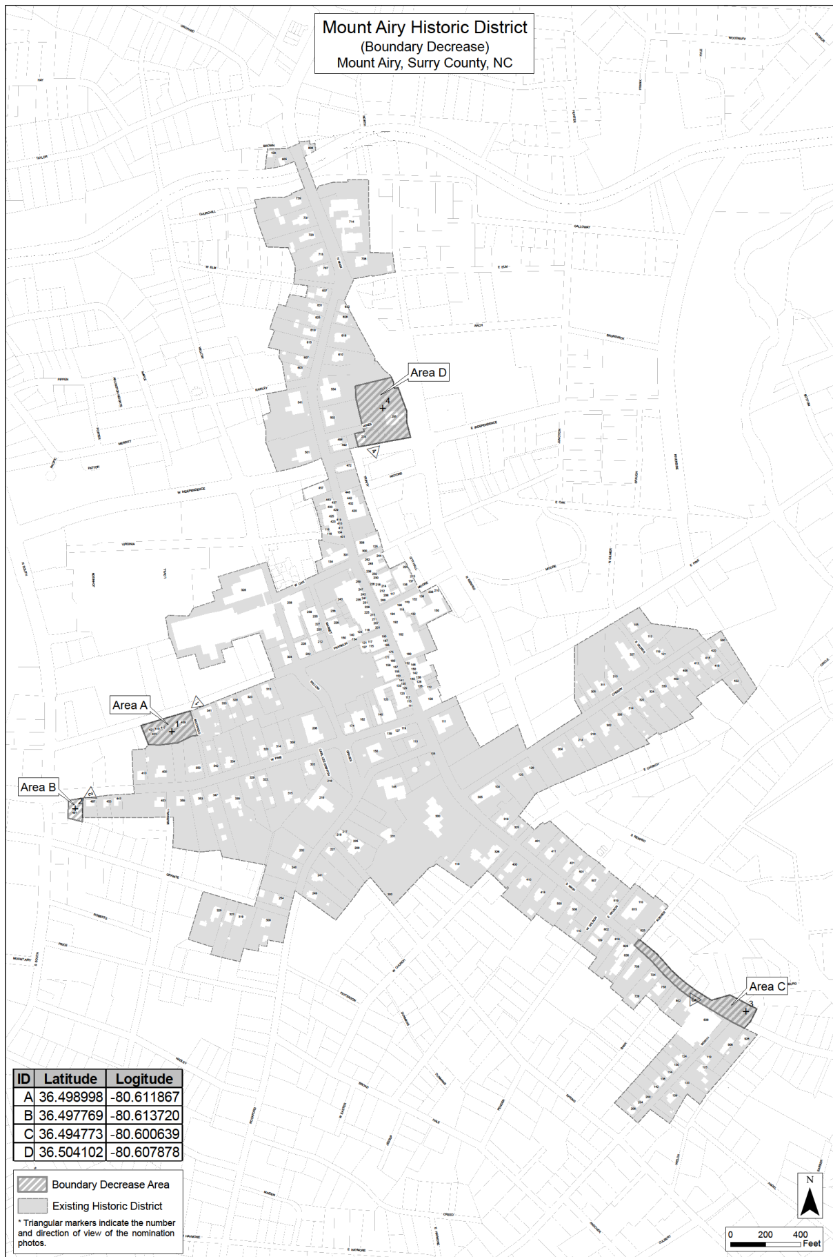
Mount Airy Historic District (Boundary Decrease) Boundary Map