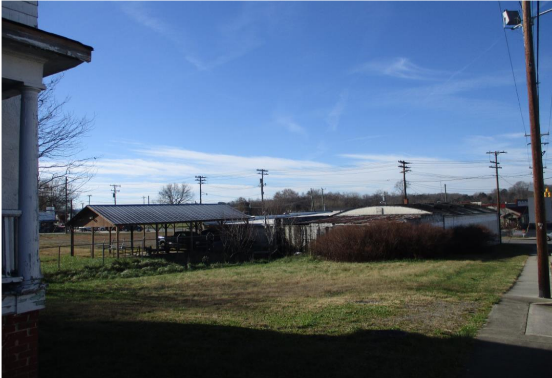
Area B, 481 W. Pine, view facing west.

Photographs by J. Daniel Pezzoni, January 2018