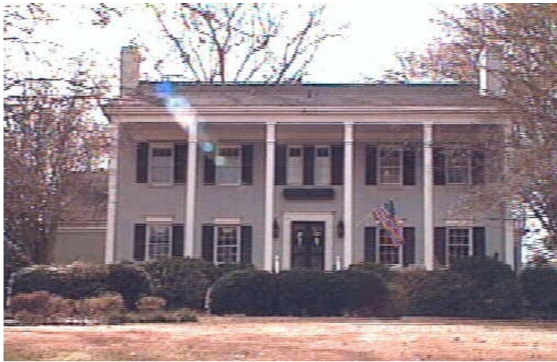
1995 photograph of the c. 1950 Bradshaw House, formerly at 847 Holt Drive, demolished in 2007.

http://services.wakegov.com/realestate .