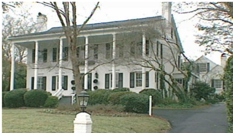
2000 photograph of the c. 1950 Bradshaw House, formerly at 847 Holt Drive, demolished in 2007. Guest house is visible at rear of main house, demolished 2014.

Paperwork Reduction Act Statement: This information is being collected for applications to the National Register of Historic Places to nominate properties for listing or determine eligibility for listing, to list properties, and to amend existing listings. Response to this request is required to obtain a benefit in accordance with the National Historic Preservation Act, as amended (16 U.S.C.460 et seq.).