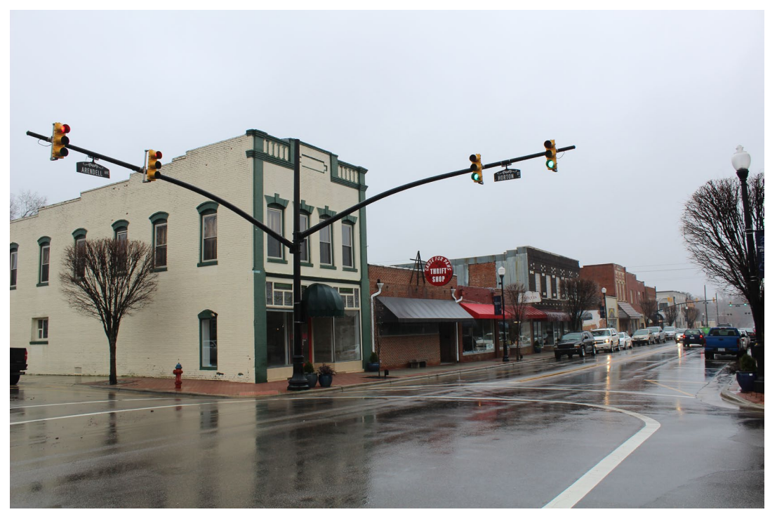
100-130 North Arendell Avenue; Facing Southeast

Nomination by Heather Slane, hmwPreservation and Cheri Szcodronski, Firefly Preservation Consulting Photographs by Cheri Szcodronski and Preservation Zebulon, February and June 2019; November and December 2020