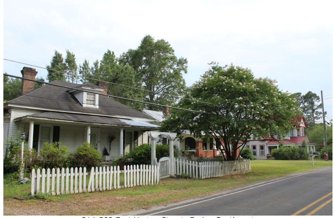
214-302 East Horton Street; Facing Southwest